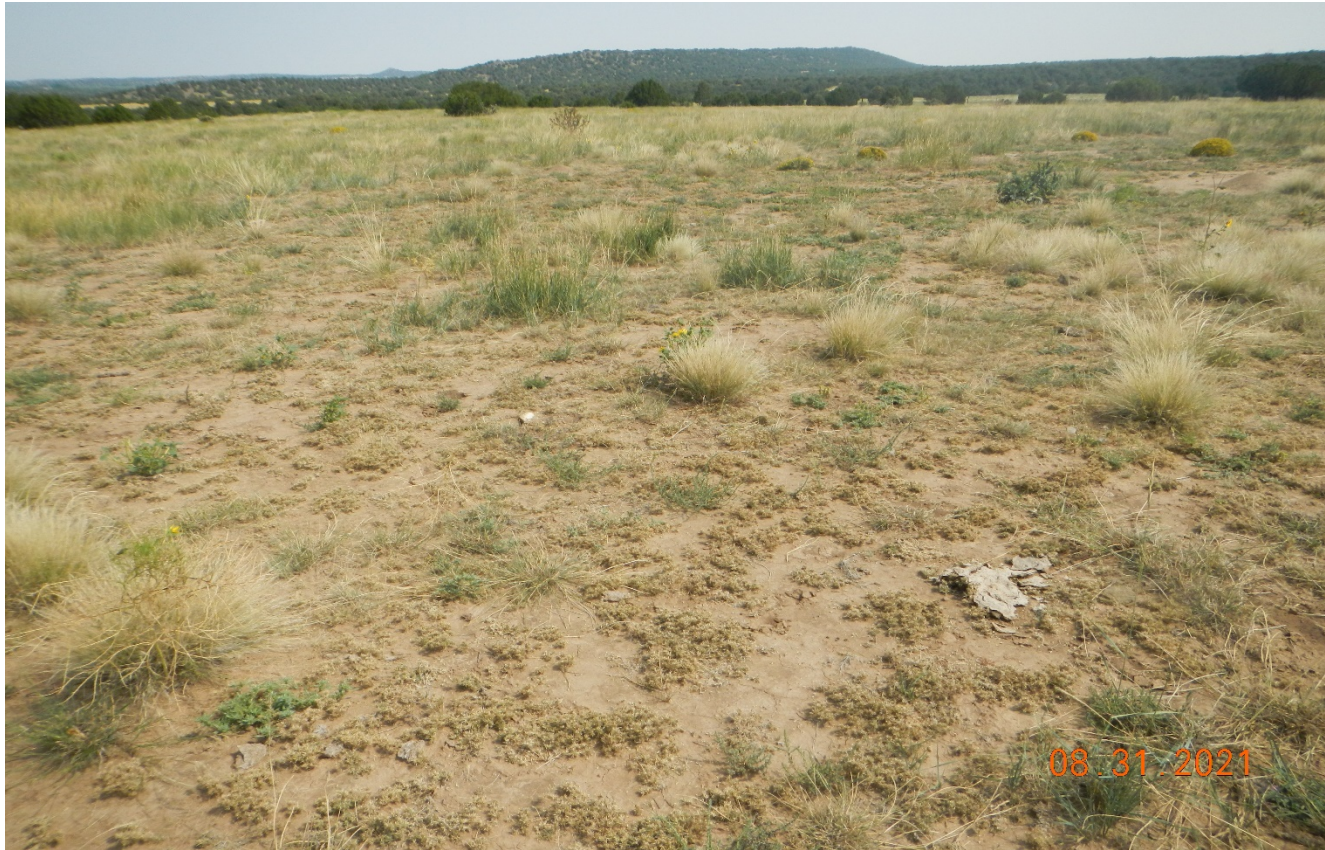
Photo 4. Facing east at the location. Perennial vegetation is progressing throughout the location.