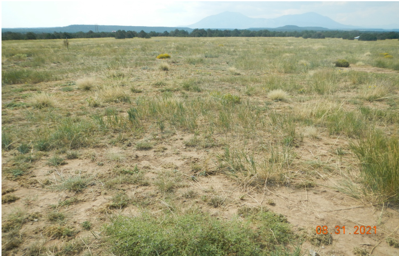
Photo 5. Facing south at the location. Perennial vegetation is progressing throughout the location.