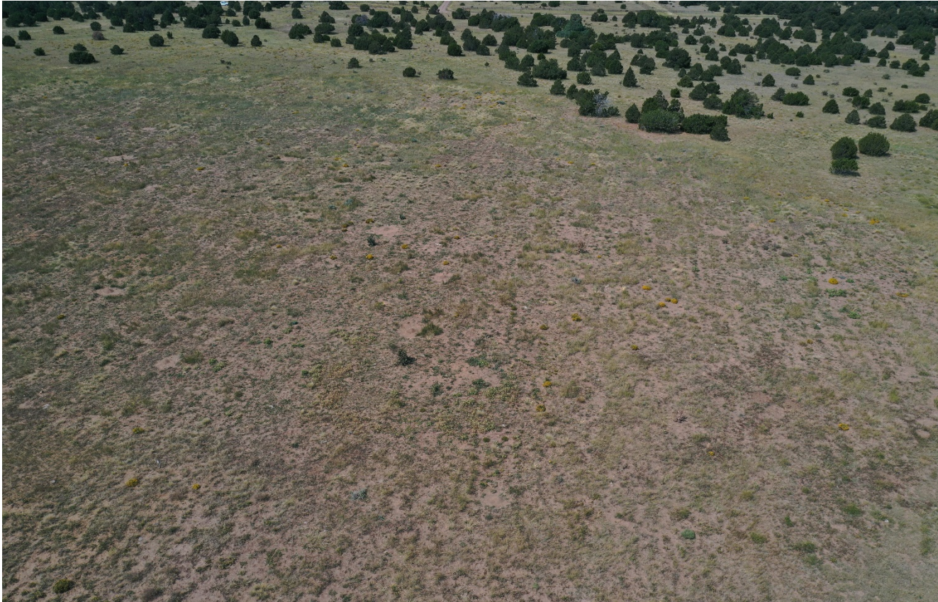
Photo 2. Drone aerial photo facing west toward the reclaimed LIVELY 35-09 BIG PIT.