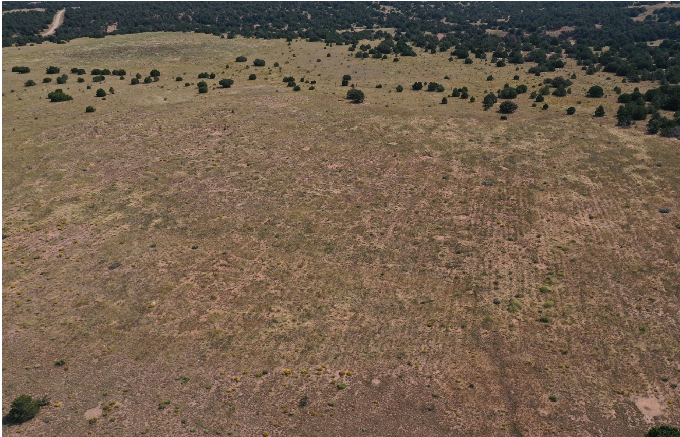
Photo 1. Drone aerial photo facing east toward the reclaimed LIVELY 35-09 BIG PIT.