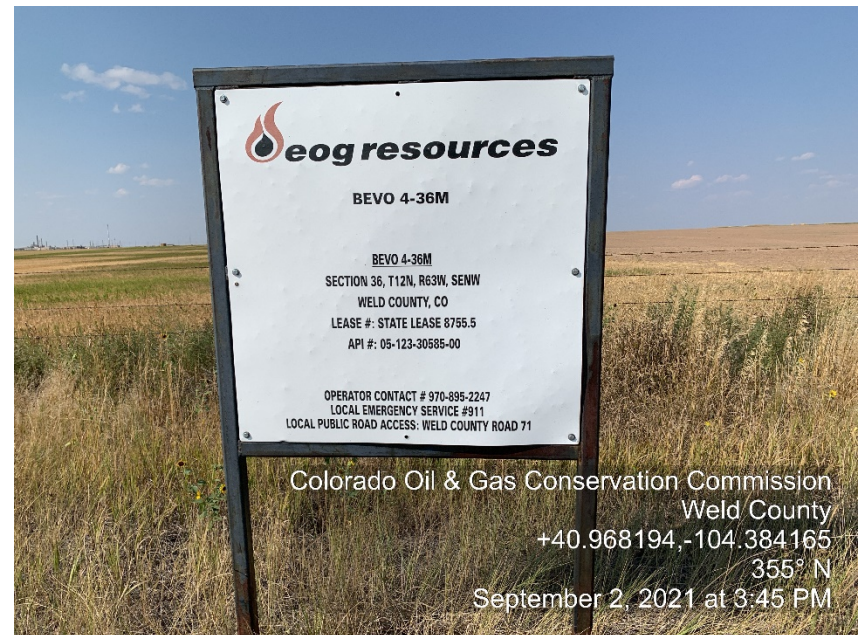
Colorado Oil & Gas Conservation Commission Weld County +40.968194, -104.384165 355° N September 2, 2021 at 3:45 PM