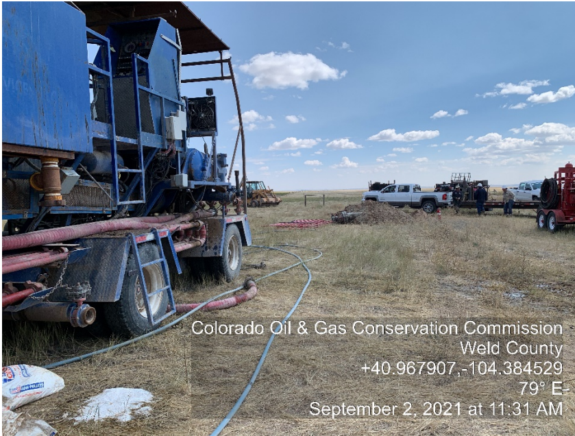
Colorado Oil & Gas Conservation Commission Weld County +40.967907, -104.384529 79° E September 2, 2021 at 11:31 AM