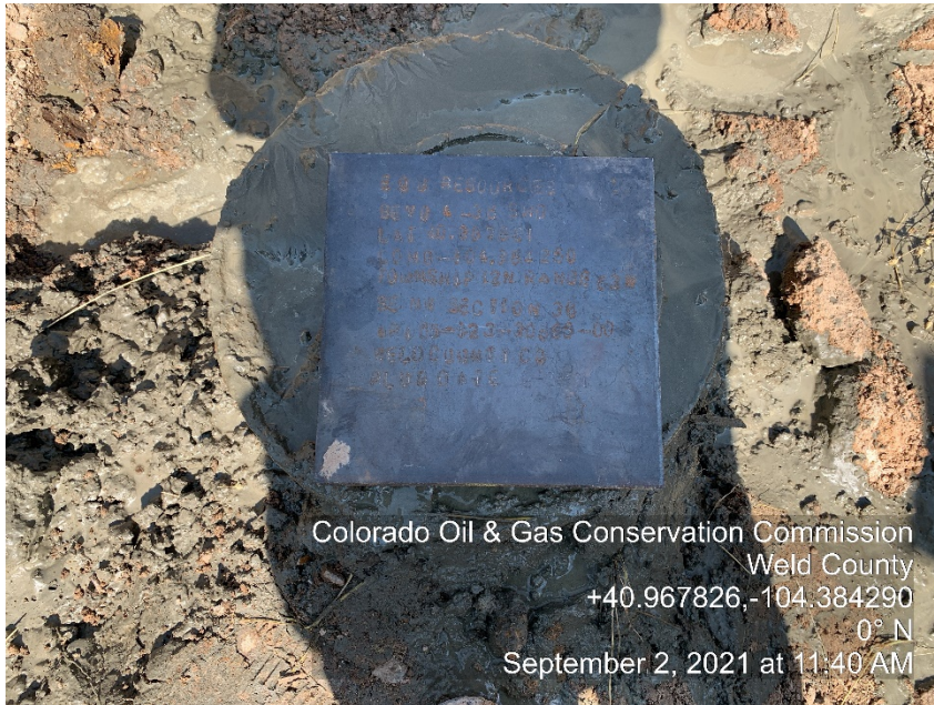
Colorado Oil & Gas Conservation Commission Weld County +40.967826, -104.384290 0° N September 2, 2021 at 11:40 AM