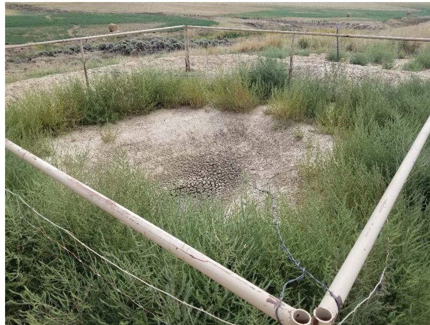
Photo 6. Pit.