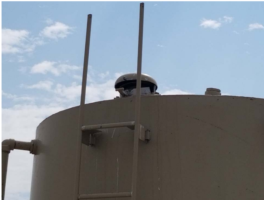
Photo 5. Gauge hatch open.