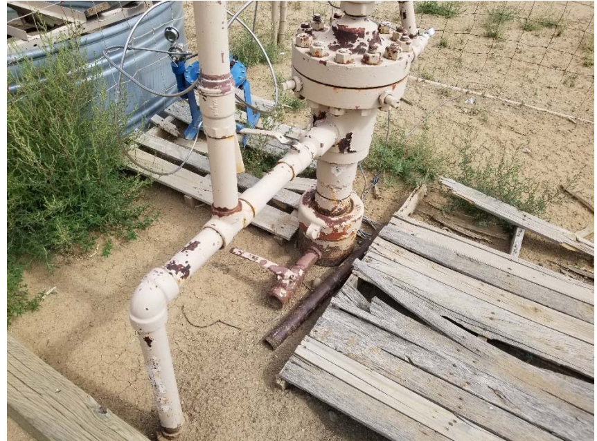
Photo 2. No bradenhead access apparent.