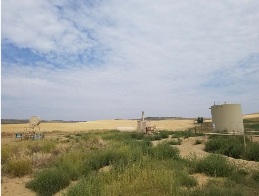
Photo 1. Overview of location taken facing north. Annual weeds on location.