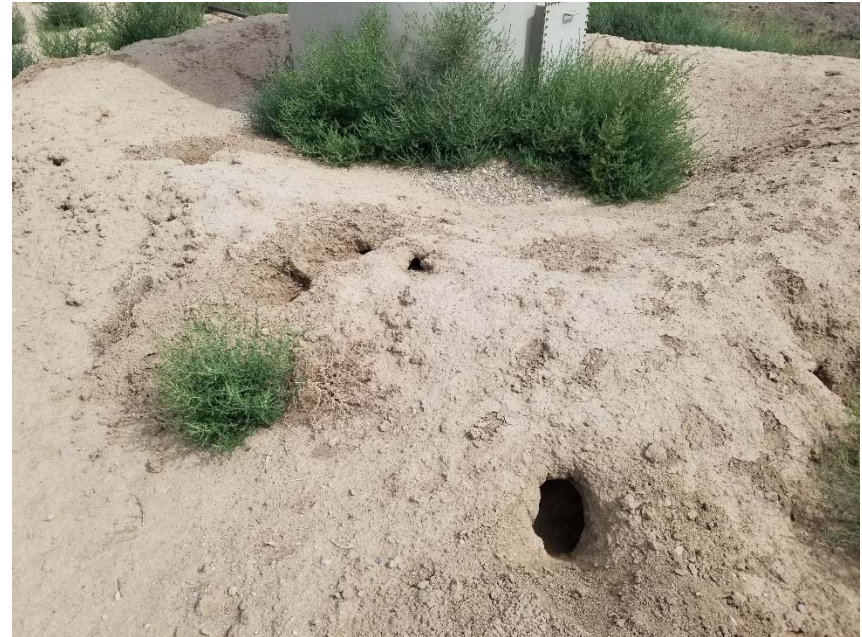
Photo 4. Animal burrows in berm. Annual weeds on location.