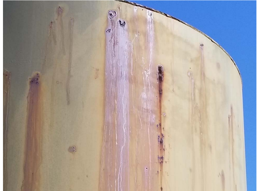
Photo 3. Holes in upper part of produced water tank.