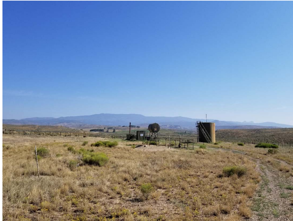
Photo 1. Overview of location taken facing north. Annual weeds on location.