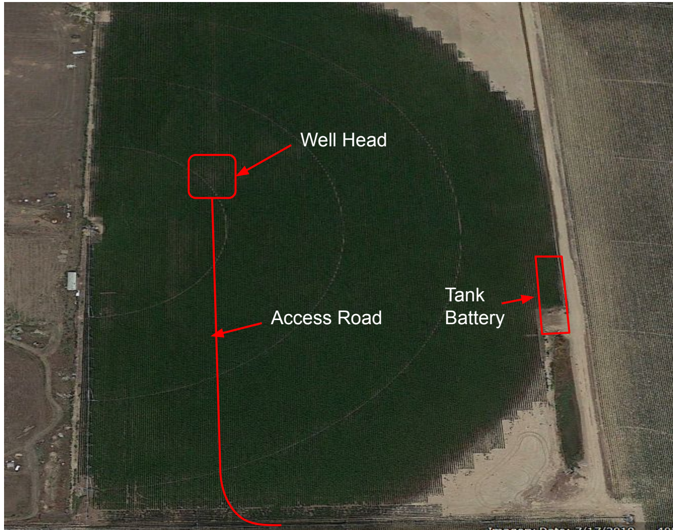
Photo 1. 2019 aerial imagery shows well head, access road and associated tank battery (north is up).