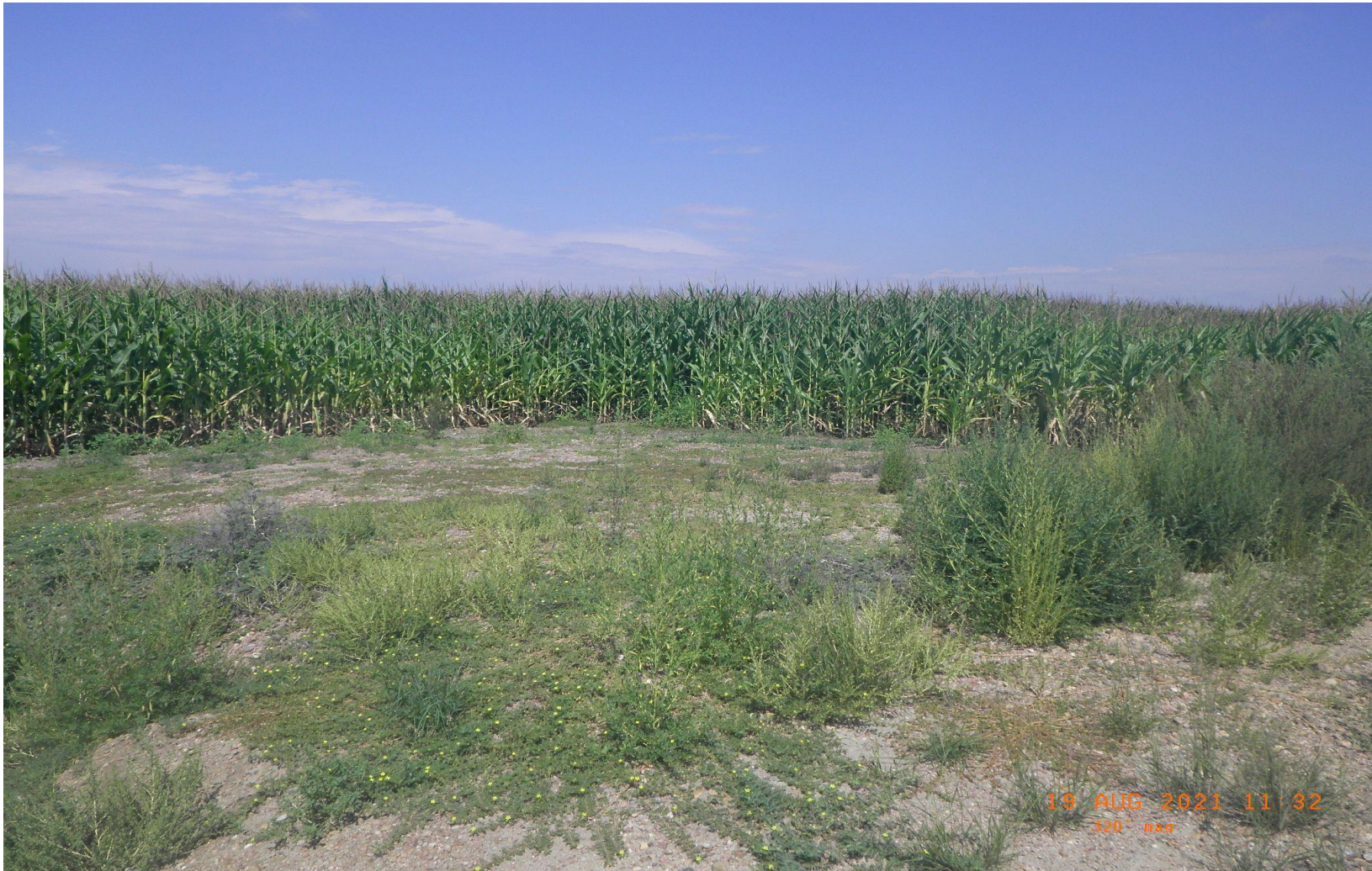
Photo 5. Ground photo taken from southeast corner of tank battery looking northwest. The ground is compacted and the vegetation resembles the reference areas nearby.