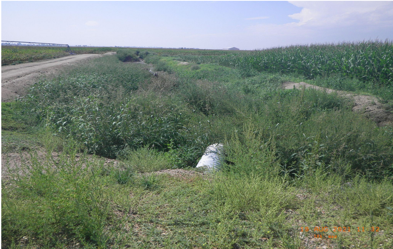
Photo 4. Ground photo of culvert taken from southern portion of tank battery. Photo shows north to south running culvert that feeds into holding pond just south of tank battery disturbance pad.