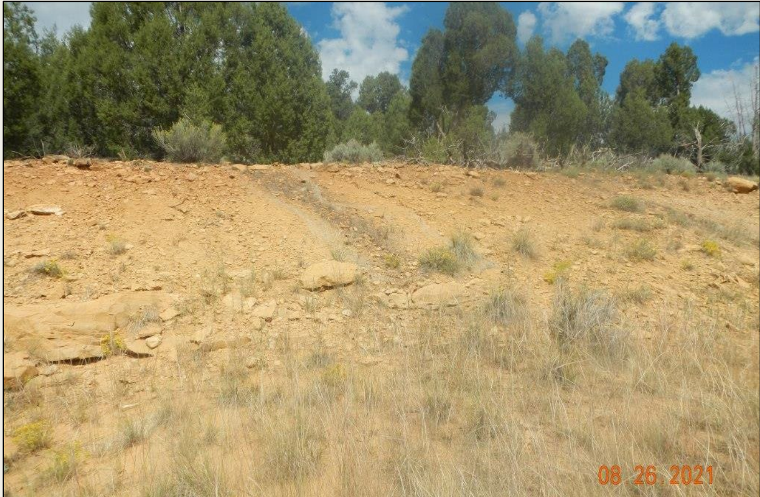
Photo 4. View of portion of the southwestern cut-slope that remains unstabilized and lacking revegetation.