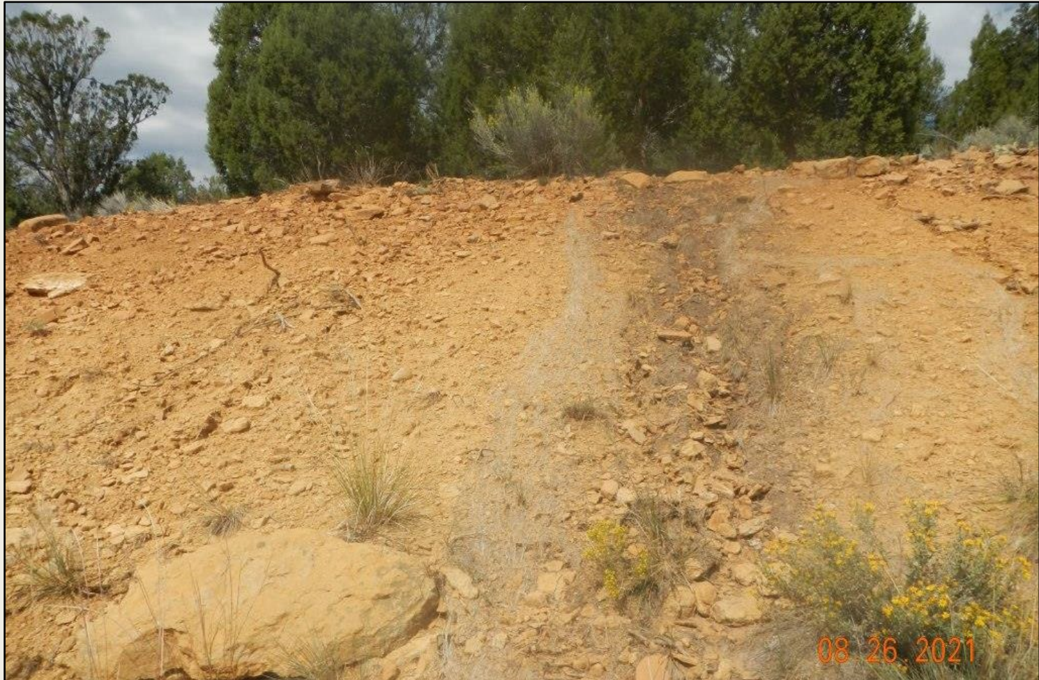
Photo 5. Closeup view of portion of cut-slope that remains unstabilized. BMP is degraded and rilling is occurring on the slope.