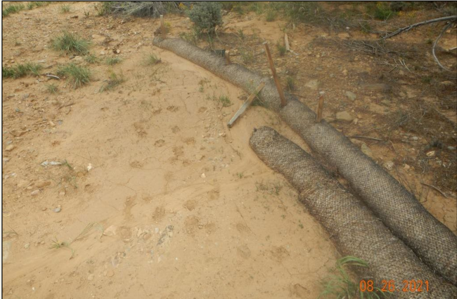
Photo 6. View of wattles in the southern project area, that are full of sediment and need stabilization. Additional seeding is needed here for long-term stabilization.