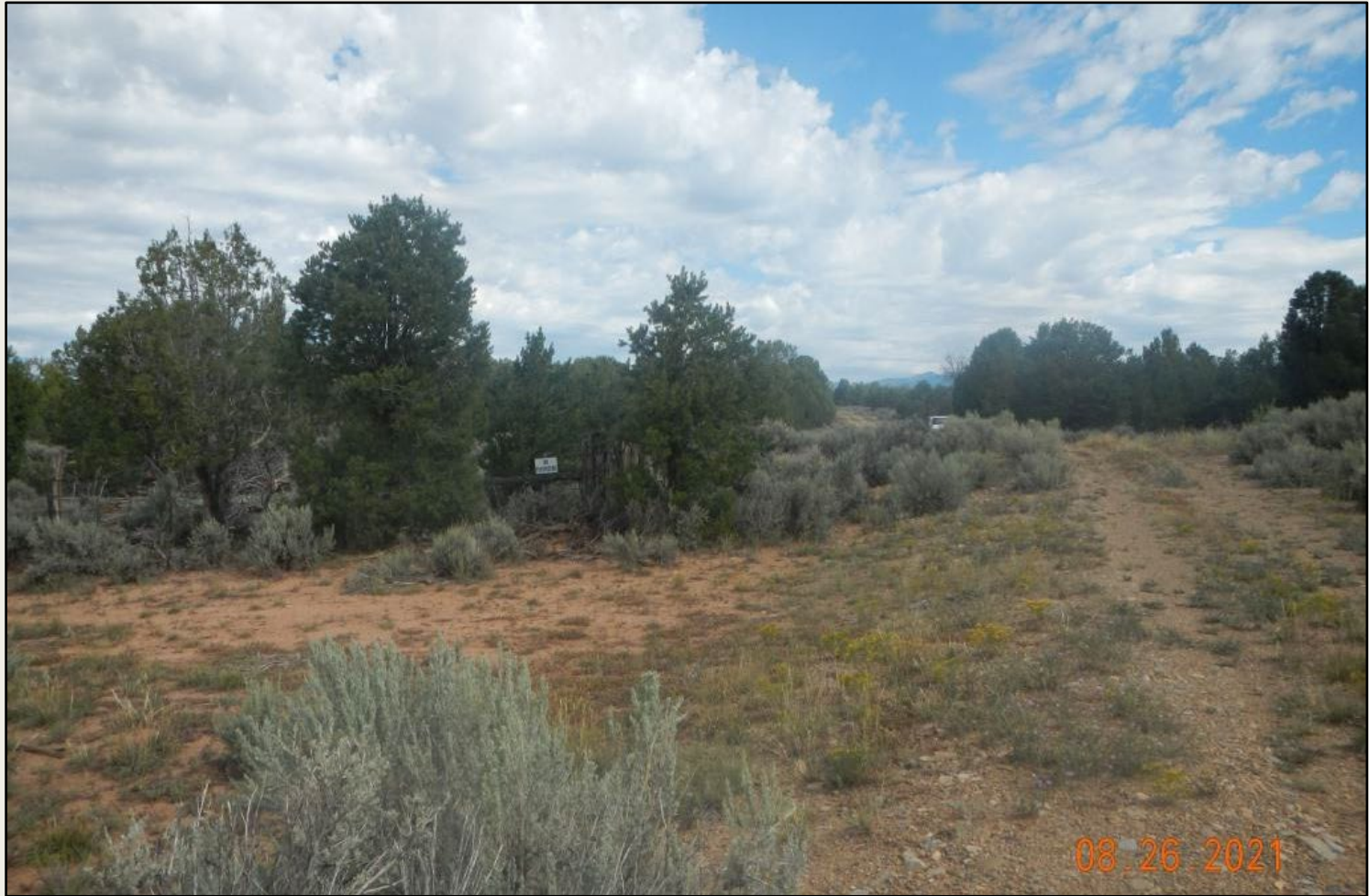
Photo 1. View of area where eastern riser (1 of 2 risers) was removed, southeast of well pad and access road, facing northward.