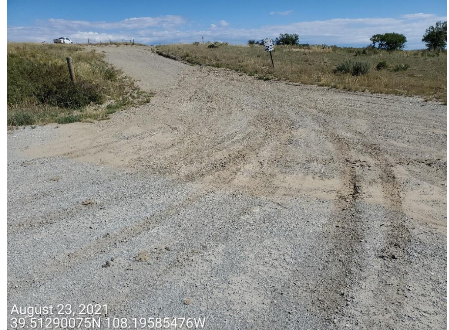
Photo 6: Photos taken from the access road, south of the Location. Photos show that BMPs to protect and stabilize unpaved areas of the Location and access road, and to allow for sediment laden-free stormwater discharge remain missing, or insufficient; stormwater runoff has resulted in erosion degradation and offsite sediment discharge at Location entrance and access road.. Photo on right also shows sediment deposition due to runoff from the Location.