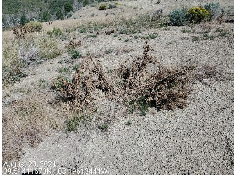
Photo 3: Photo shows example of noxious weeds on the Location that appear to have been sprayed; additional weed management appears to have been conducted; however a File Inspection Report Resolution form was not submitted by the Operator upon completion of the corrective action in accordance with Rule 210.b.