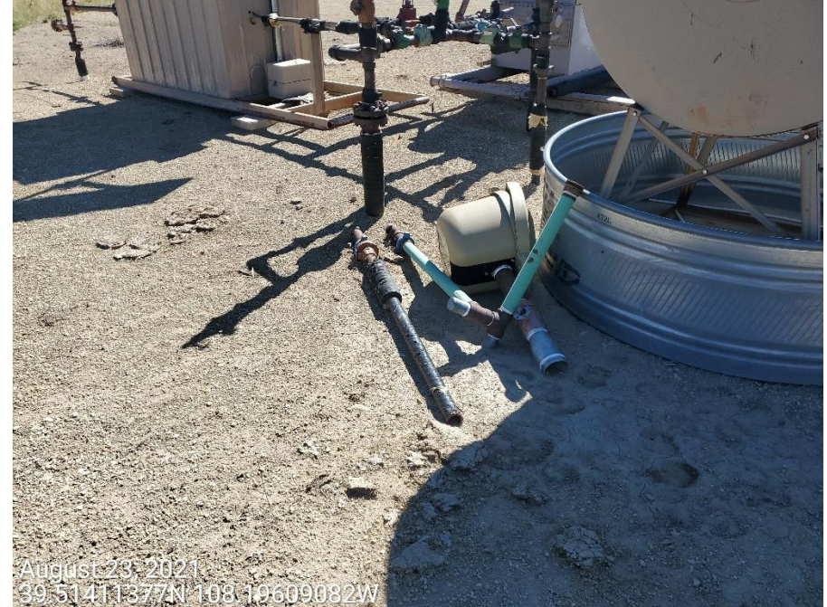
Photo 1: Photo shows unused equipment, and/or equipment not necessary for production on the Location. Previous inspections required Operator to submit a Form 4 with records identifying equipment's (Methanol tank, separator, meter shed) current statuses and use for production on the Location by 10/2/2020; Operator failed to submit Form 4 with records; Inspection #696202916 required Operator to comply with Rule 606.a and remove equipment not necessary for use on the Location. To date, records identifying equipment's use and need has not been submitted, and equipment has not been removed.