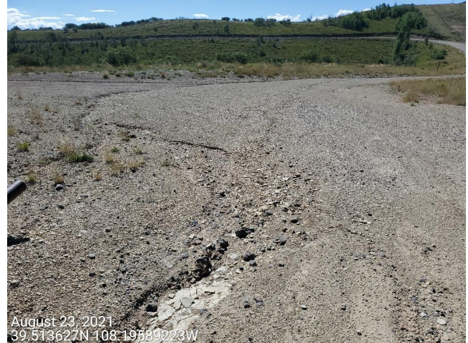
Photo 4: Photos taken from the south end of the Location. Photos show that BMPs to protect and stabilize unpaved areas of the Location and access road, and to allow for sediment laden-free stormwater discharge remain missing, or insufficient; stormwater runoff has resulted in erosion degradation and offsite sediment discharge at Location entrance and access road.