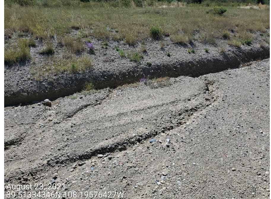
Photo 5: Photos taken from the access road, south of the Location. Photos show that BMPs to protect and stabilize unpaved areas of the Location and access road, and to allow for sediment laden-free stormwater discharge remain missing, or insufficient; stormwater runoff has resulted in erosion degradation and offsite sediment discharge at Location entrance and access road.