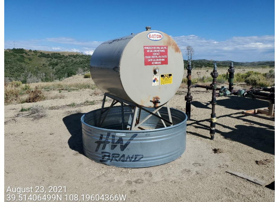
Photo 2: Previous inspection observed that protection equipment to prevent wildlife access to the secondary containment BMP at the 500 gallon methanol tank, and the separator was missing or insufficient. Photos show wildlife protection equipment remains missing or insufficient.