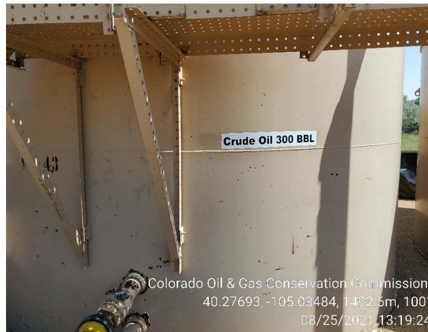
Placard on 8/25/2021