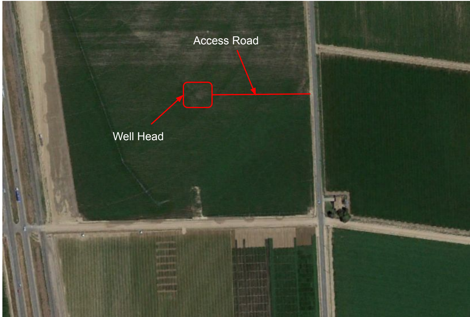
Photo 1. 2019 aerial imagery shows the well head and associated access road (north is up). Note: the tank battery is reclaimed and will be associated with location ID 330731.