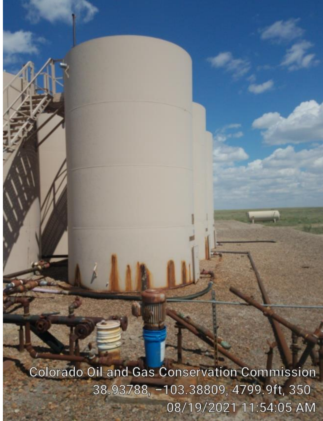
Colorado Oil and Gas Conservation Commission 38.93788, -103.38809, 4799.9ft, 350° 08/19/2021 11:54:05 AM