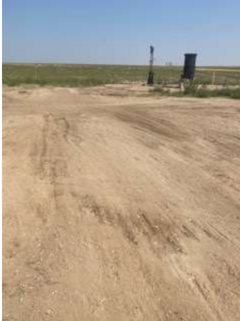
Concrete vault removed