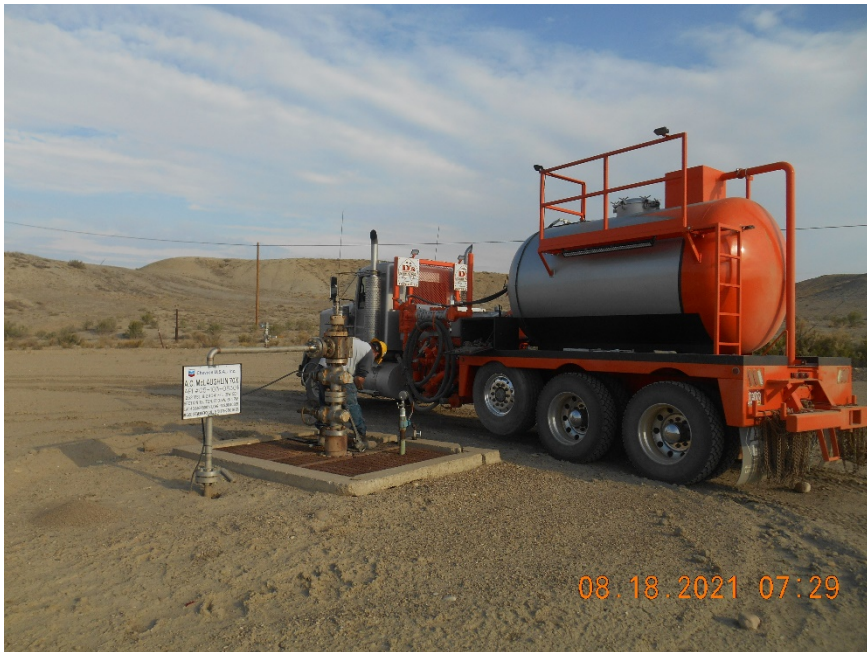
Injection wellhead during MIT