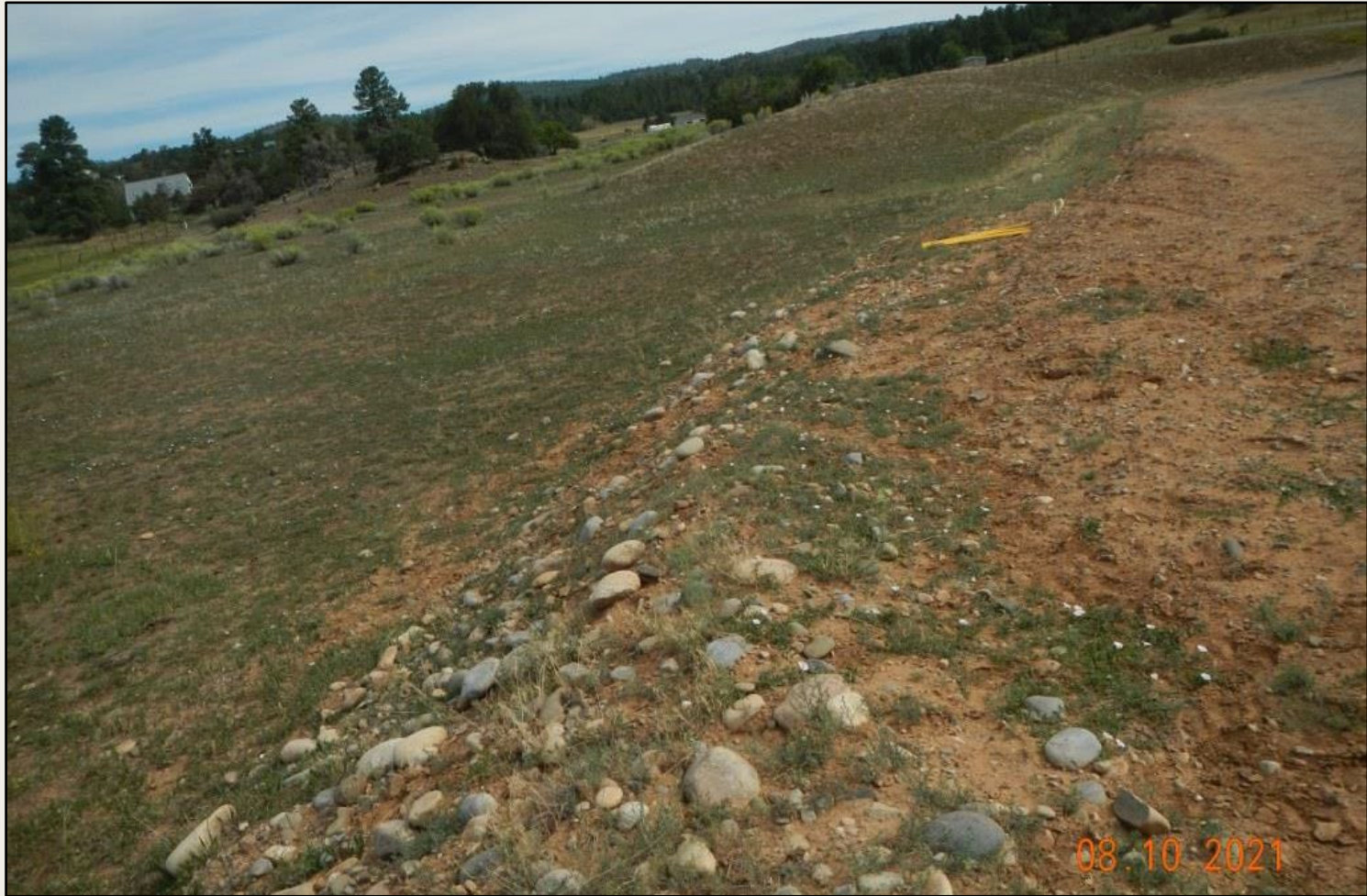
Photo 4. View of the western project area from the southwestern corner facing northward.