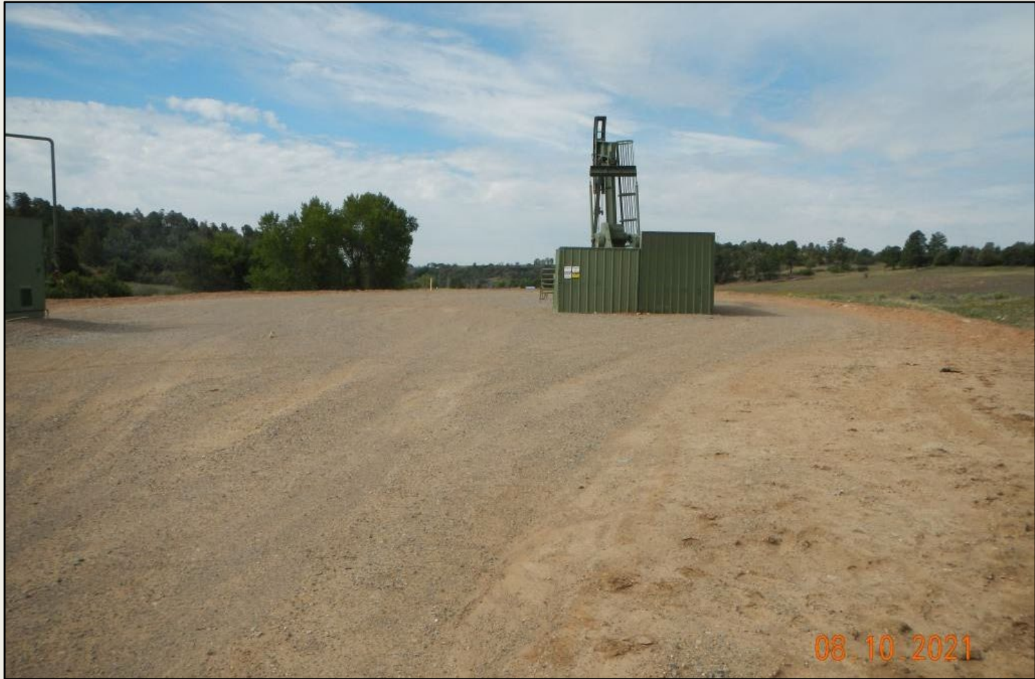
Photo 1. View of the project area from the well pad entrance facing center.