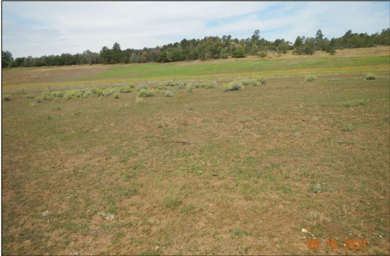
Photo 5. View of the reference area comprised of open grass field with smooth brome, western wheatgrass, and rubber rabbitbrush.