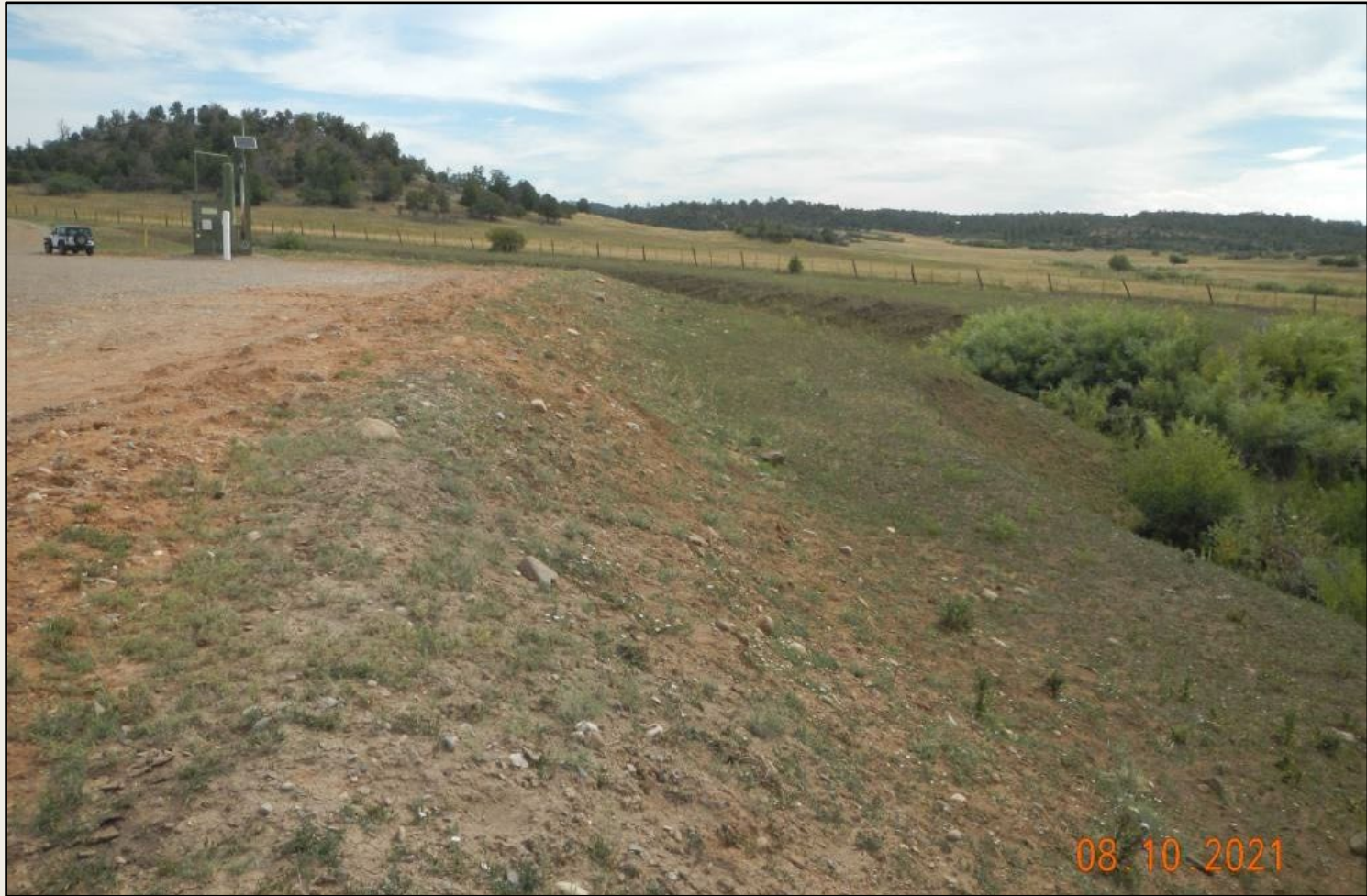
Photo 2. View of the eastern cut-slope from the southeastern corner facing northward. Revegetation is progressing similar to the reference area with smooth brome and western wheatgrass, as well as perennial weeds such as bindweed, largely in a grazed condition.