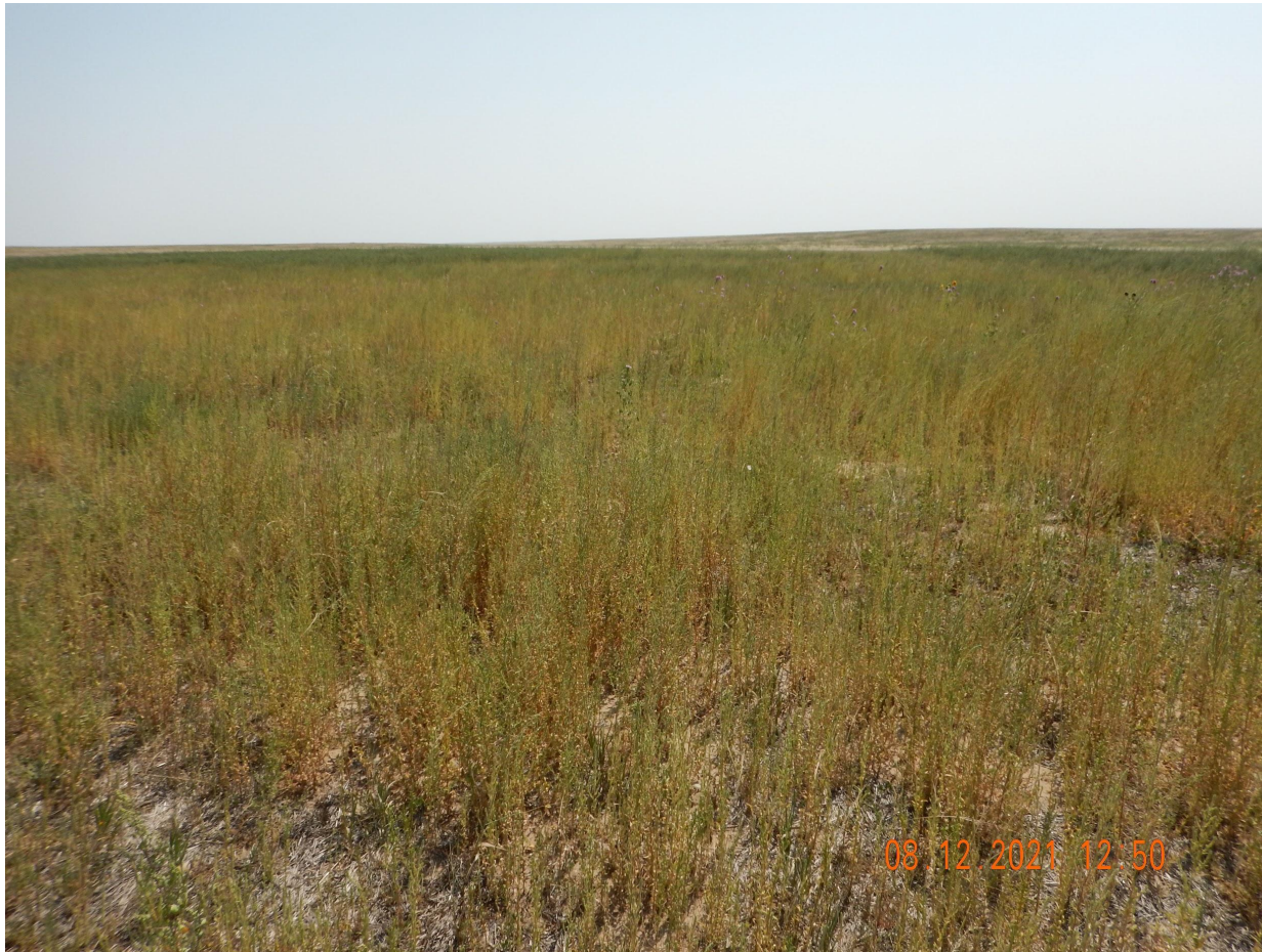
Photo 3. Photo taken from the northwestern location, facing South. See comments under Photo 1.