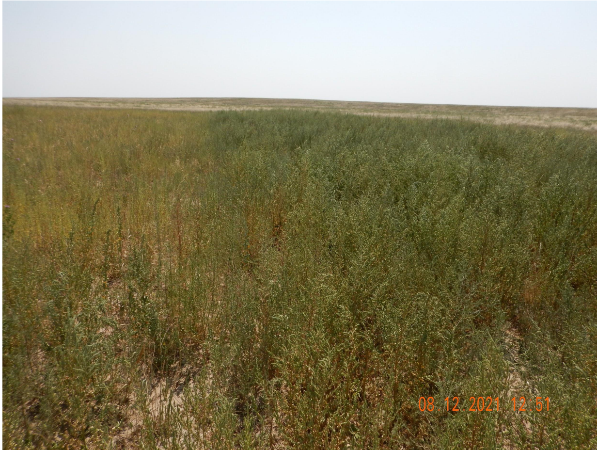
Photo 5. Photo taken from the western location, facing South. See comments under Photo 1.