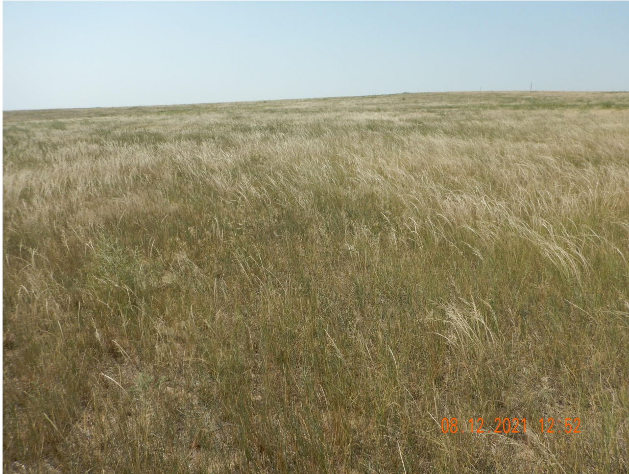
Photo 6. Reference photo taken west of location, facing West.