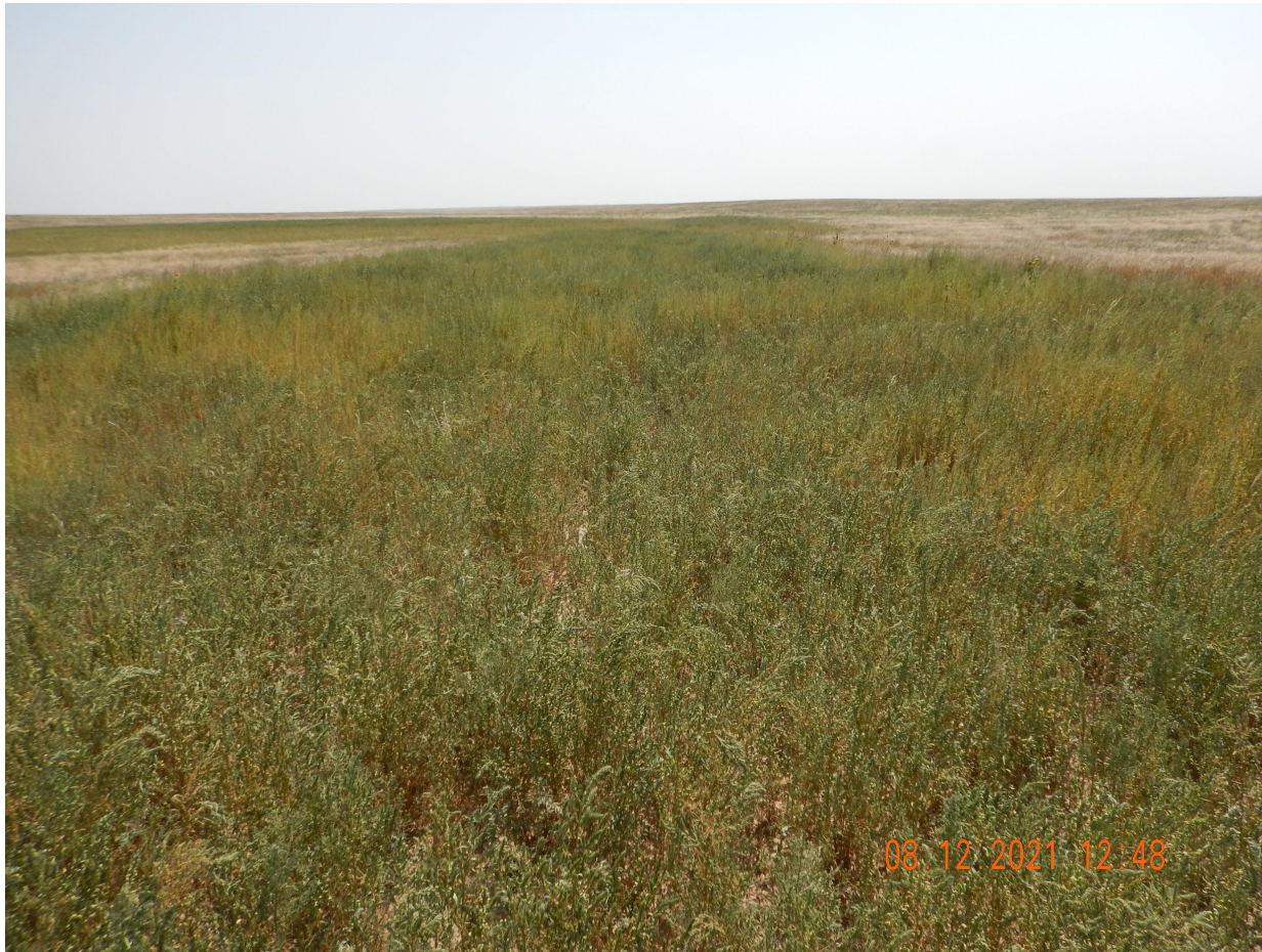
Photo 1. Photo taken from the entrance of location, facing South. Photo illustrates unmanaged weeds throughout the entire location.