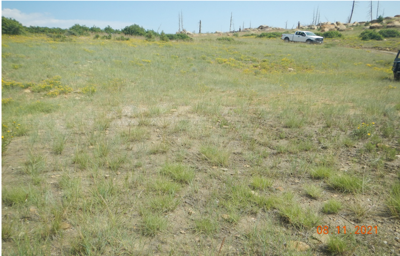
Photo 4. Facing northeast toward the location. The location is stabilized with native perennial vegetation cover.