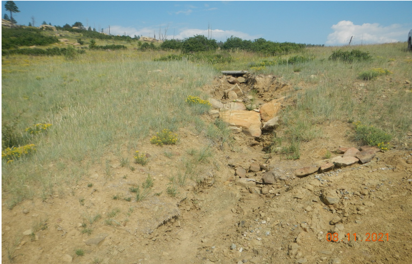
Photo 3. Facing northwest at the area shown in previous photo. There is an erosion channel which is caused by stormwater from the pre-existing access road shown in photo 1. This area will need to be repaired and stabilized.