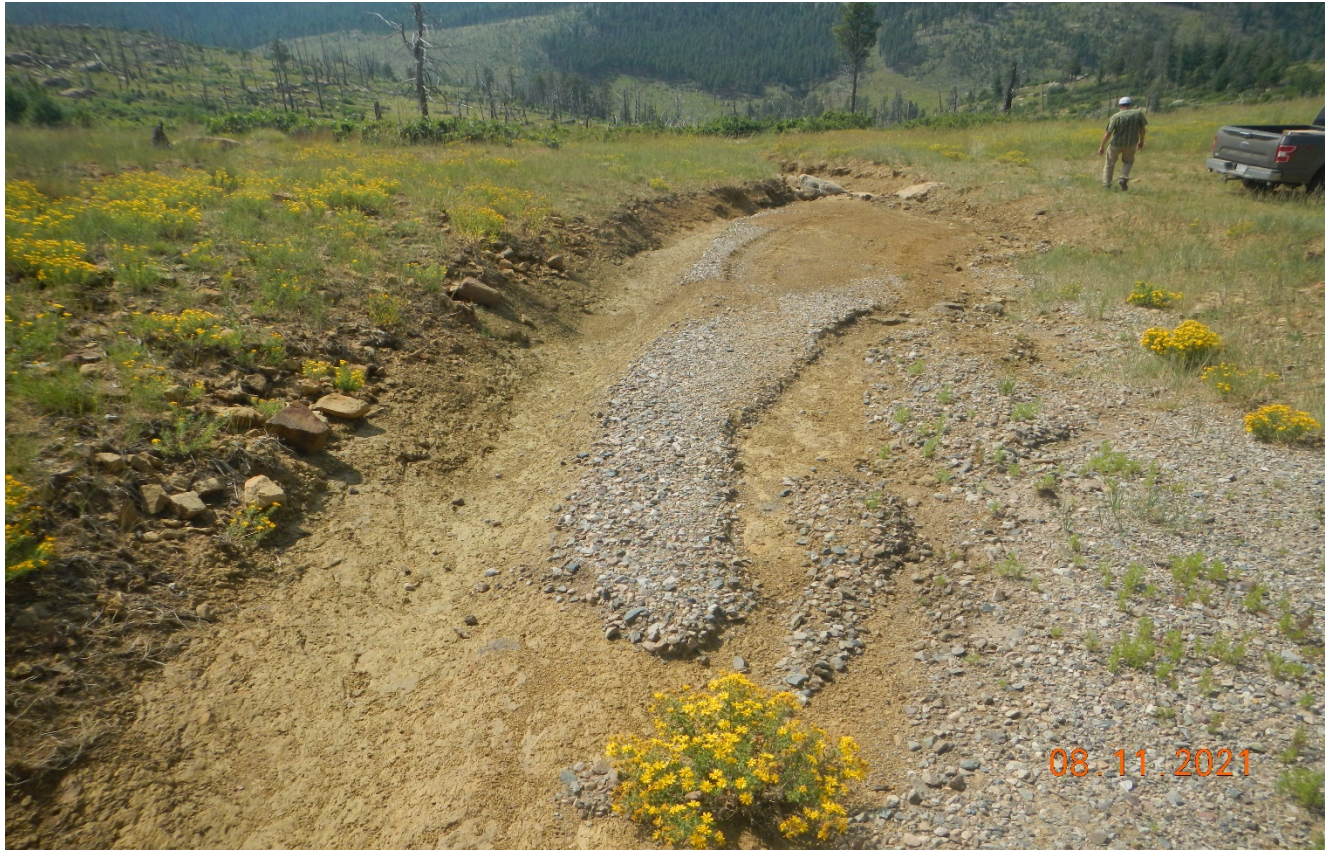
Photo 2. Facing south toward the access road at the location. The concentrated stormwater flow from previous photo has caused erosion of the access road. This area needs to be repaired and stabilized or reclaimed.