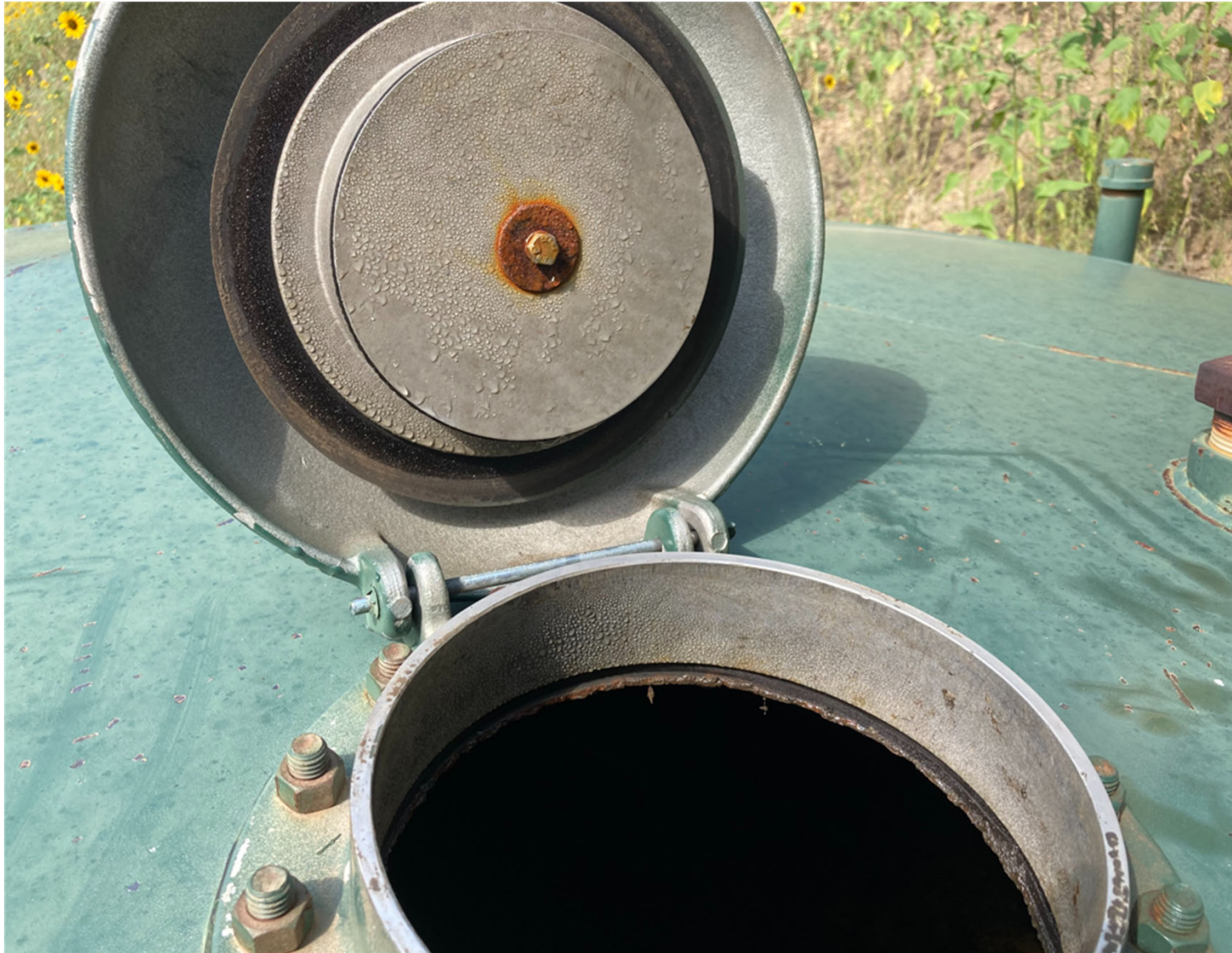
PHOTO 4: THE SCRUBBER LIQUID WAS REMOVED FROM THE PRODUCED WATER TANK AND DISPOSED OF PER OGRIS'S WASTE MANAGEMENT PLAN AND THE COGCC RULES AND REGULATIONS.

NEW ELK 25-10-2 API# 05-071-09604 – OGRIS OPERATING OGCC OPERATOR NUMBER 10758 - DATE: FEBURARY 25, 2021 CORRECTIVE ACTIONS COMPLETED REGARDING COGCC FIR DOCUMENT # 695103275