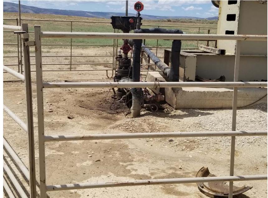
Photo 2. Stained soil at wellhead.