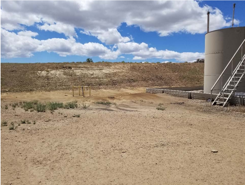
Photo 3. Sediment migration onto location.