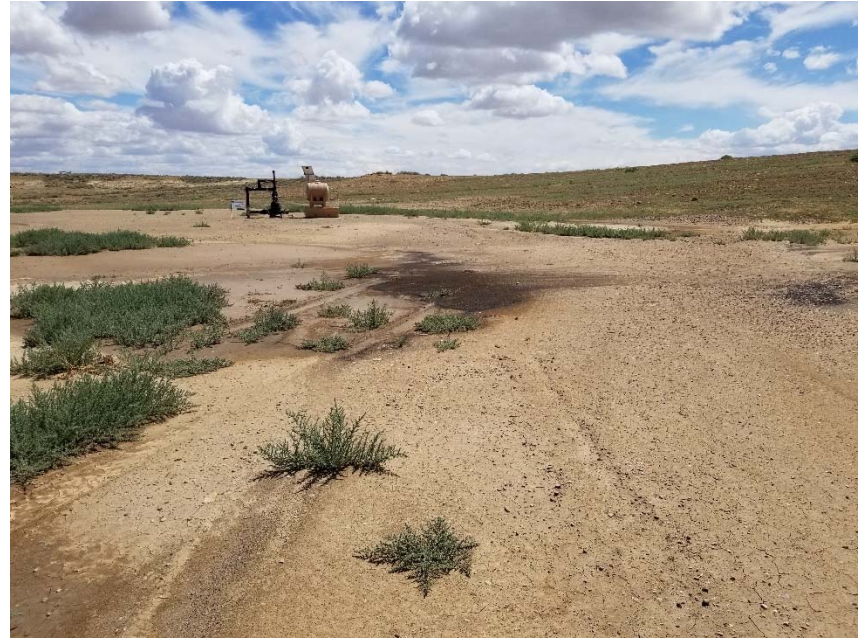
Photo 2. Annual weeds and sediment migration onto location.