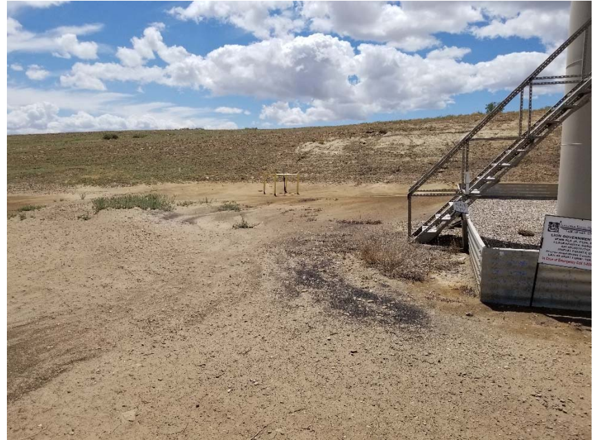
Photo 4. Sediment migration onto location.