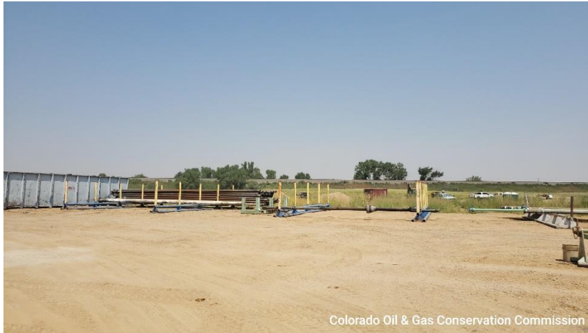
Photo 9 Misc. pipe