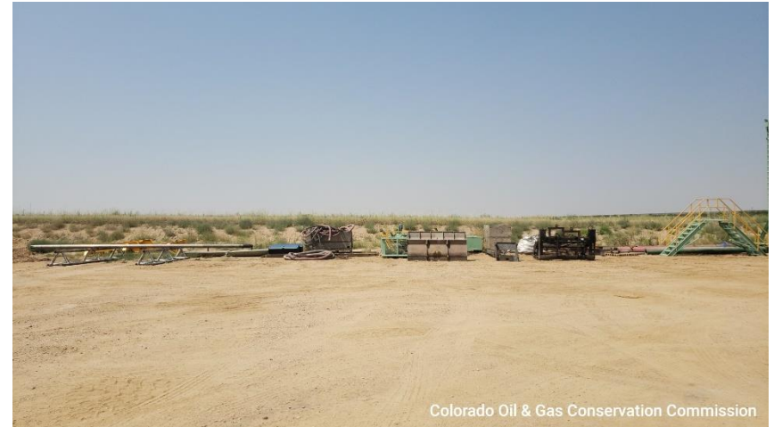
Photo 4 Misc. pipe racks