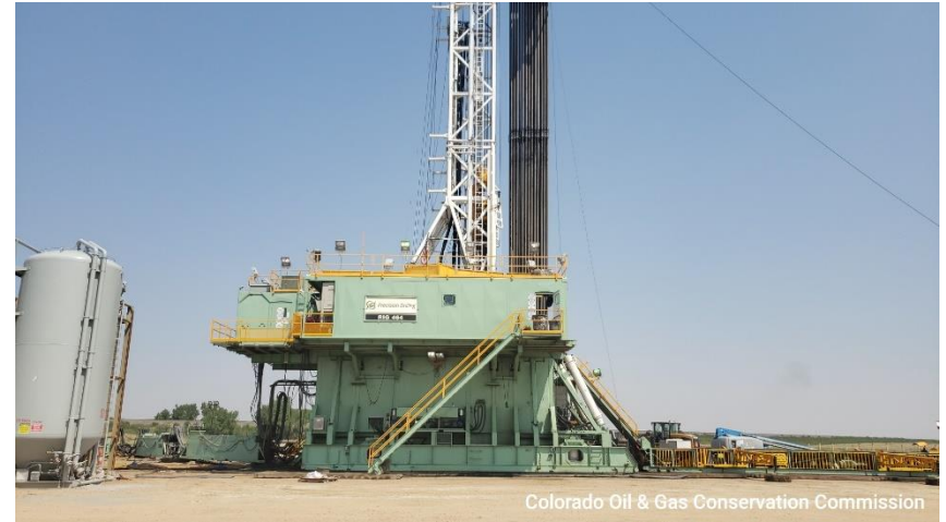
Photo 12 Rig Doghouse