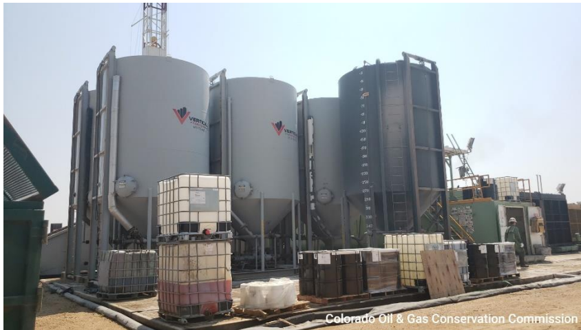
Photo 5 Misc. Equipment and Drilling fluids