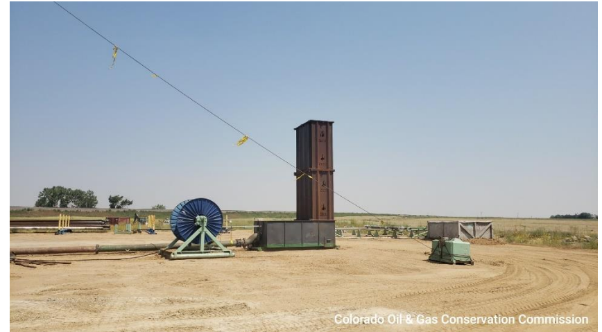
Photo 10 Combustion device