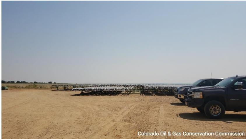
Photo 11 5 ½' casing racked