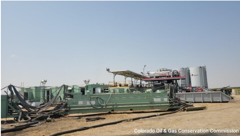
Photo 7 Misc. Equipment