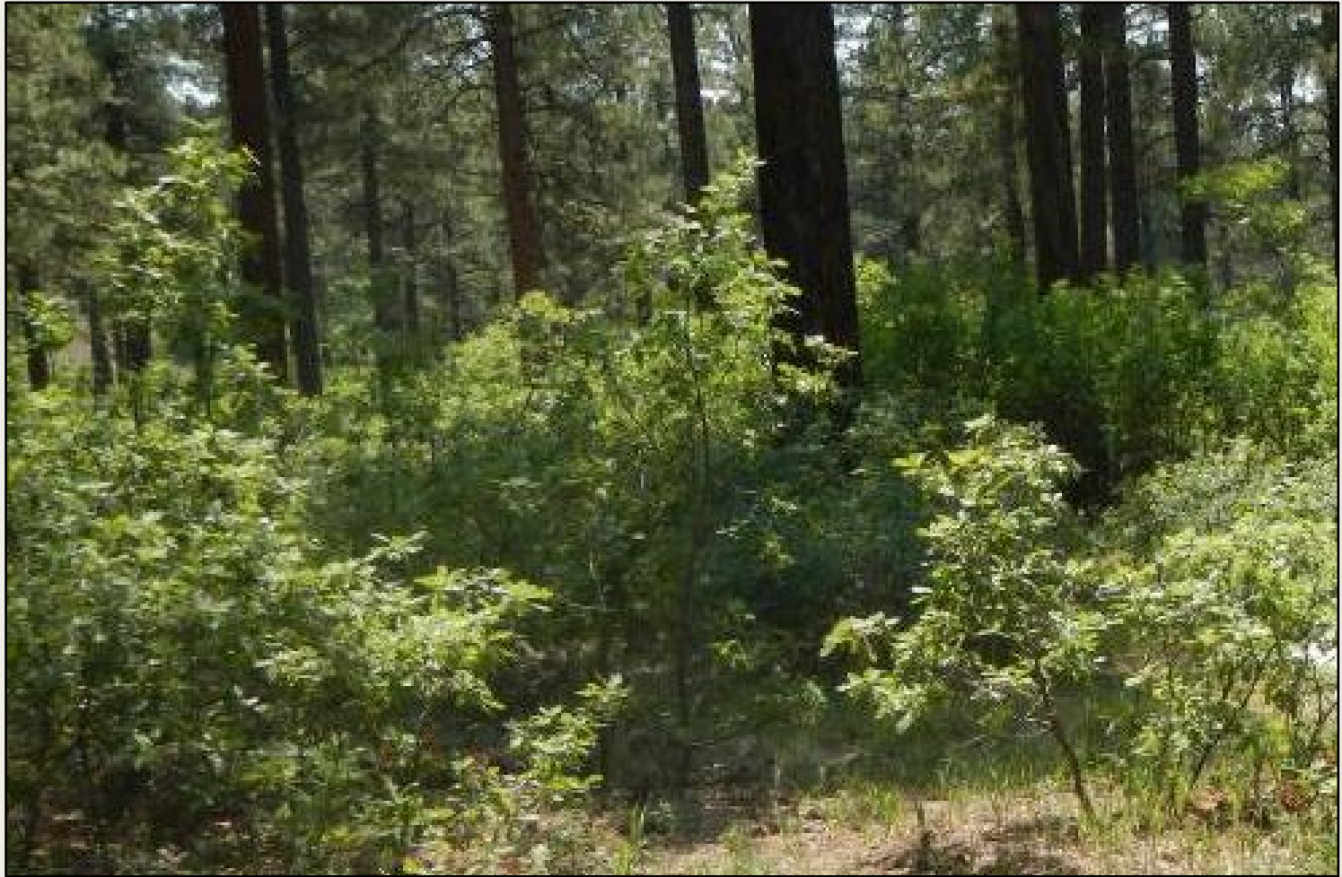
Photo 9. View of the reference area comprised of ponderosa pine and gambel oak woodland with understory of sandberg bluegrass, junegrass, yarrow, Oregon grape, and sugarbowl clematis.