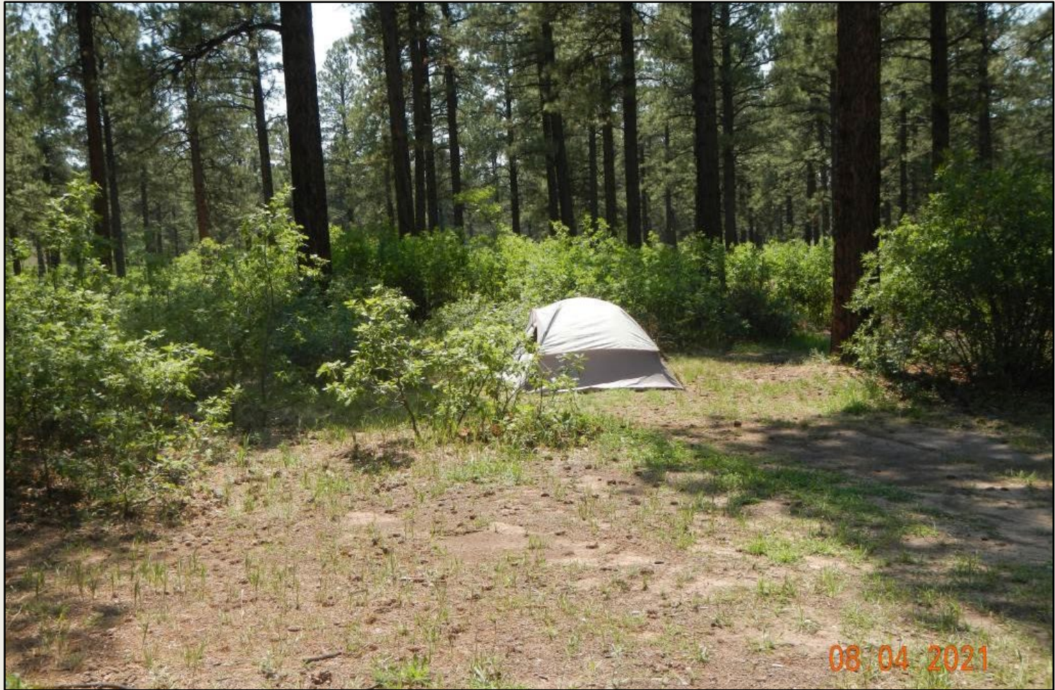
Photo 7. View of tent at gated access to location.