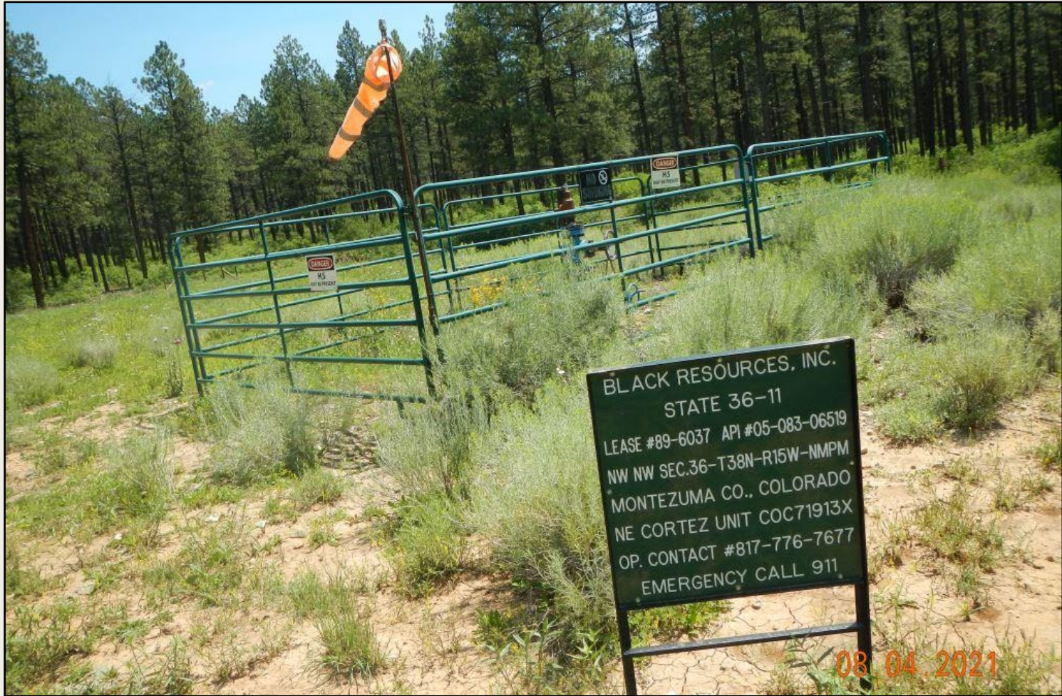
Photo 5. View of well sign, fencing, and well sock at the wellhead.