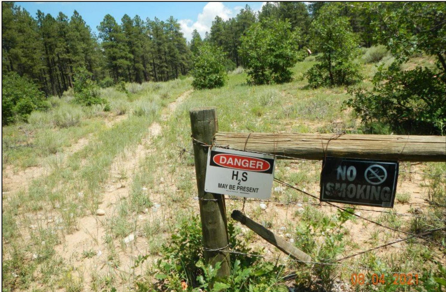
Photo 6. View of signage on the access road near the well pad entrance.