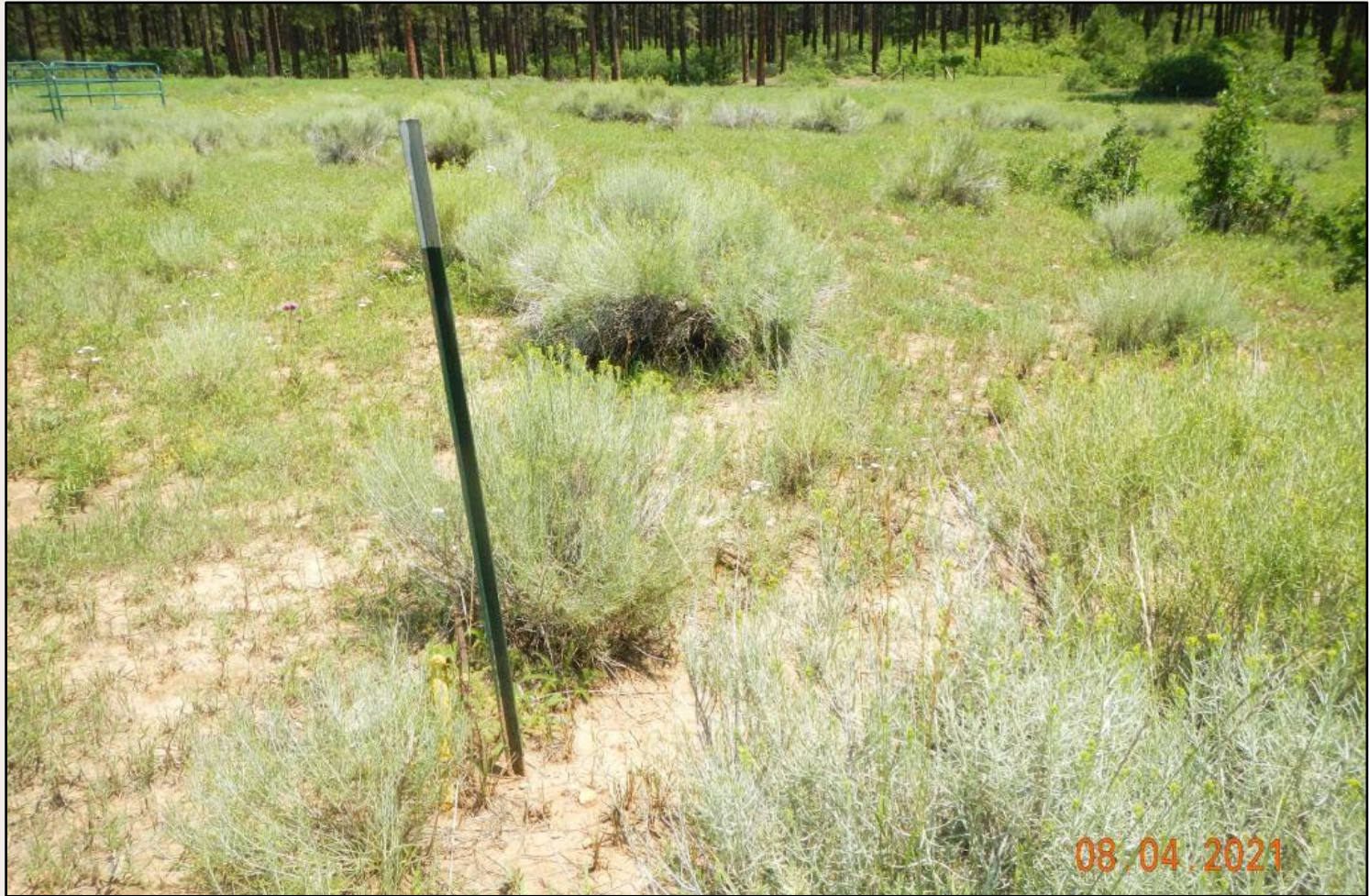
Photo 2. View of the southern project area from the southwestern corner facing eastward. Revegetation is progressing here with western wheatgrass, smooth brome, rubber rabbitbrush, and yarrow.