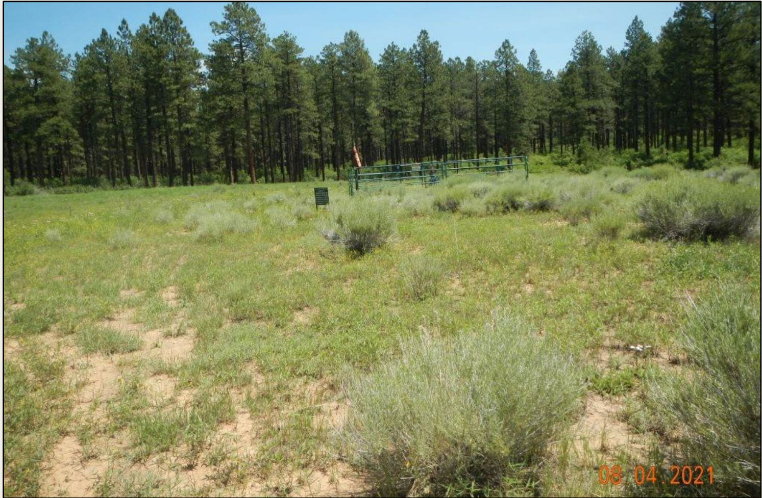
Photo 1. View of the project area from the well pad entrance facing center.