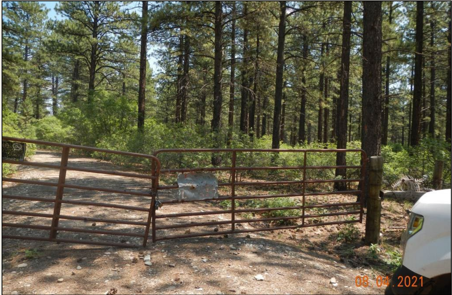
Photo 8. View of locked gate and entrance to access road.