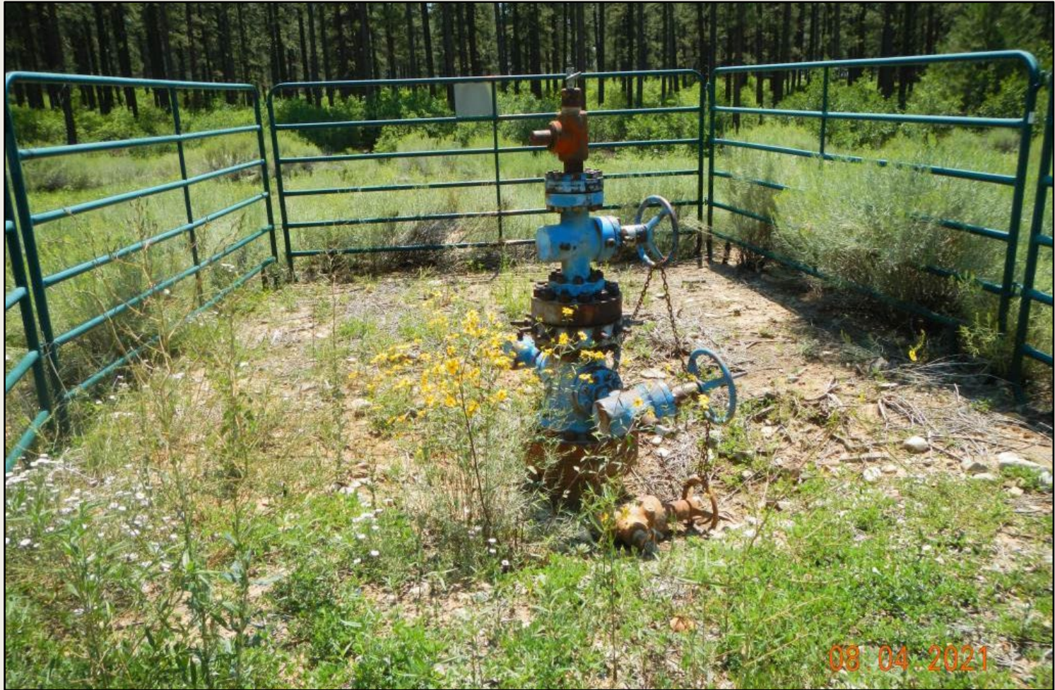
Photo 4. View of the well head facing southward.