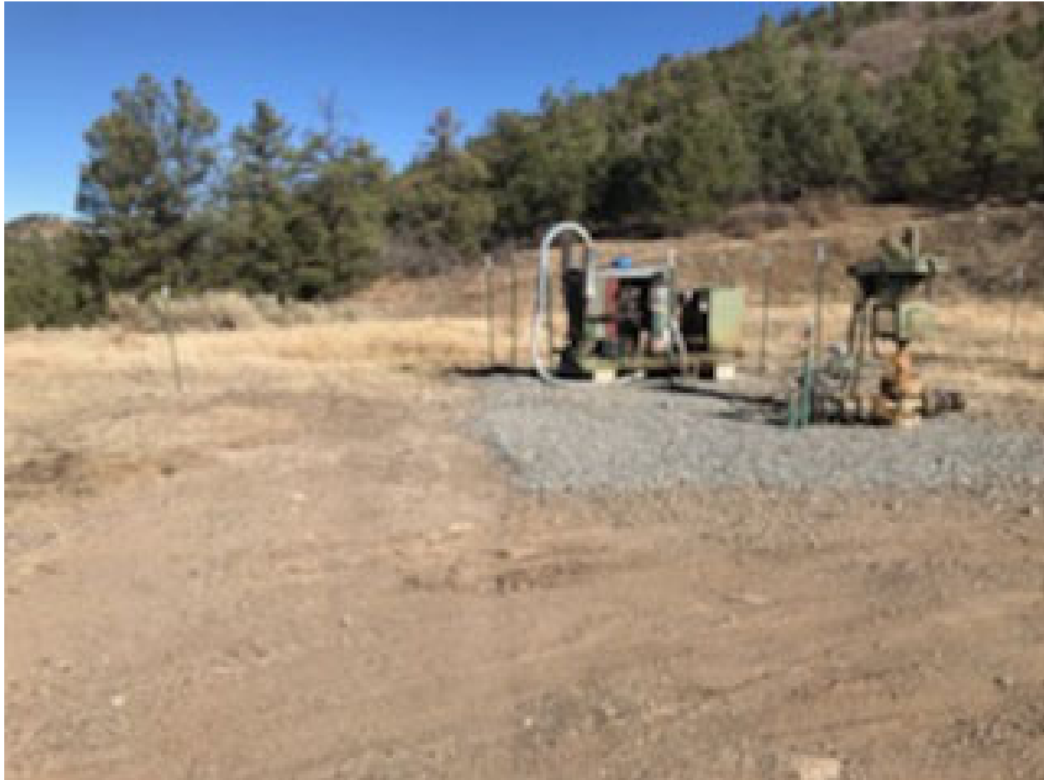
PHOTO 3: THE HARDPAN STAINS ON THE GROUND NEAR THE WELL HEAD WAS REMOVED FROM THE LOCATION.

APACHE CANYON 04-13 API# 05-071-09582 – TIMBER CREEK OPERATING OGCC OPERATOR NUMBER 10672 - DATE: OCTOBER 10, 2020 CORRECTIVE ACTIONS COMPLETED REGARDING COGCC FIR DOCUMENT # 698701915