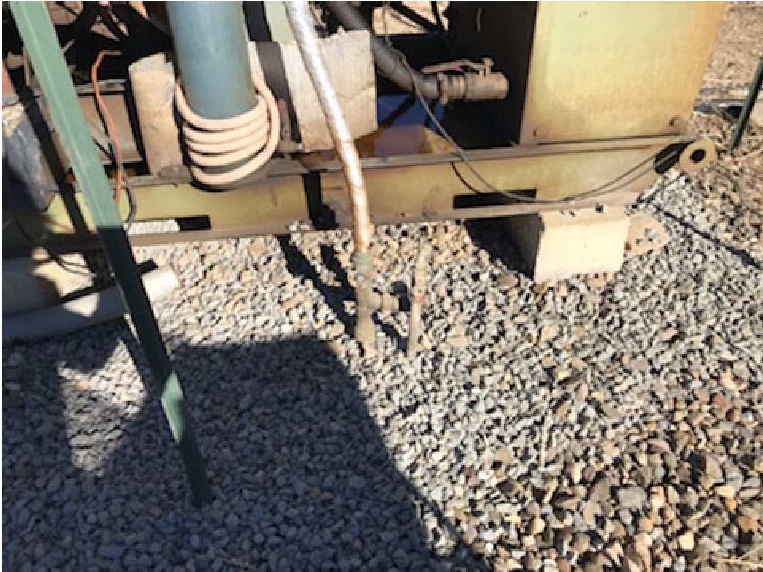
PHOTO 4: THE IMPACTED SOIL NEAR THE ENGINE SKID WAS REMOVED AND PROPERLY DISPOSED IN ACCORDANCE WITH THE OGRIS OPERATING WASTE MANAGEMENT PLAN.

APACHE CANYON 04-13 API# 05-071-09582 – TIMBER CREEK OPERATING OGCC OPERATOR NUMBER 10672 - DATE: OCTOBER 10, 2020 CORRECTIVE ACTIONS COMPLETED REGARDING COGCC FIR DOCUMENT # 698701915