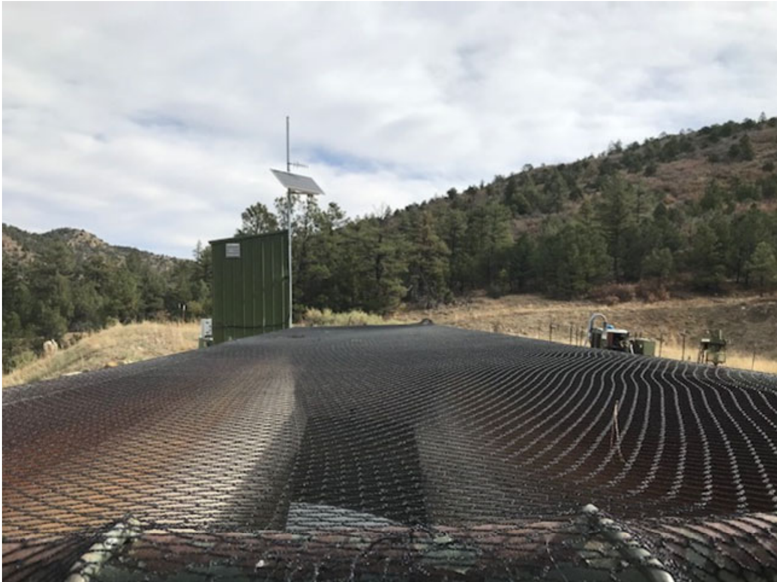
PHOTO 2: BIRD NETTING WAS INSTALLED ACROSS THE TOP OF THE OPEN TOP WATER TANK.

APACHE CANYON 04-13 API# 05-071-09582 – TIMBER CREEK OPERATING OGCC OPERATOR NUMBER 10672 - DATE: OCTOBER 10, 2020 CORRECTIVE ACTIONS COMPLETED REGARDING COGCC FIR DOCUMENT # 698701915