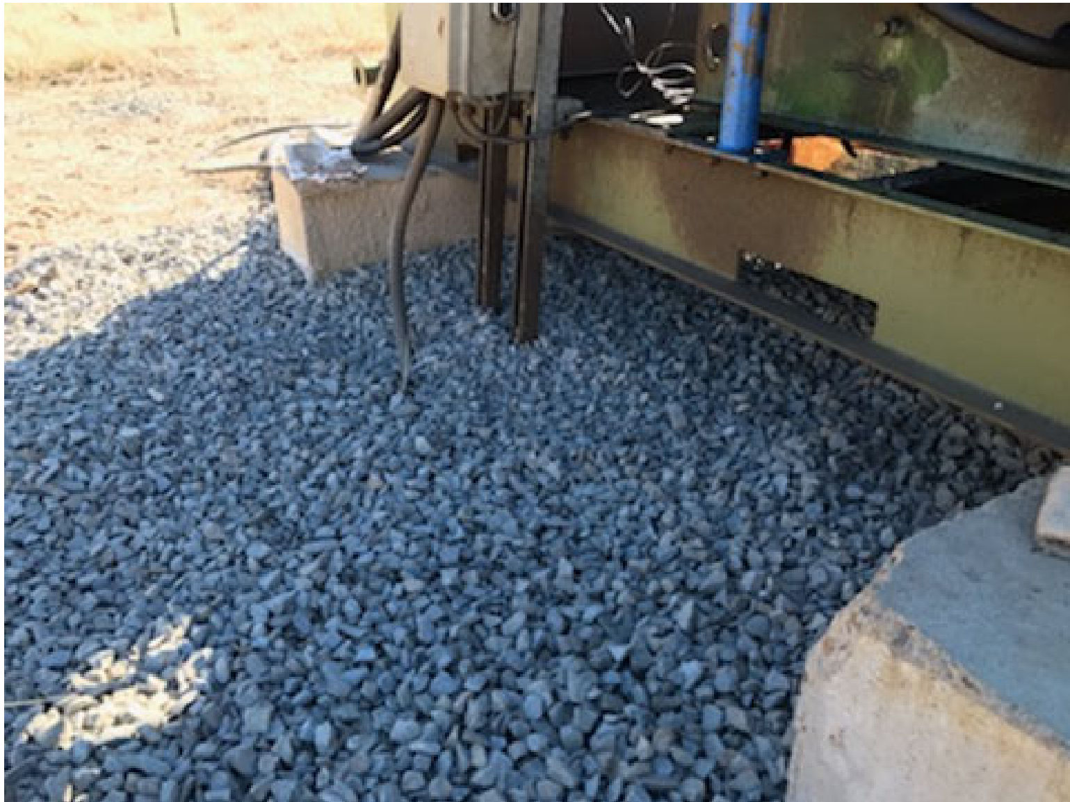
PHOTO 5: THE IMPACTED SOIL NEAR THE ENGINE SKID WAS REMOVED AND PROPERLY DISPOSED IN ACCORDANCE WITH THE OGRIS OPERATING WASTE MANAGEMENT PLAN.

APACHE CANYON 04-13 API# 05-071-09582 – TIMBER CREEK OPERATING OGCC OPERATOR NUMBER 10672 - DATE: OCTOBER 10, 2020 CORRECTIVE ACTIONS COMPLETED REGARDING COGCC FIR DOCUMENT # 698701915