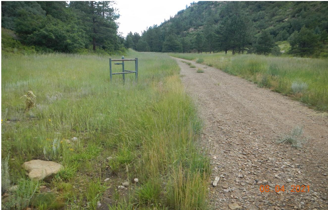
Photo 2. There is a second pipe riser that remains further along the road.