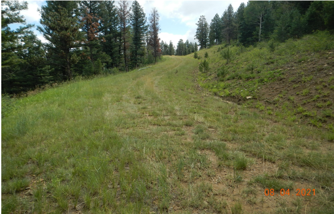
Photo 6. Facing south along the preexisting road traveling to the location. The road is stabilized with vegetation along with other BMP's.