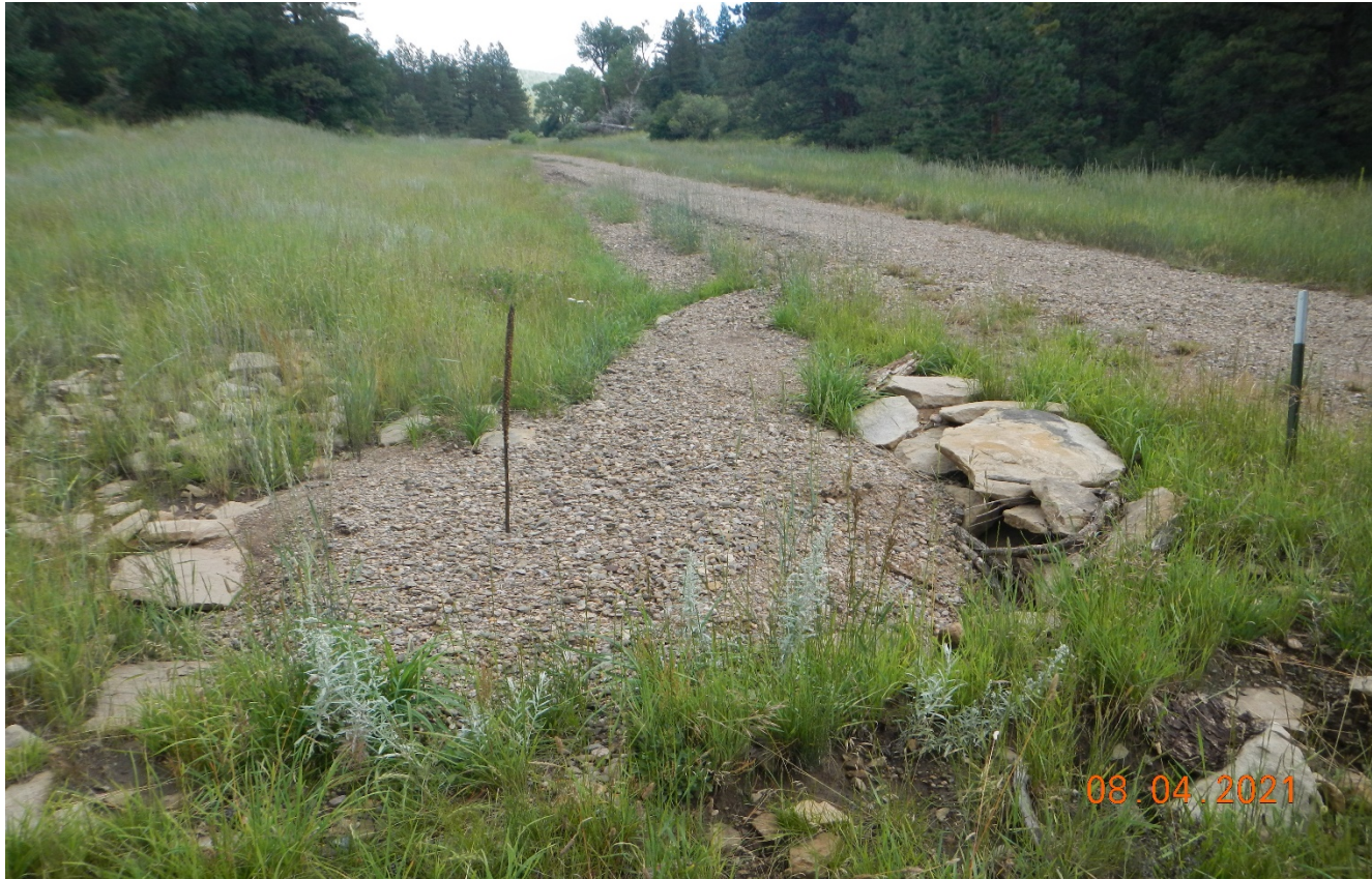
Photo 3. There is a culvert along the main road that has filled in with gravel and sediment which needs to be cleaned out.