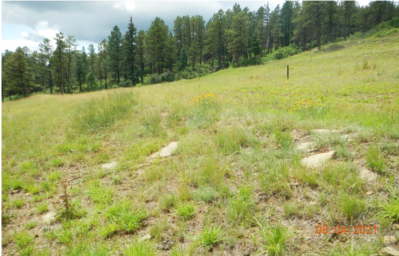
Photo 10. Facing southwest toward the location. The perennial vegetation is well established throughout the location.