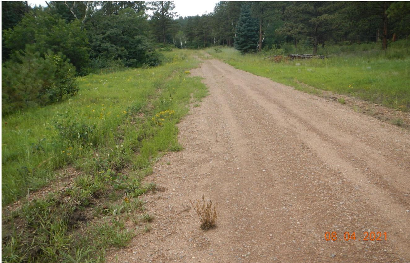
Photo 5. Facing west along the preexisting road traveling to the location.