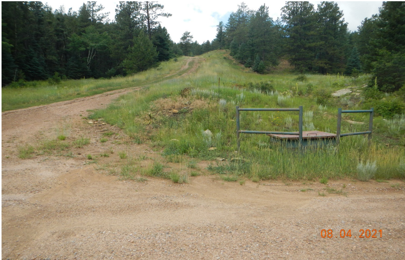
Photo 4. Facing west along the preexisting road traveling to the location. There is a metal valve box that needs to be removed.