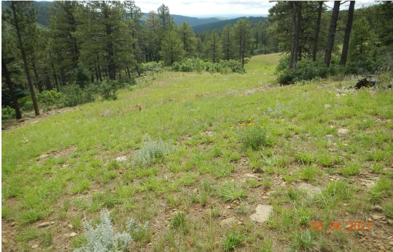
Photo 7. Facing southeast toward the access road which was recontoured and reclaimed.