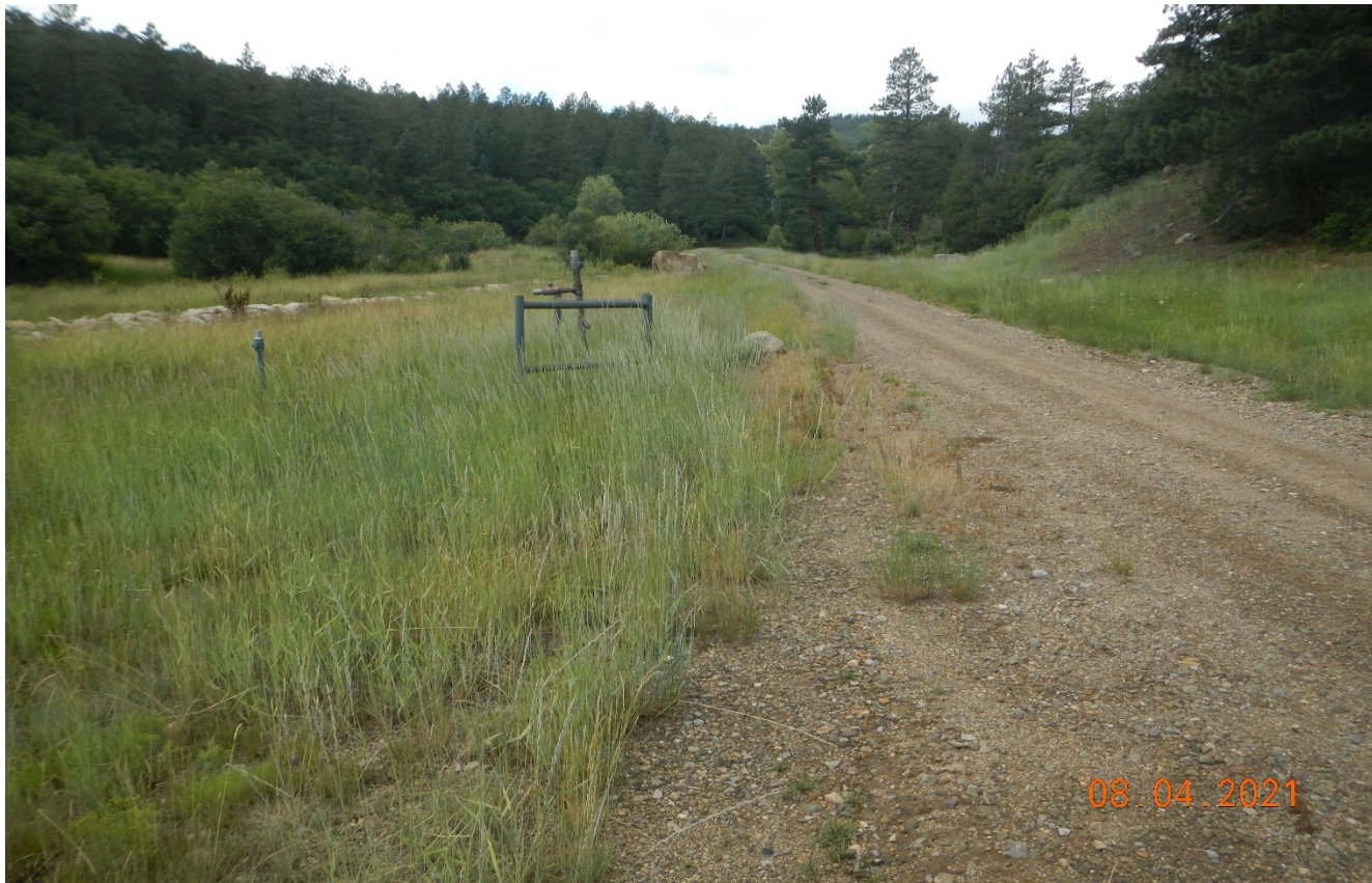
Photo 1. Facing northwest along the preexisting road traveling to the location. There are pipe risers that remain that need to be removed as there are no active sites beyond this point.