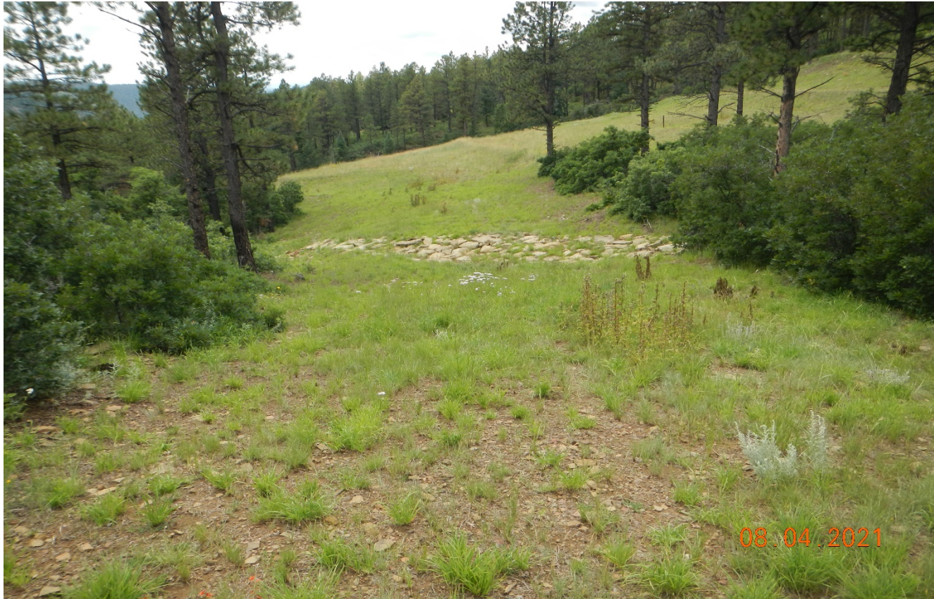
Photo 8. Facing southeast along the access road toward the location.