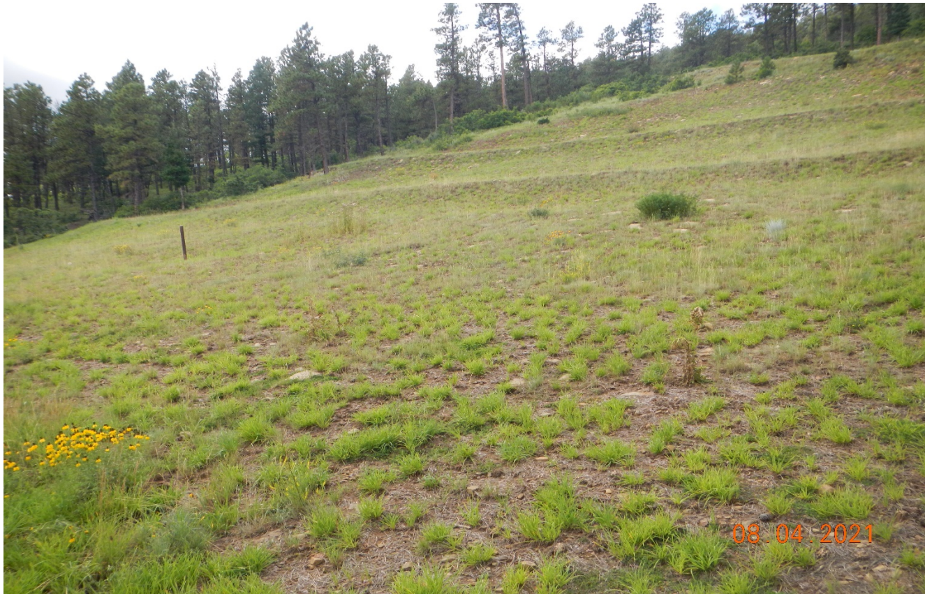
Photo 11. Facing southwest toward the upper portion of the reclaimed location.