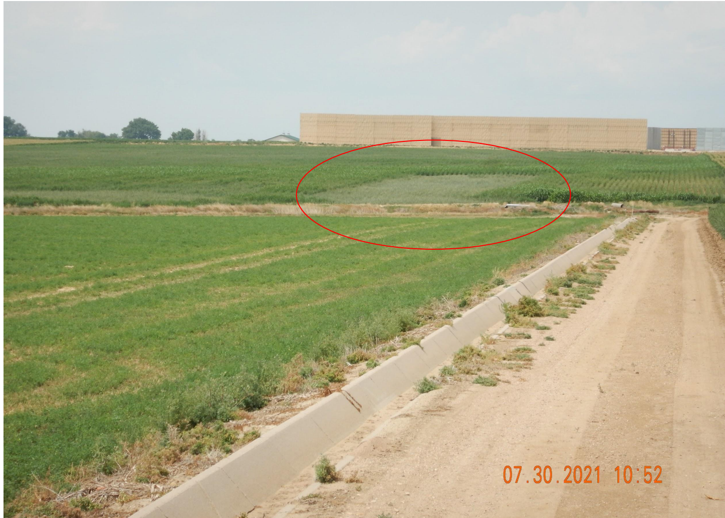
Photo 3. Photo taken east of the associated offsite tank battery, facing West. Photo illustrates final reclamation has been performed; however, crop growth is stunted throughout the entire tank battery. This is being addressed under a separate inspection.