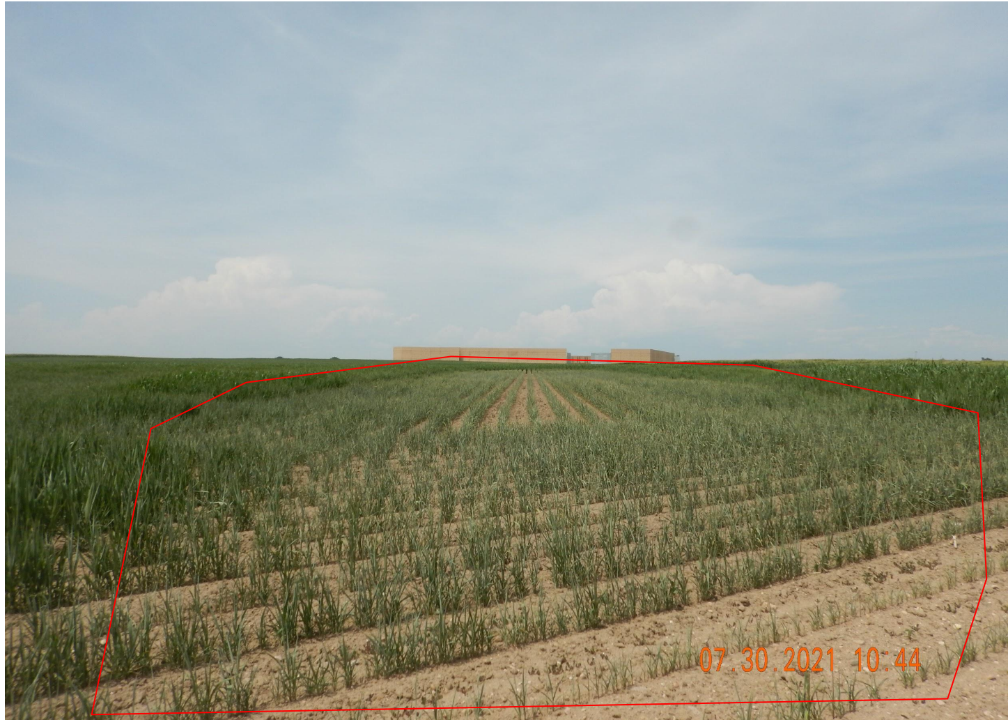
Photo 3. Photo taken from the associated offsite tank battery, facing West. Photo illustrates final reclamation has been performed; however, crop growth is stunted throughout the entire tank battery.