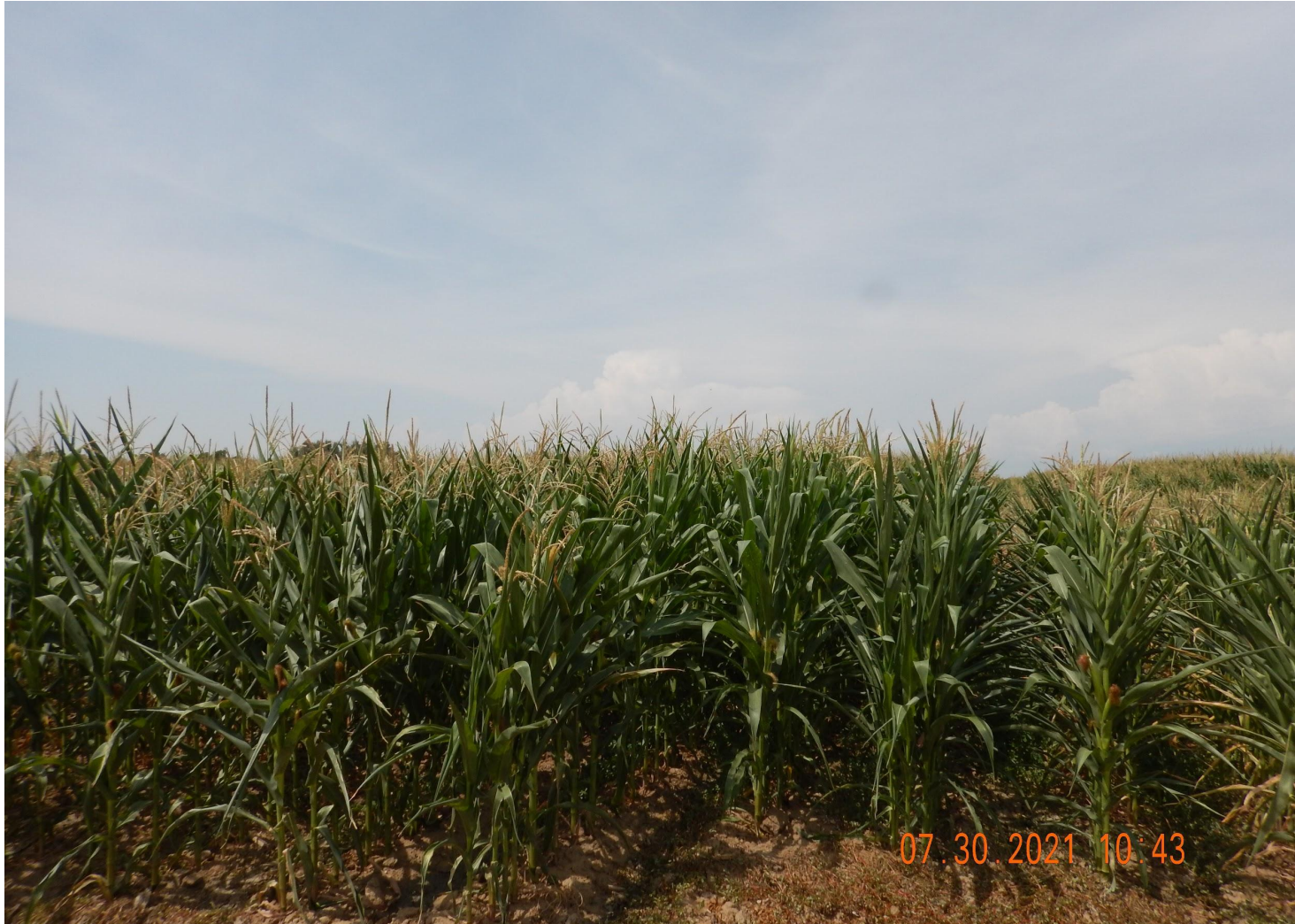
Photo 2. Photo taken from the east access road, facing West. Photo illustrates the well location and access road are reflective of reference crop areas.