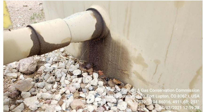
Photo 13 Stained soil, slow leak around threads