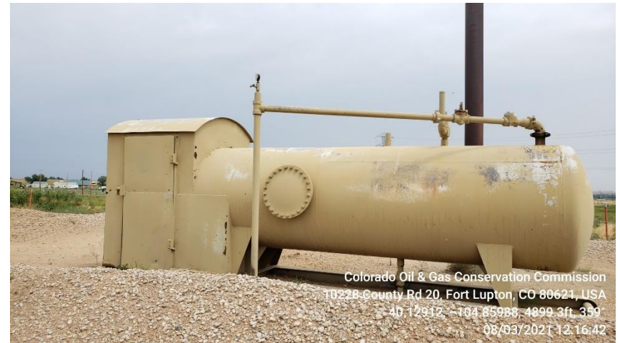
Photo 7 flow line manifold