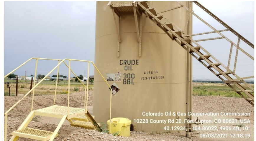
Photo 3 TB sign