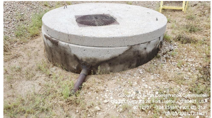
Photo 11 PW concrete vault, possible seepage