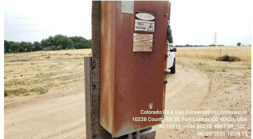
Photo 5 pump jack