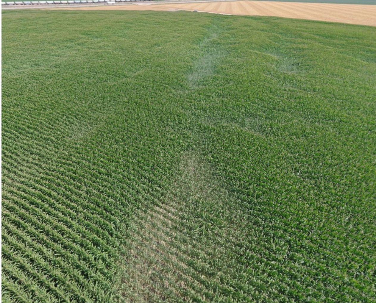
Photo 2. Drone aerial imagery taken from the wellhead, facing Southeast towards the tank battery. Photo illustrates the well location and well location access road are reflective of reference areas.