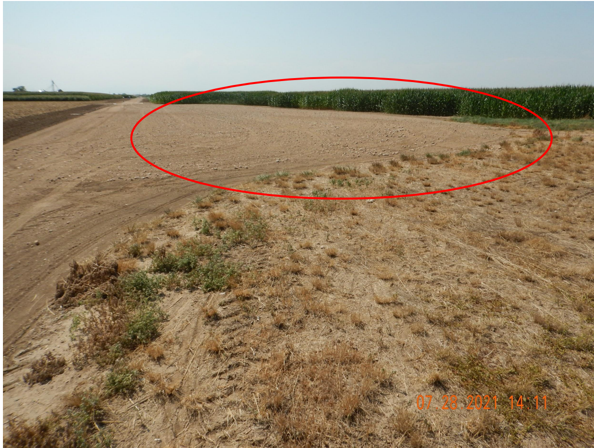
Photo 3. Photo taken from the associated offsite tank battery location, facing West. Photo illustrates all equipment has been removed; however, final reclamation has not been performed.