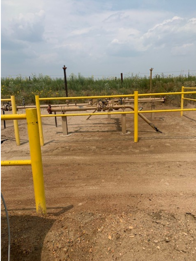
Looking north Surface staining associated with compressor release (mist)