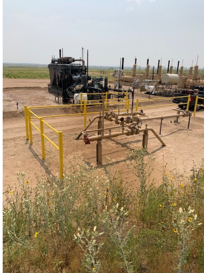
Looking southwest Surface staining associated with compressor release (mist)