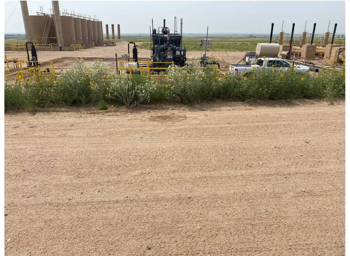
Looking south from road No petroleum hydrocarbon staining odor observed Confirmation samples collected – analytical pending