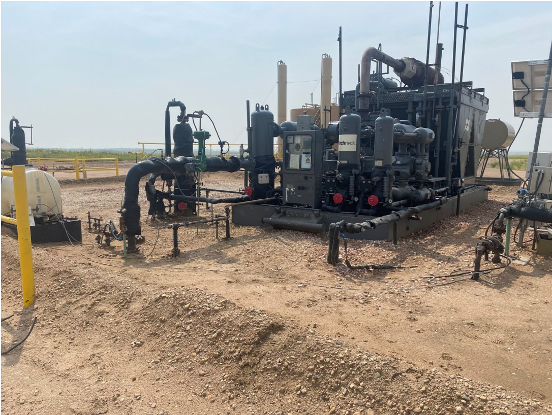
Looking southeast No petroleum hydrocarbon staining odor observed Confirmation samples collected – analytical pending