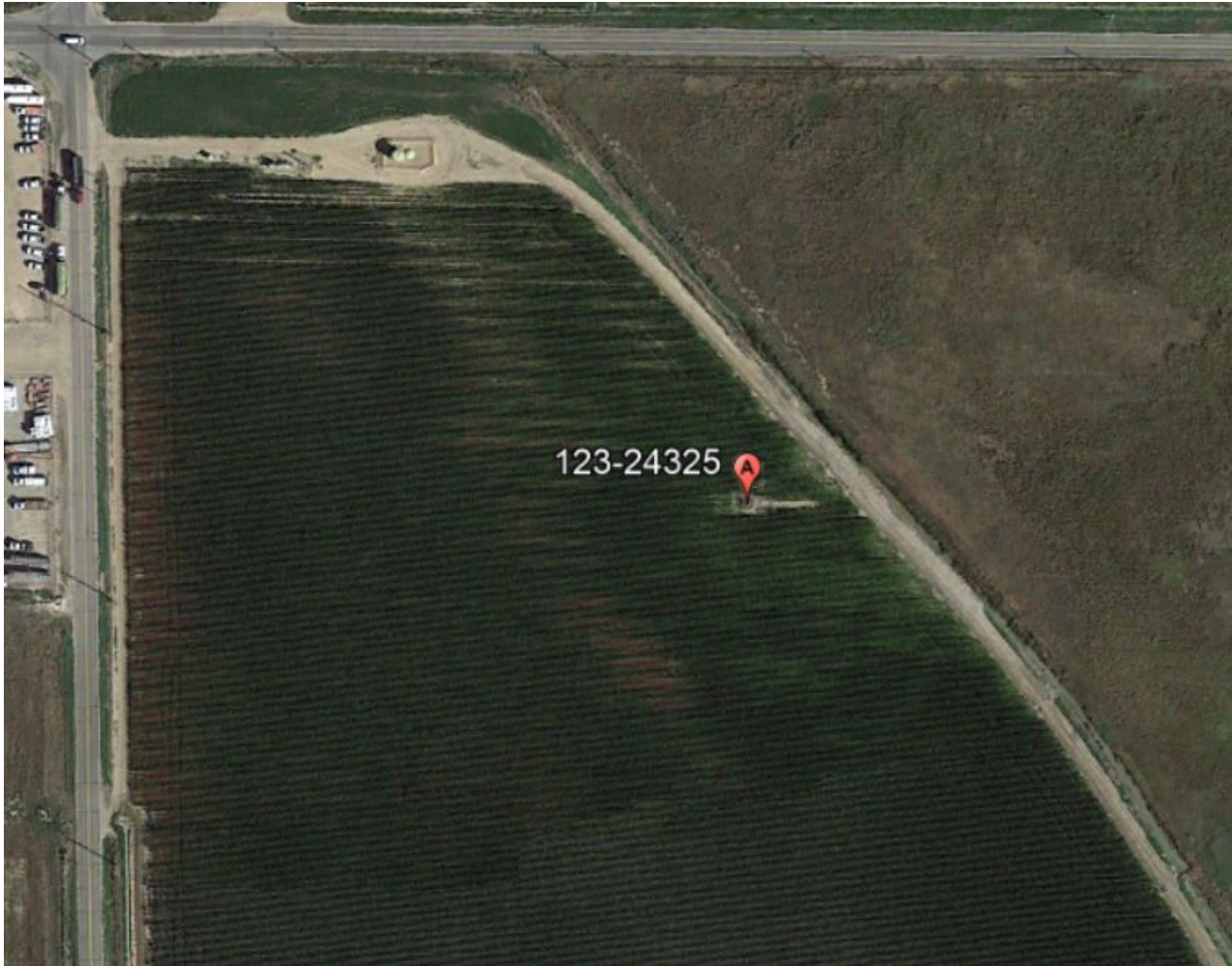
Photo 1. Google Earth aerial imagery taken 9/7/2016 during active operations. Photo illustrates the well location, well location access road and the offsite tank battery location.