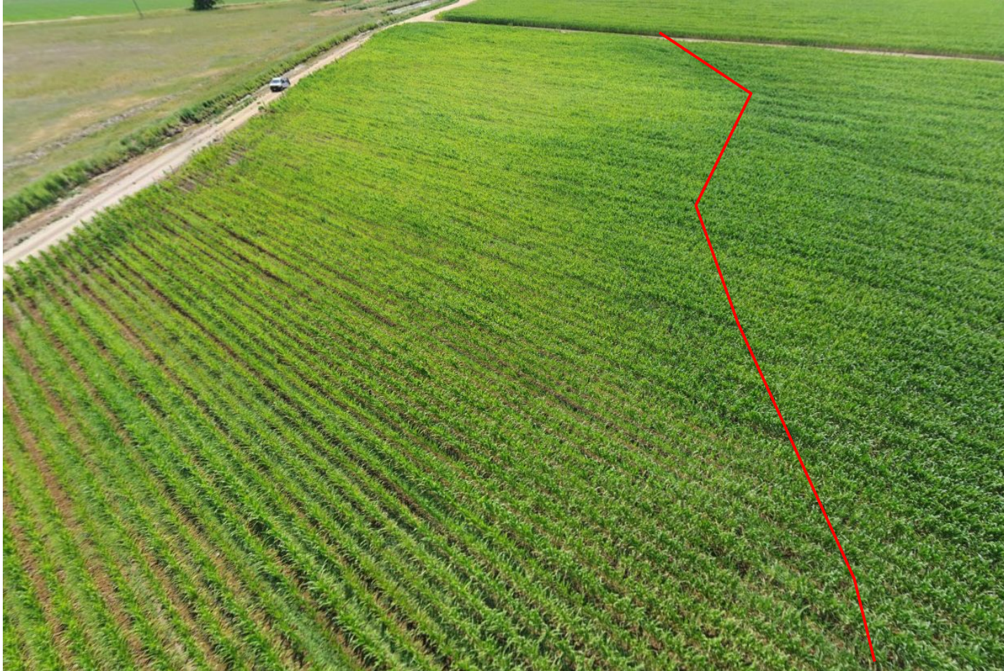
Photo 5. Drone aerial imagery taken from the wellhead, facing South. Photo illustrates the well location and the majority of the eastern reference field has stunted crop growth compared to the western field.