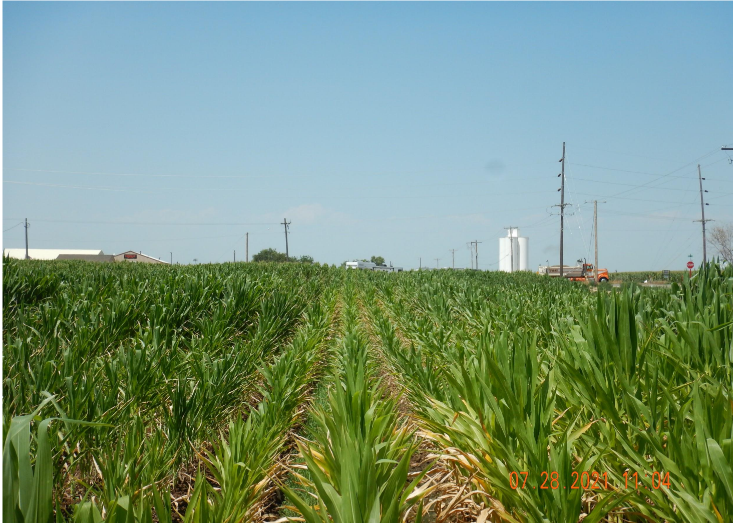
Photo 4. Photo taken from the eastern associated offsite tank battery, facing West. Photo illustrates the crop height is less than half of the reference areas throughout a majority of the location.