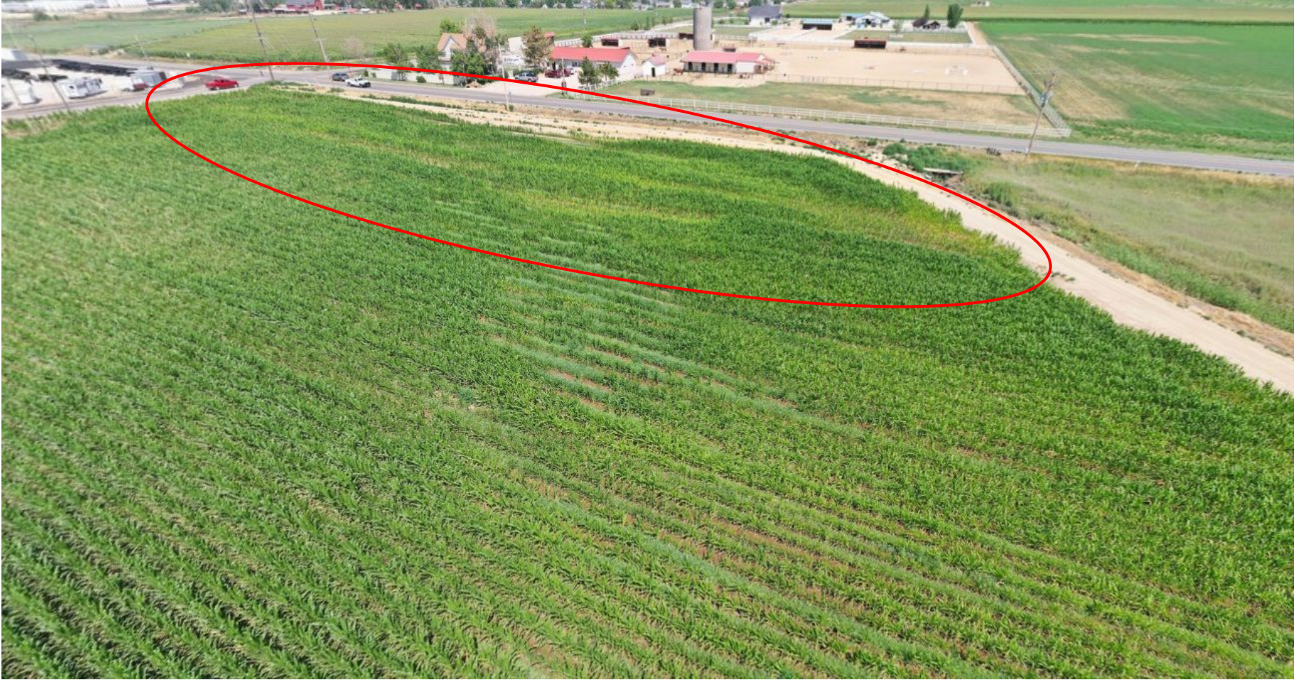
Photo 3. Drone aerial imagery taken from the wellhead, facing Northwest. Photo illustrates the associated tank battery is not reflective of reference area crops.