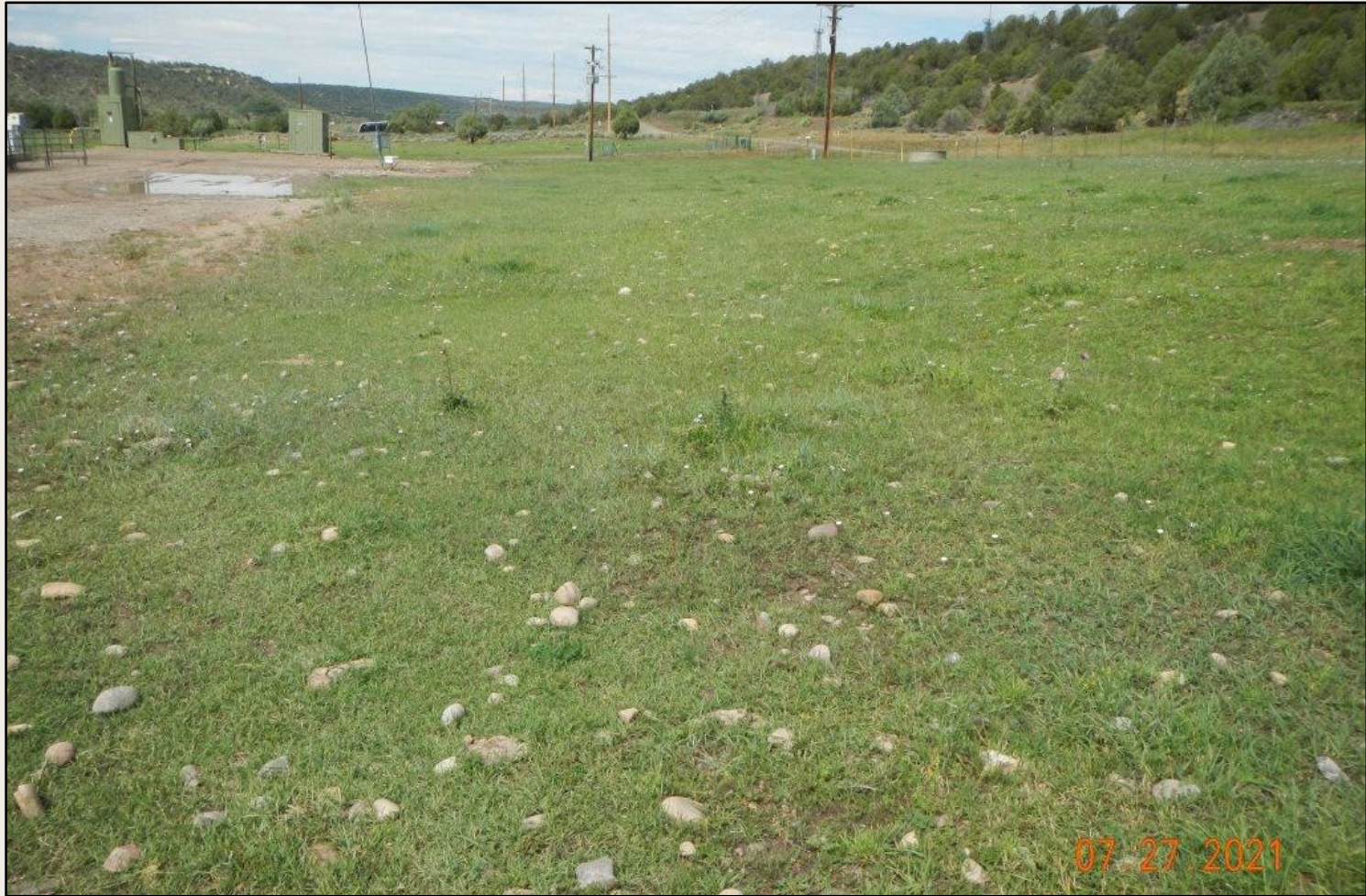
Photo 4. View of the northern project area from the northeastern corner facing westward. Revegetation is progressing with grasses typical of irrigated grass field such as orchard grass, tall fescue, and perennial ryegrass.