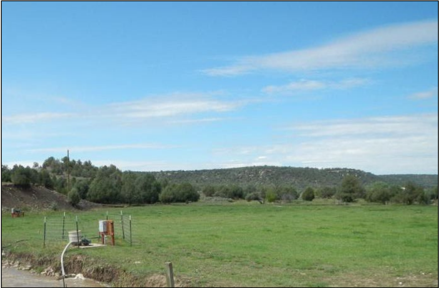
Photo 6. View of the reference area comprised of irrigated grass field with irrigated grasses such as those described in Photo 5.