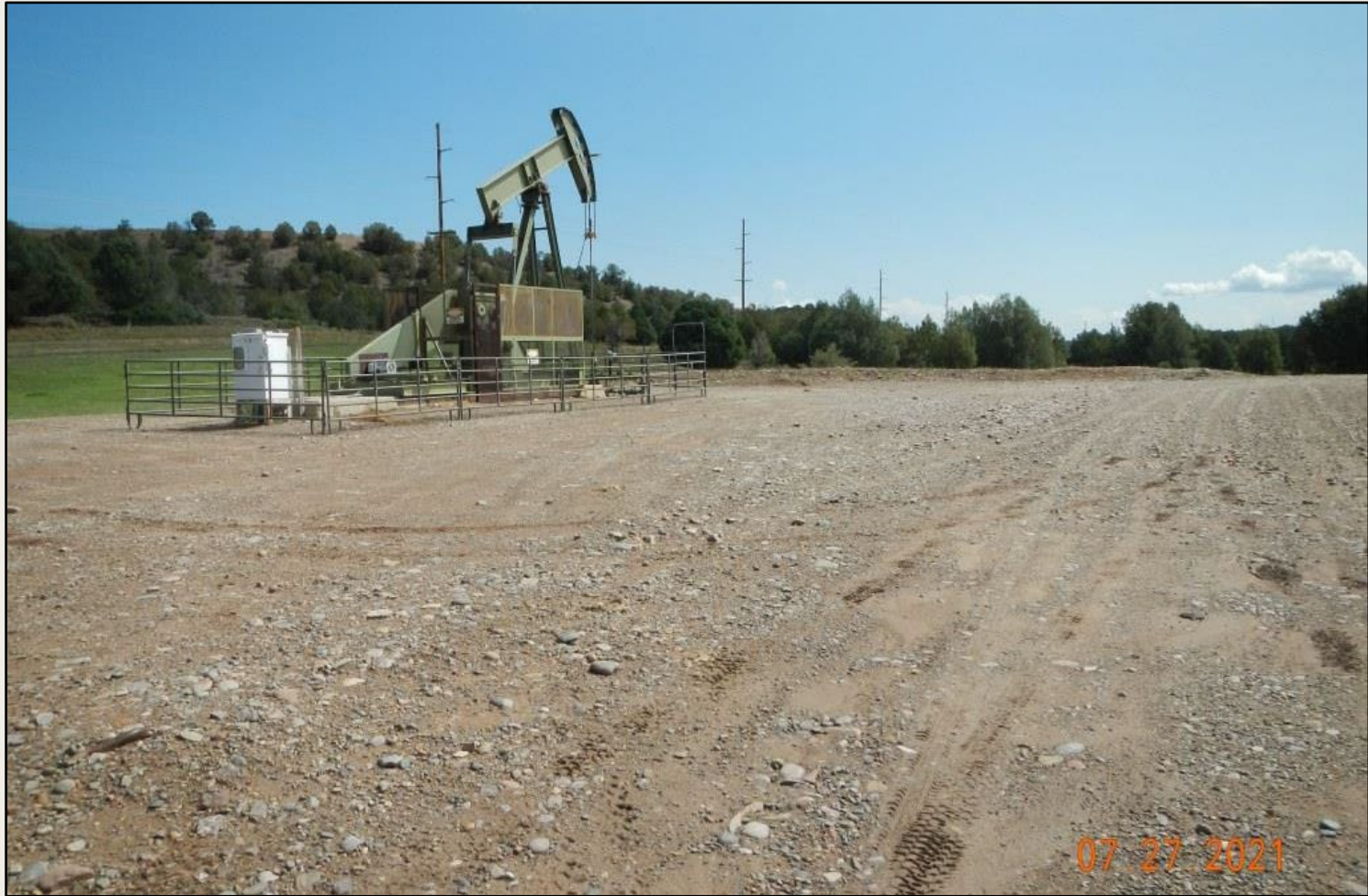
Photo 1. View of the project area from the well pad entrance facing center.