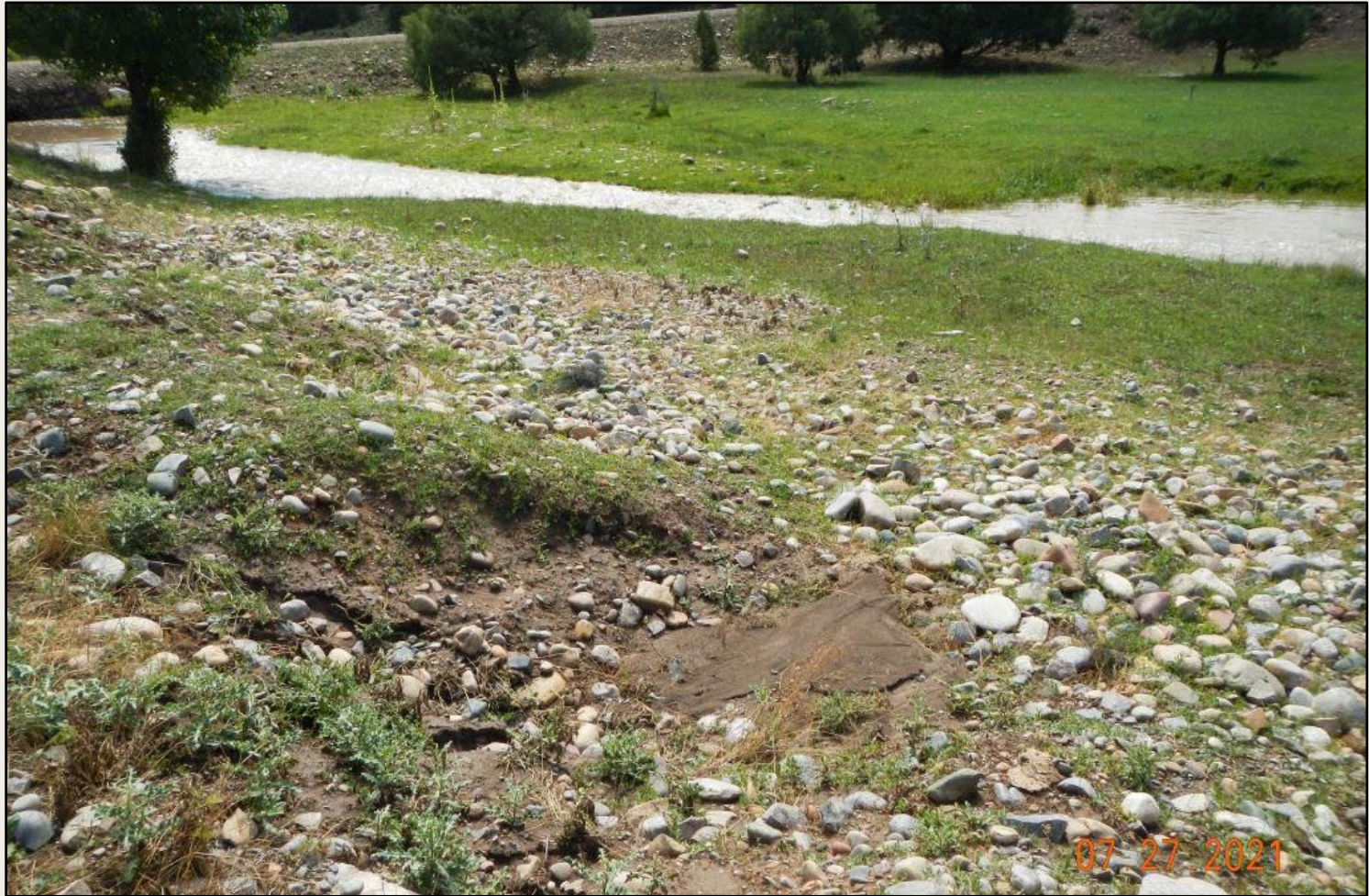
Photo 2. View of erosion occurring and sediment discharge occurring within the southern project area. Stormwater BMPs need to be installed to stabilize erosion and prevent discharge into the Florida River.