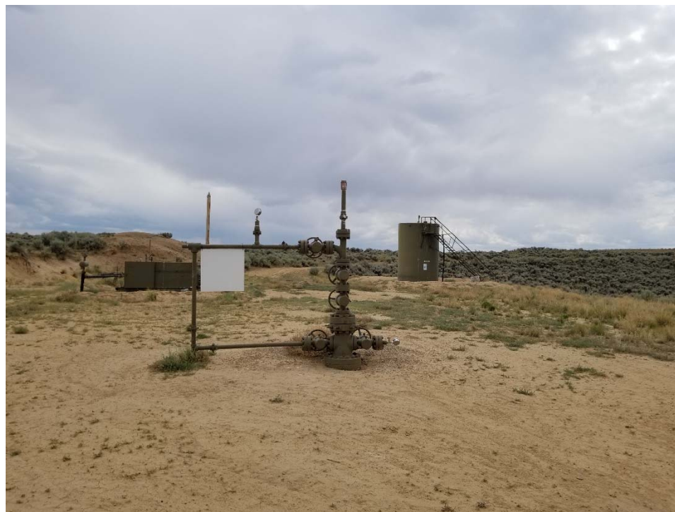
Photo 1. Overview of location taken facing east.