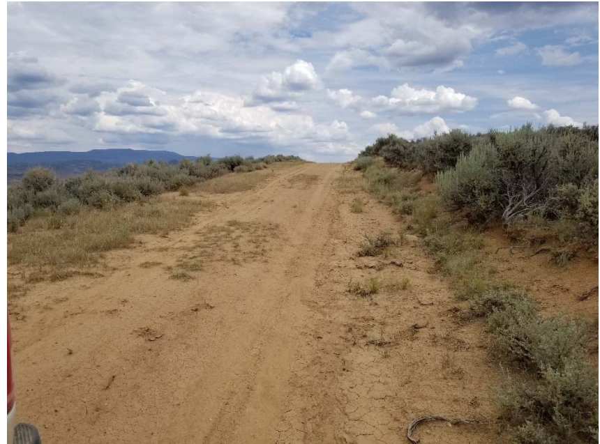
Photo 5. Sediment migration on access road.