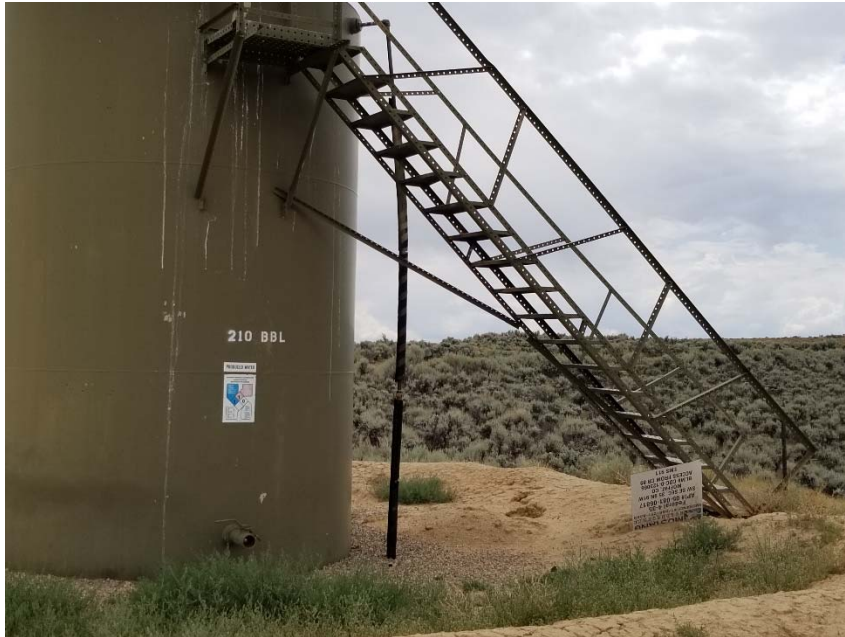
Photo 4. Annual weeds on location. Inaccurate battery sign. Incomplete tank label.