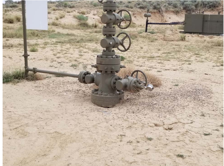
Photo 3. No bradenhead access apparent.