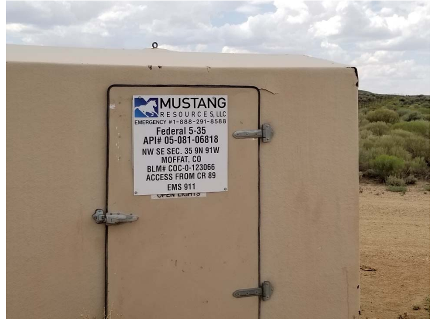
Photo 2. Sign at wellhead inaccurate.