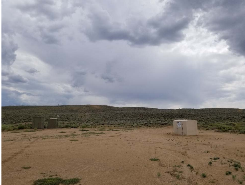
Photo 1. Overview of location taken facing south.