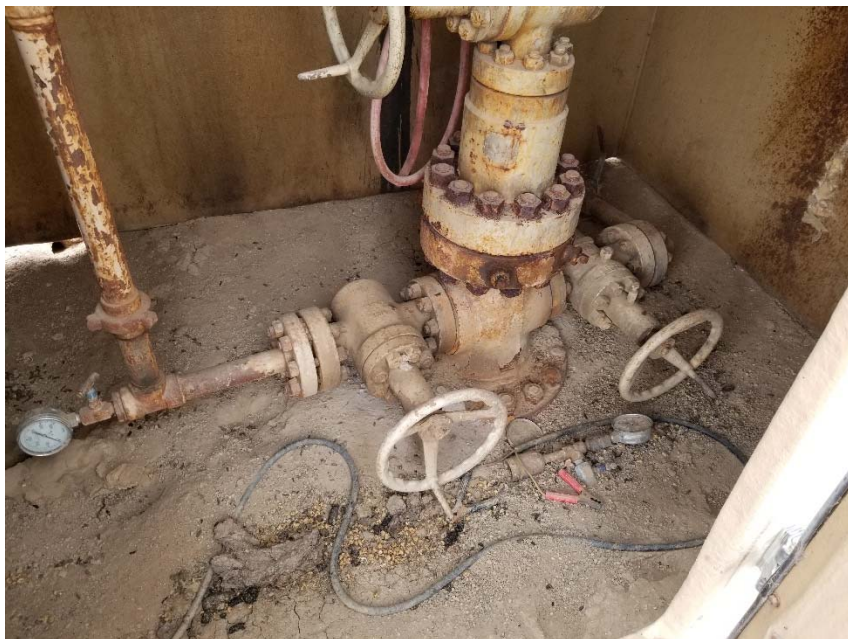
Photo2. No bradenhead access apparent.