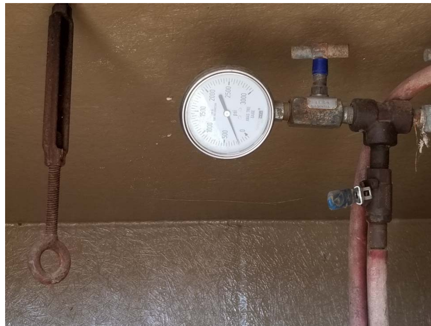
Photo 3. 200 psi on injection tubing.