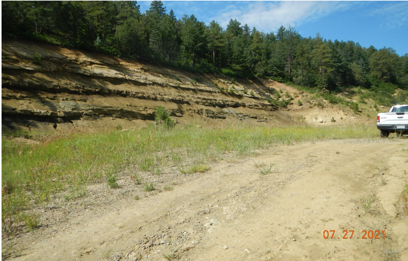
Photo 2. Facing southwest at the location. The location has not been recontoured and a steep cut slope remains.