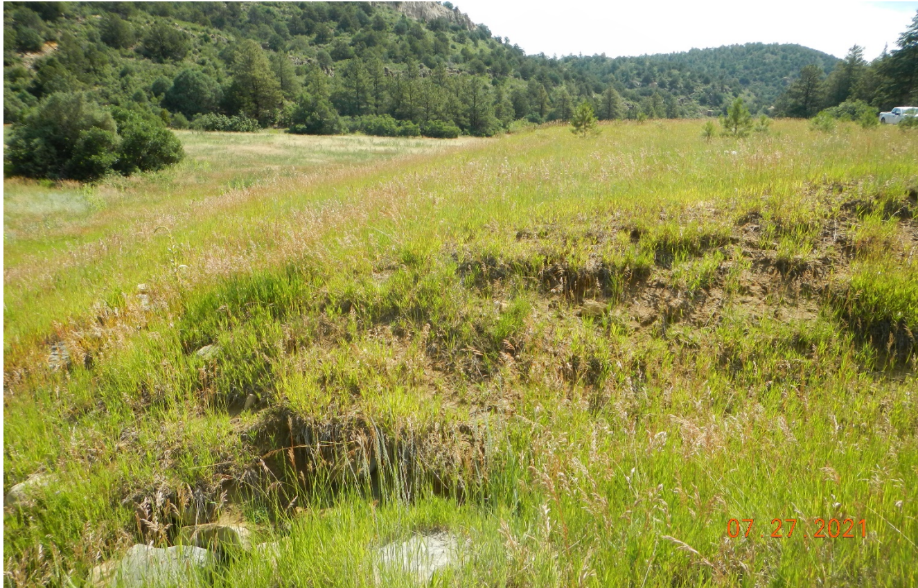
Photo 7. Facing east along the fill slope of the location which will need to be recontoured back into the cut slope.