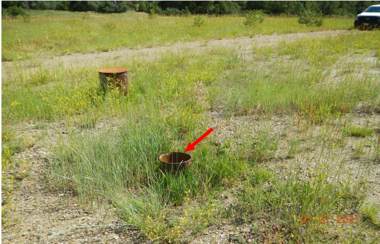
Photo 5. There are 3 steel casings that remain at center of the location. The casing shown at red arrow is not covered to prevent entry. The steel casings need to be removed.