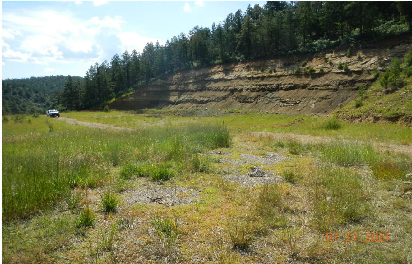
Photo 6. Facing southeast toward the location. The abandoned location needs to be recontoured and reclaimed.