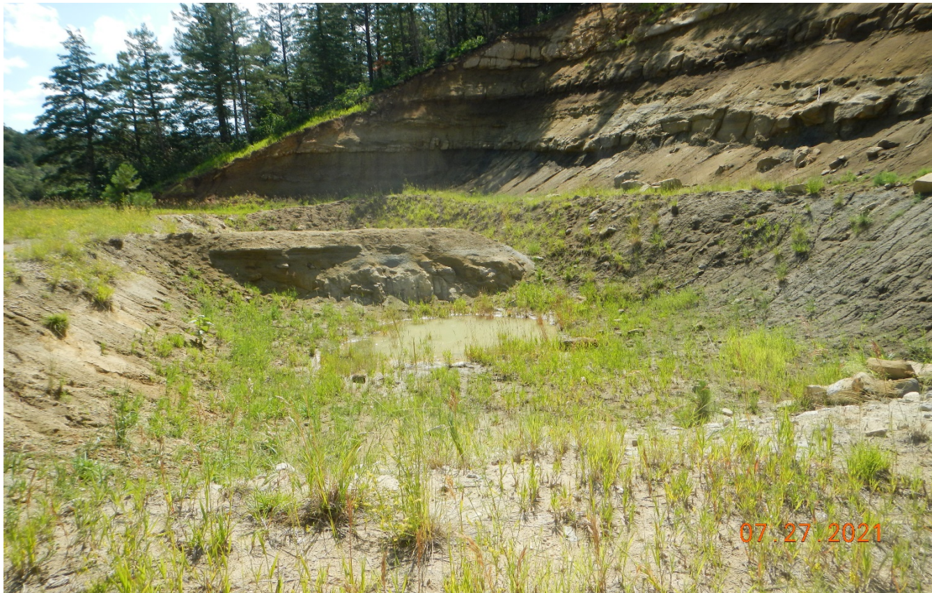
Photo 4. Facing east toward the pit at the base of the cut slope.