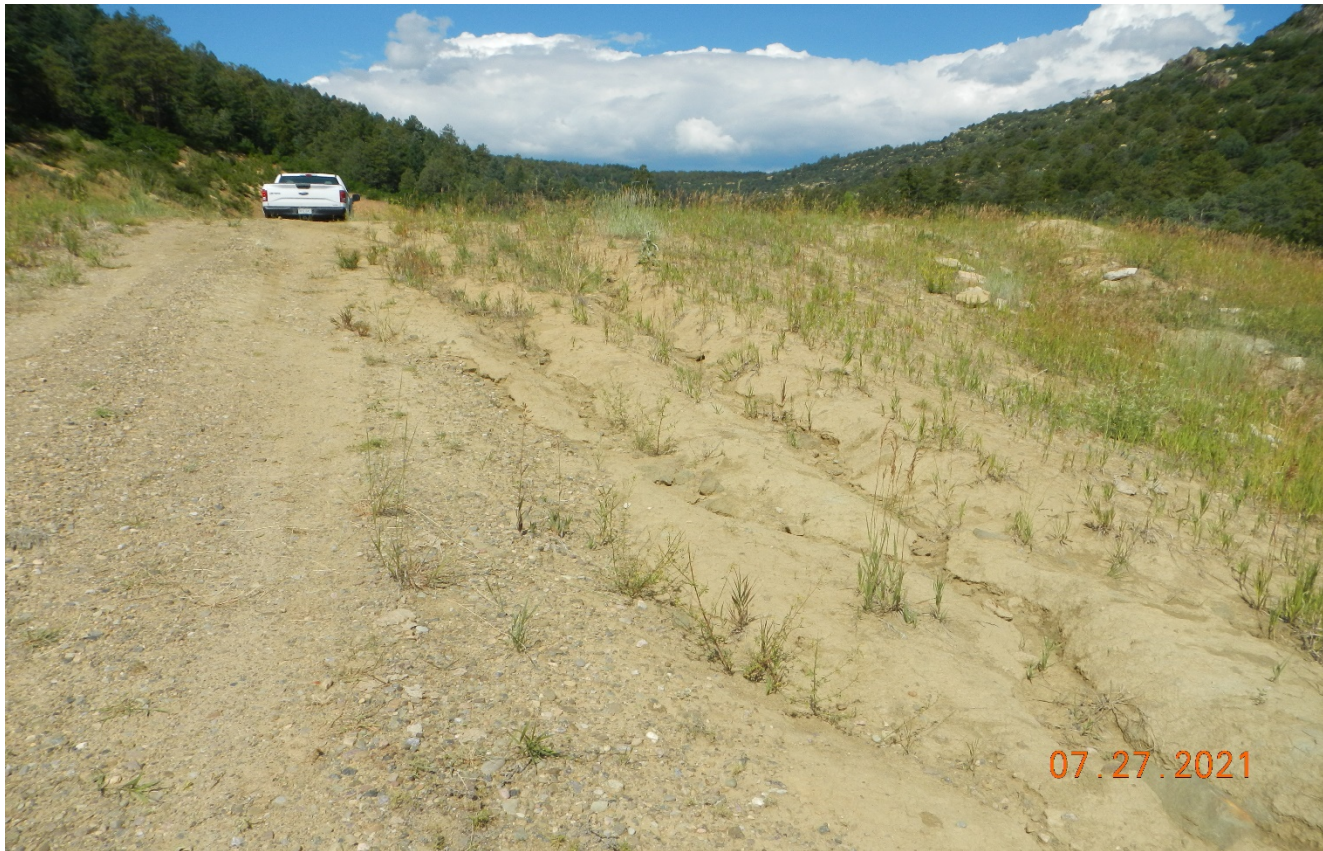
Photo 1. Facing west at the access road and toward the fill slope of the location. There are signs of erosion along this area.