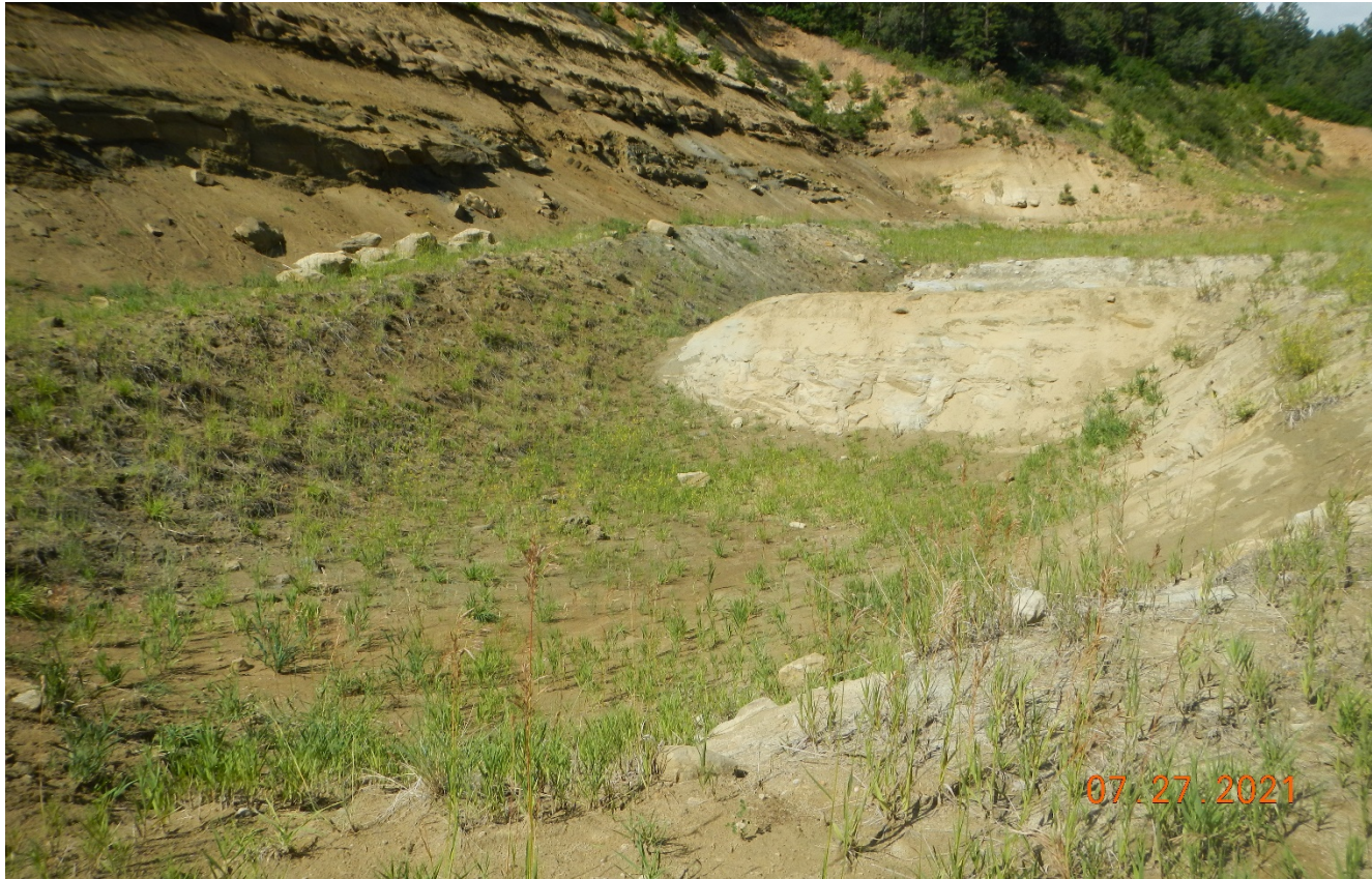
Photo 3. There is a pit that remains along the base of the cut slope at the locatoion.