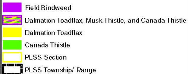
Figure 2. Railway Noxious Weed Treatment Map

Author: Erin Bailey Date: 7/26/2021 NAD 1983 UTM Zone 13N