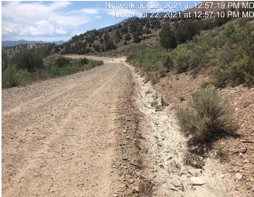
Photo #4549 Ditch that sediment was transported down and on to location #335096.