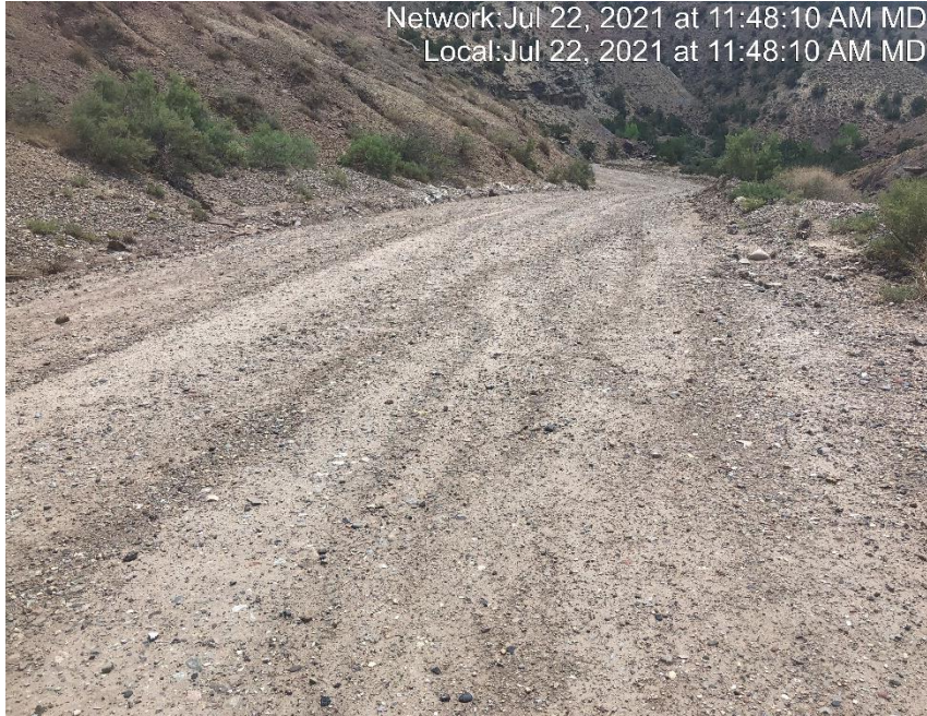
Photo #4539 No form of tracking BMP located at entrance to location.