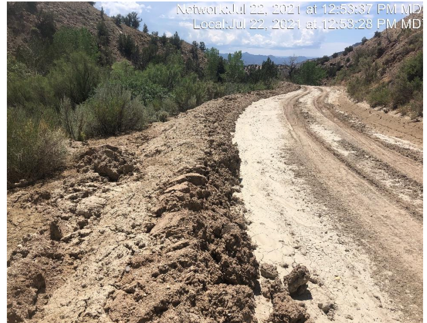
Photo #4546 Sediment appears to have been bladed to the side of access road.