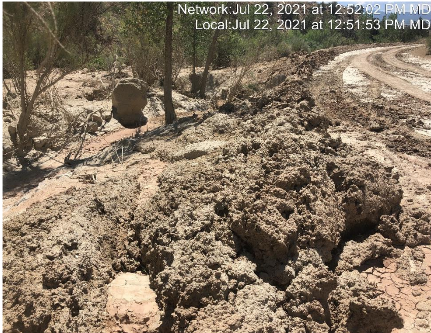
Photo #4545 Sediment appears to have been bladed to the side of access road.