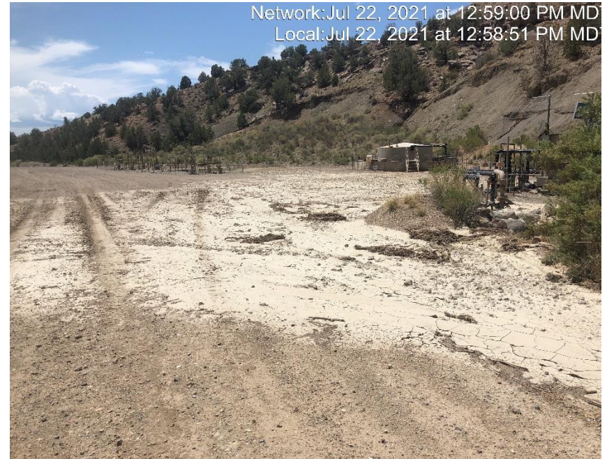
Photo #4550 Sediment and debris encroaching on production equipment.