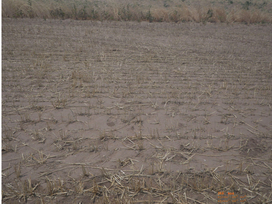
Photo 5. Photo taken from the associated tank battery location, facing West. See comments under Photo 4.