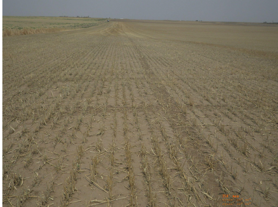
Photo 6. Photo taken from the associated tank battery location, facing North. See comments under Photo 4.