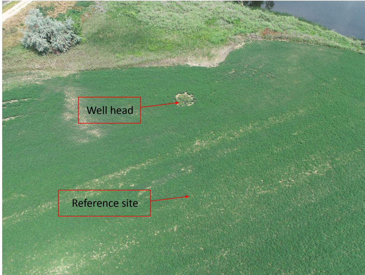
Photo 3. Drone photo taken south of well head displaying stunted growth within the well head footprint. Photo also displays reference site.