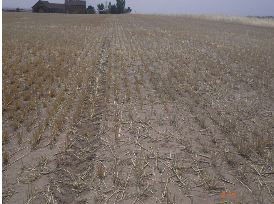
Photo 8. Photo taken from the associated tank battery location, facing South. See comments under Photo 4.