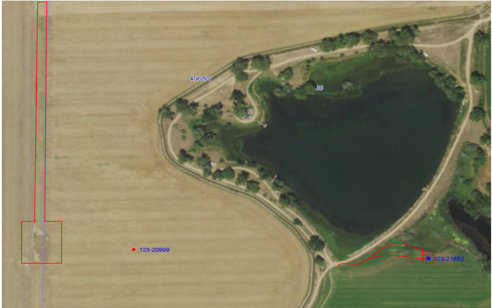
Photo 1. 2019 aerial imagery illustrates the well location, well location access road and associated tank battery.