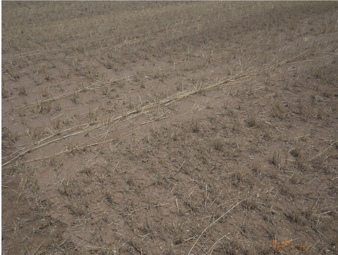
Photo 9. Reference photo was taken north of the tank battery facing northwest.