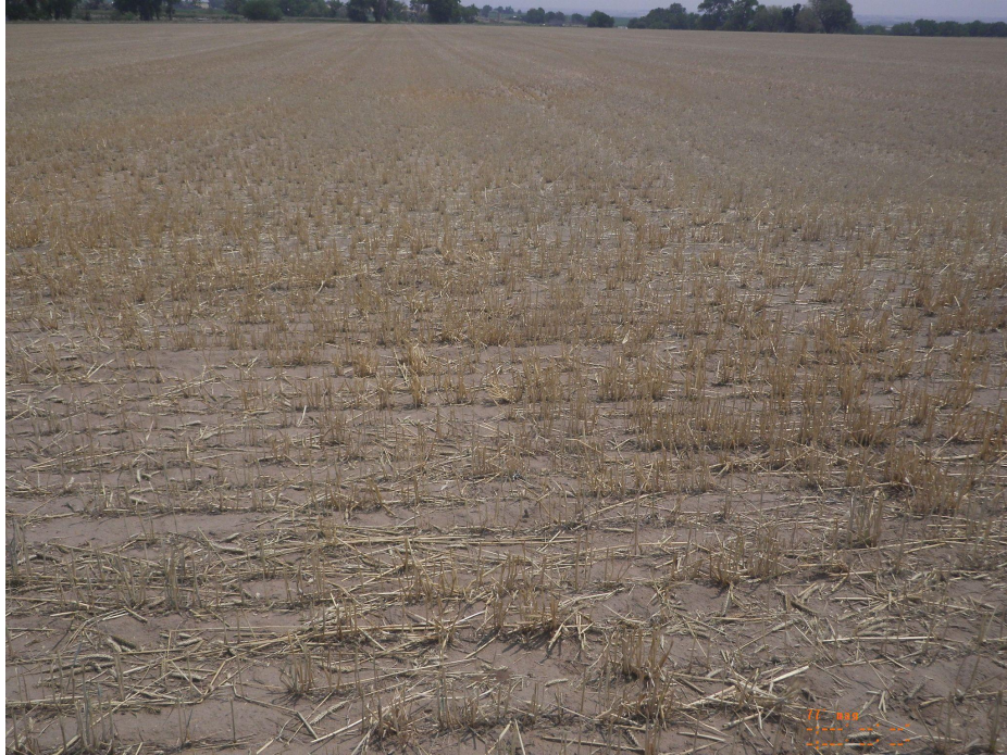
Photo 7. Photo taken from the associated tank battery location, facing East. See comments under Photo 4.