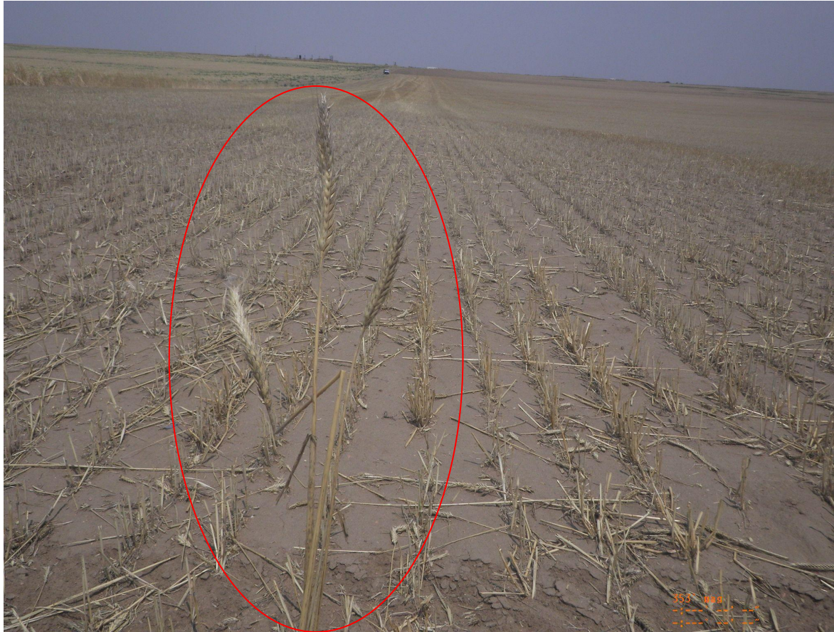
Photo 4. Photo shows detached crop plant in hand at the tank battery. Crop was harvested before site visit, however unharvested crop stalks at the reference site and tank battery were the same height.