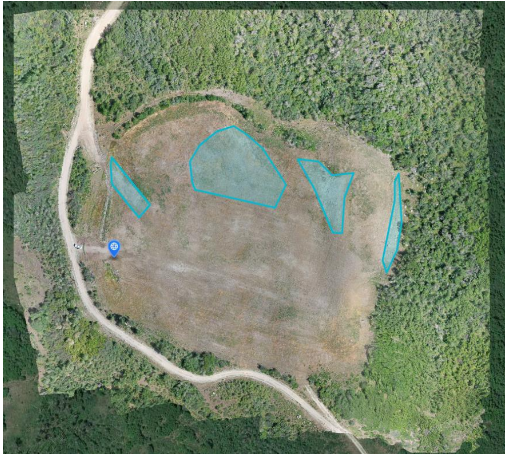
Photo 3: Photo shows example of areas on the north/northeast end of the Location where desirable plant germination/establishment was not evident, or not progressing towards 1004 Standards.