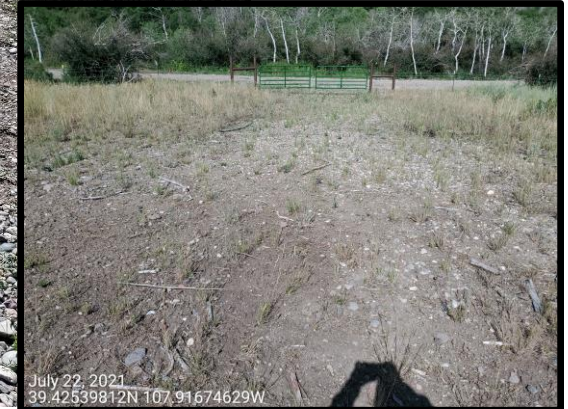
Photo 9: Photo taken from the Location entrance on the east end of the Location. Photo shows areas of the entrance has not been reclaimed in accordance with 1004 Rules; gravel/road base and culvert remaining. Areas require reclamation.