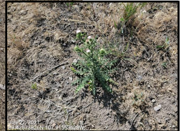
Photo 2: Photo taken from the Location. Photo provides example of noxious weeds observed remaining on the Location. Noxious weeds observed appears to be Plumeless thistle, houdstongue and bindweed.