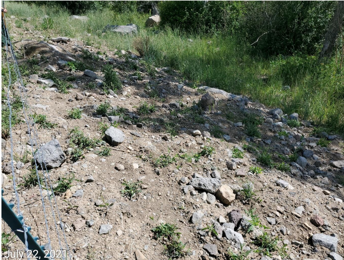
Photo 5.b: Photo shows areas of the Location's disturbance, on the east side of the fence line, that is not progressing towards 1004 standards.