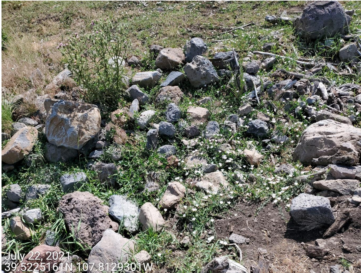
Photo 6: Photo shows noxious weed (bindweed) establishment observed on the northwest end of the Location.