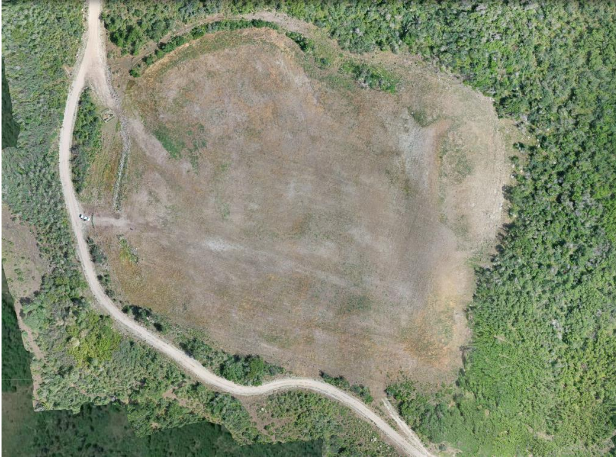
Photo 1: On 7/22/2021, Reclamation Specialist mapped the Location with the use of a small UAS. Photo shows aerial image of the location.