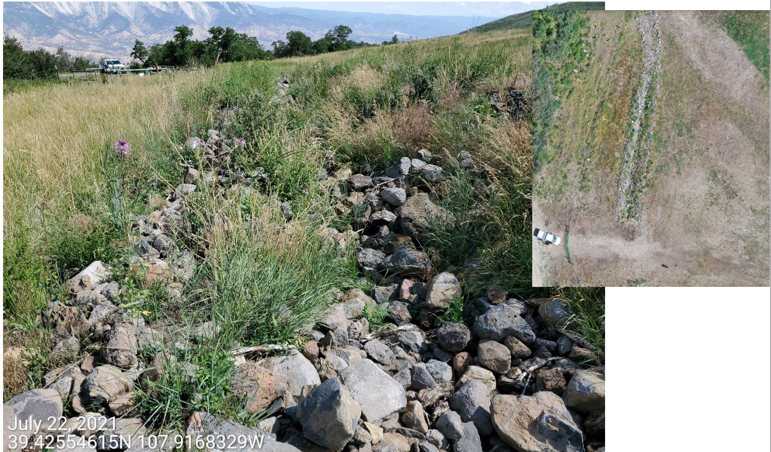
Photo 8: Shows stormwater diversion ditch remaining on the west end of the Location. Ditch should be removed/reclaimed if no longer required; ditch and culvert will required removal for site to receive a passing final inspection.