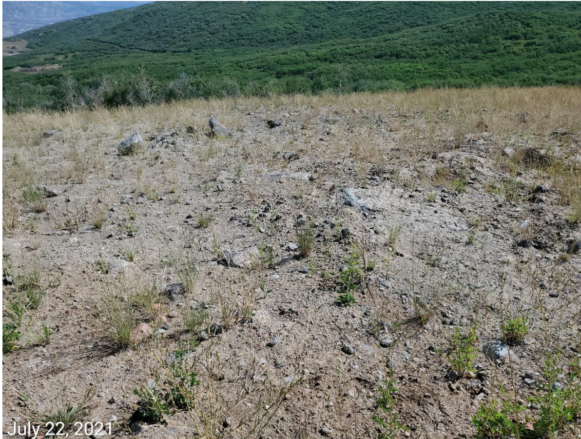
Photo 3.b: It was observed that areas on the north/northeast end of the Location is not progressing towards 1004 standards. Photo shows example of areas observed.