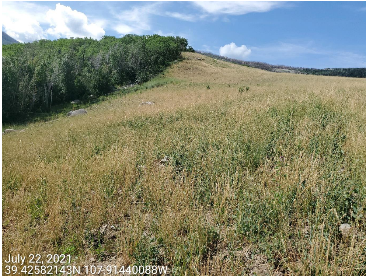
Photo 4: Photo taken from the east end of the Location, facing south. Photo shows example of areas observed where reclamation is progressing towards 1004 standards.