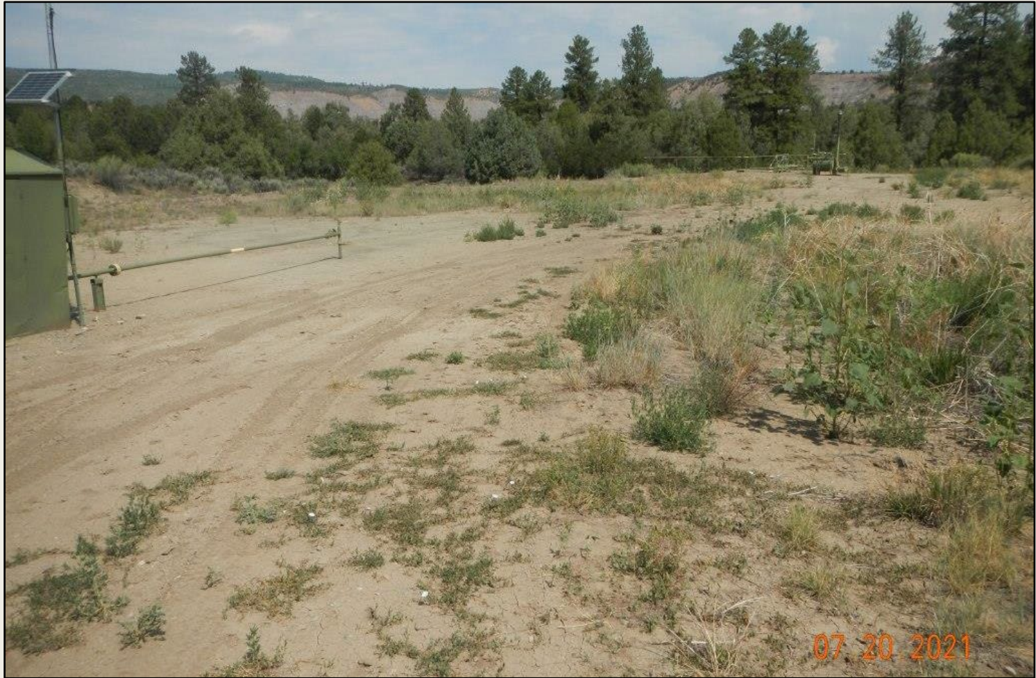
Photo 1. View the project area from the well pad entrance facing center.