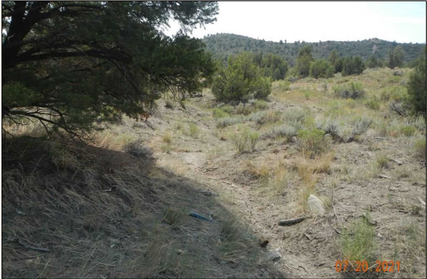
Photo 5. View the reference area comprised of pinyon and juniper woodland with scattered ponderosa pine trees and rubber rabbitbrush, western wheatgrass, Indian ricegrass, and sagebrush in the understory.