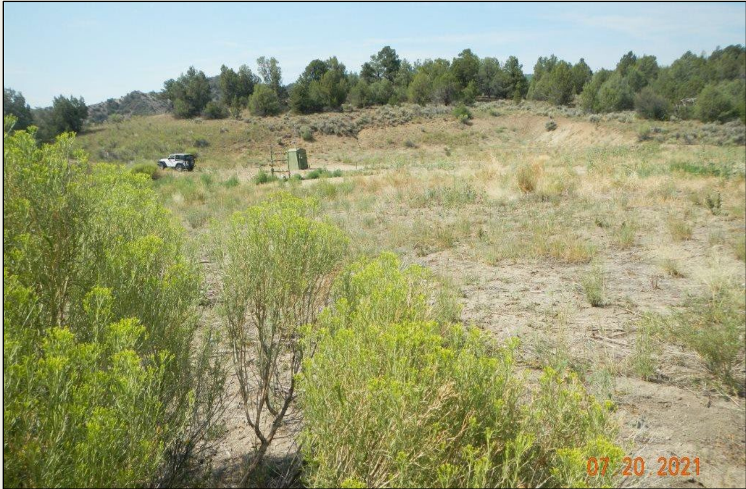
Photo 3. View of the western portion of the well pad facing southward.