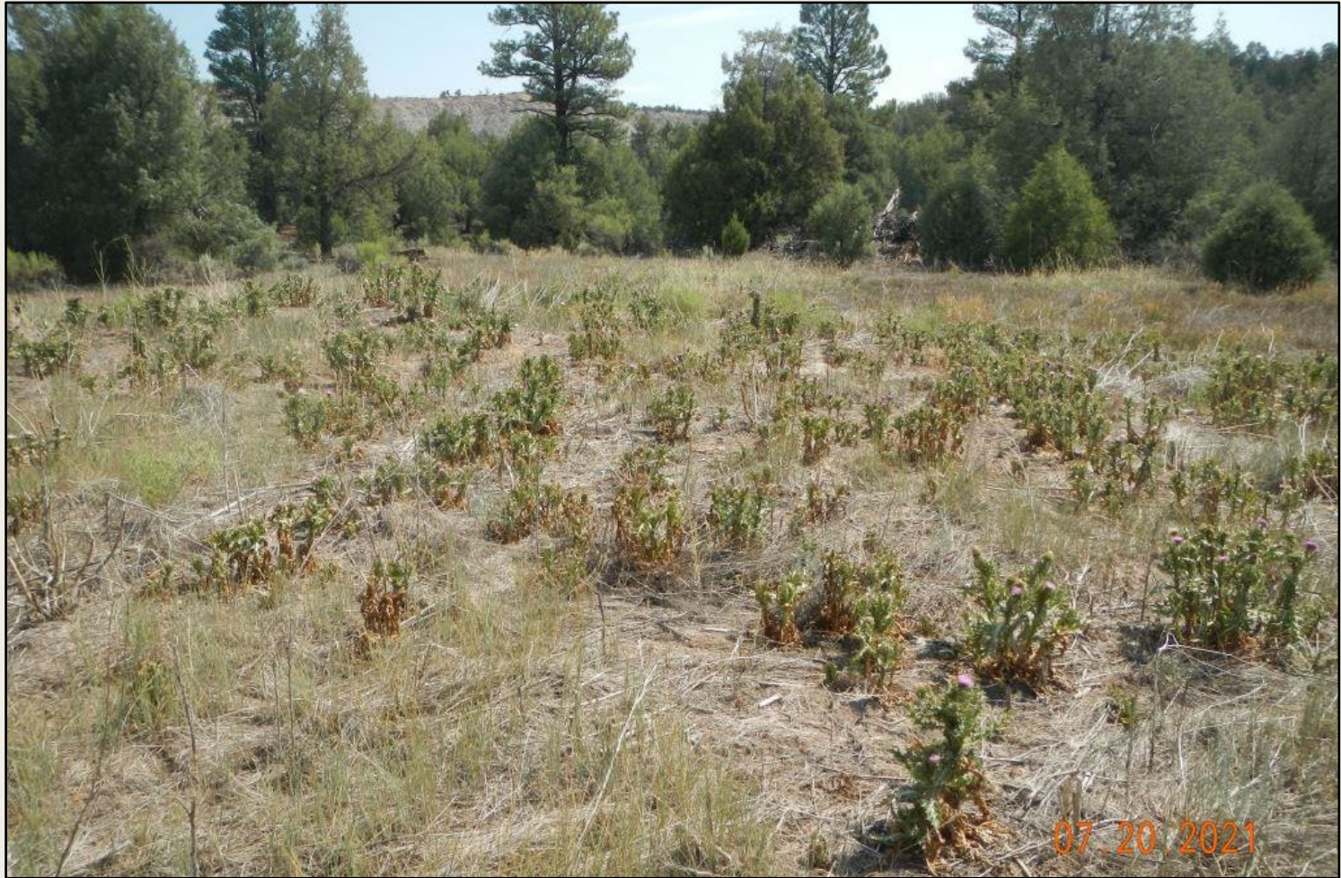
Photo 2. View the eastern project area facing eastward from the edge of the working area. Musk and Canada thistles are infesting the site. Approximately 500 individuals observed. Vegetation such as western wheatgrass, Indian ricegrass, and crested wheatgrass observed.