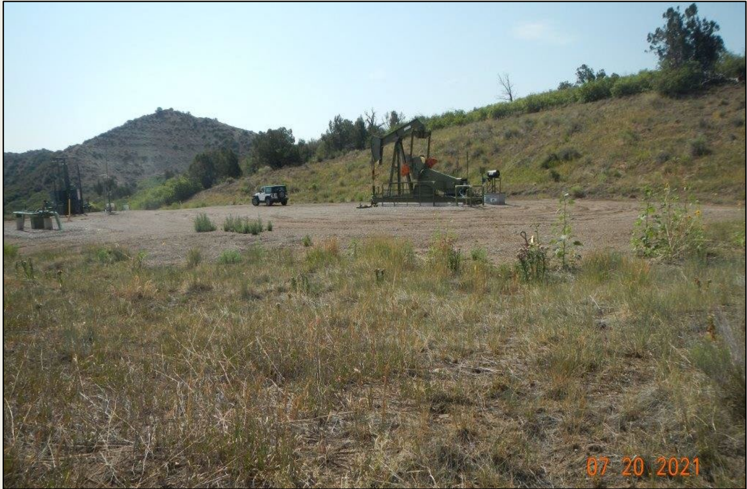
Photo 1. View the project area from the northwestern corner facing center.