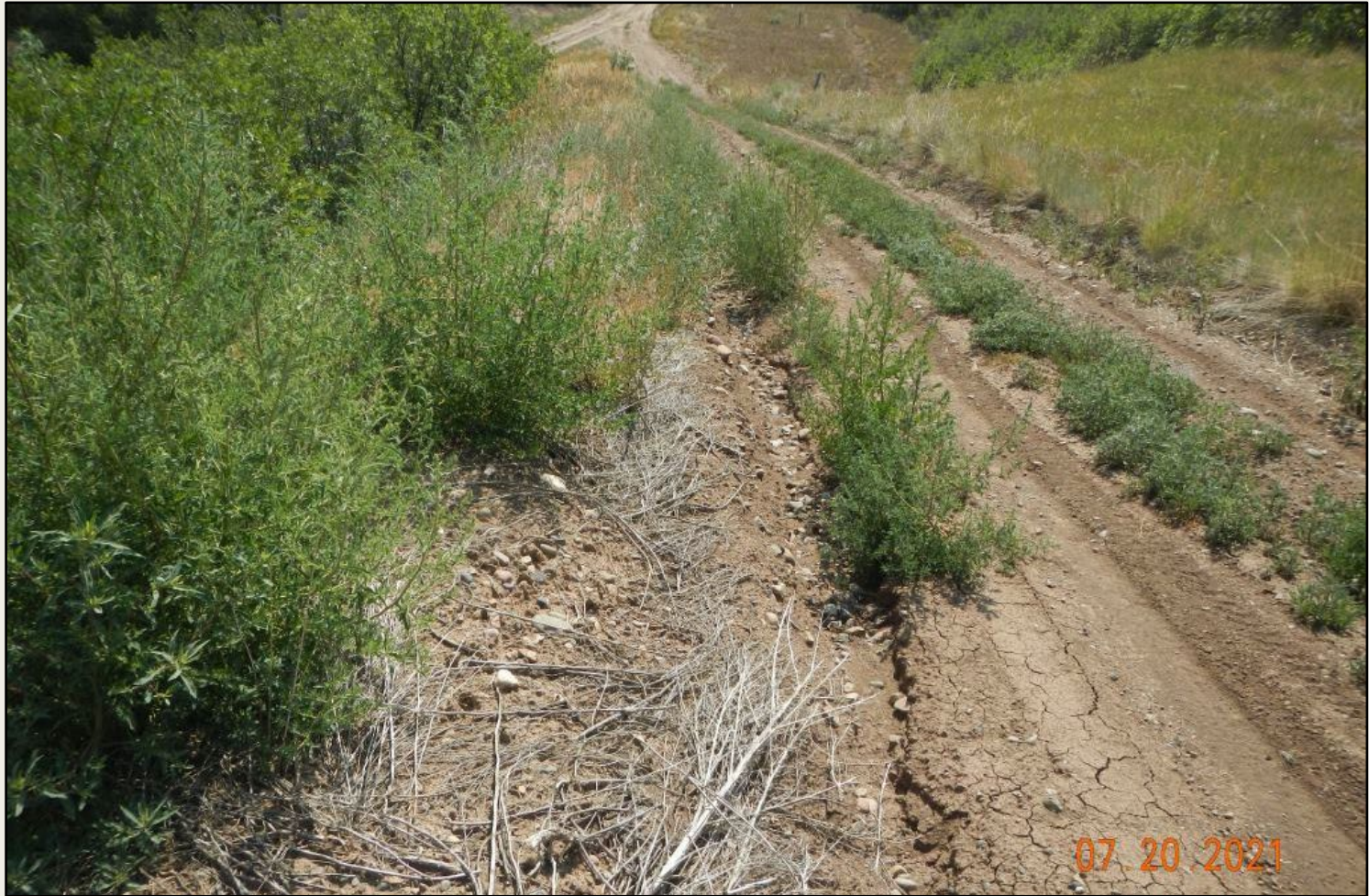
Photo 4. View of erosional channeling (approx. 12 inches wide and 4-6 inches deep) near the well pad entrance needing stabilization.