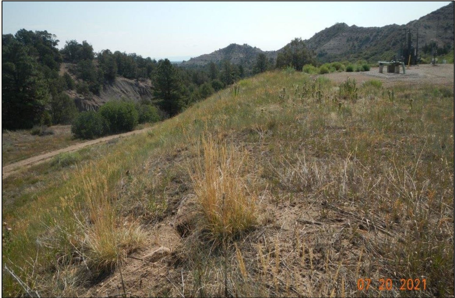
Photo 2. View of the northern project area from the northwestern corner facing eastward. Revegetation is progressing with smooth brome, crested wheatgrass, and western wheatgrass.