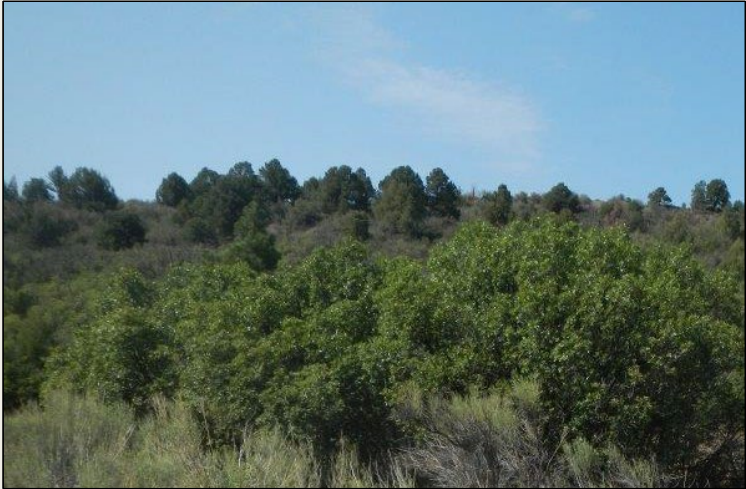
Photo 5. View the reference area comprised of gambel oak shrubland with pinyon and juniper trees and scattered ponderosa pine trees. Vegetation in the understory includes western wheatgrass, Indian ricegrass, Indian paintbrush, and goldenweed.