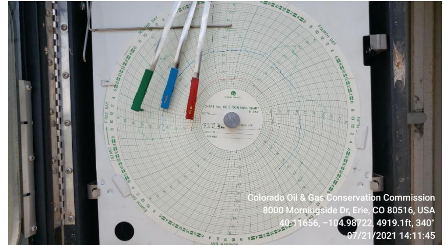
Photo 15 Gas Meter Run