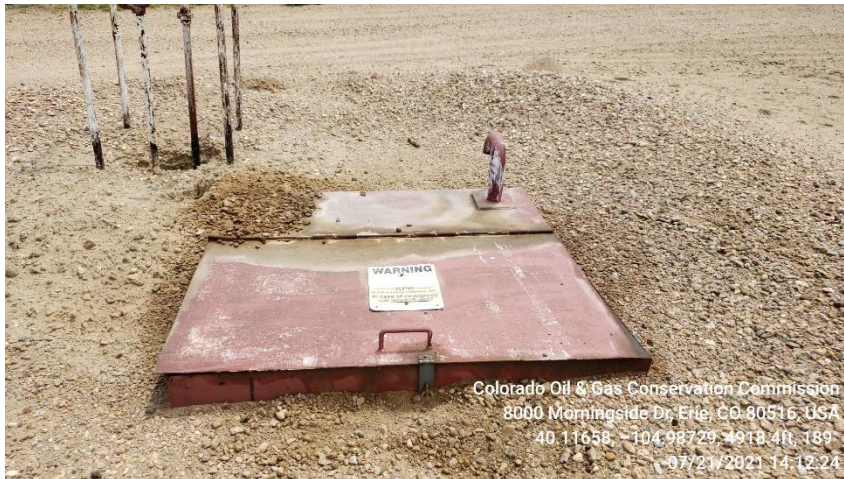
Photo 17 Stained soil around a Locked Cellar