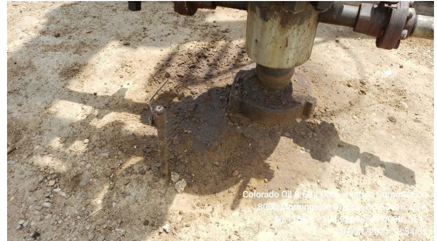
Photo 3 Stained soil near WH