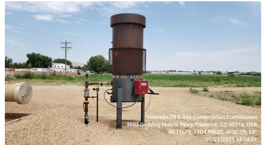
Photo 11 Horizontal Heated Separator