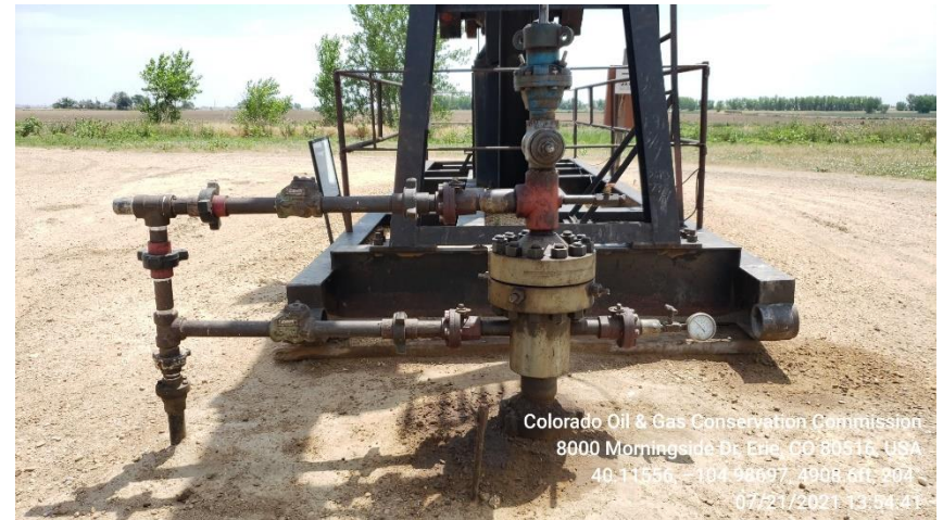
Photo 1 WH sign