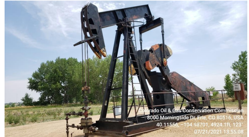
Photo 5 Stained soil near WH at Pump Jack base