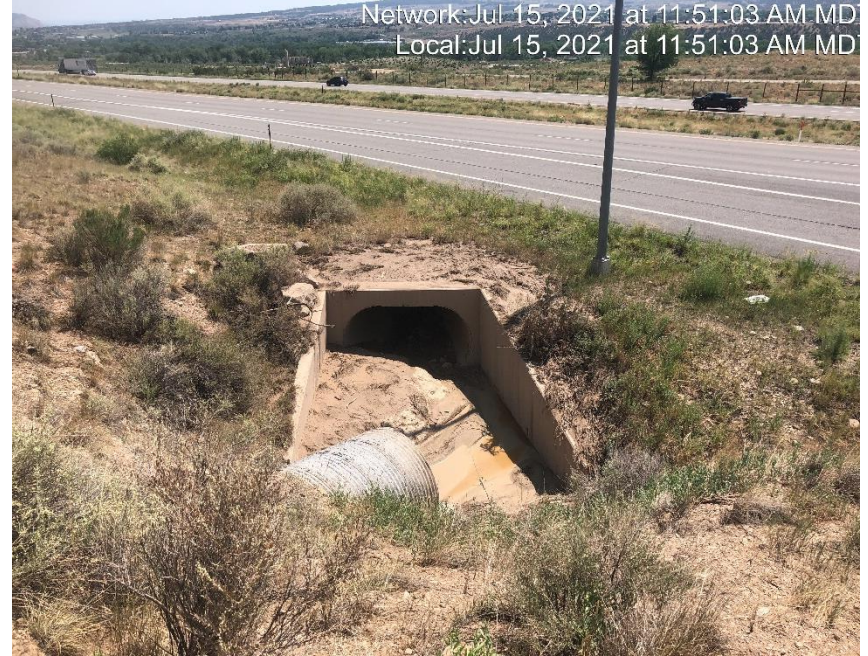
Photo #4459 outlet of culvert under HWY 6 and inlet of culvert that runs under I-70 and into the Colorado River.