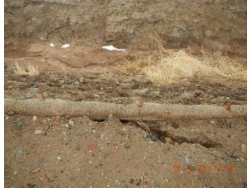
Photo from inspection #701101162 conducted on 2/12/21