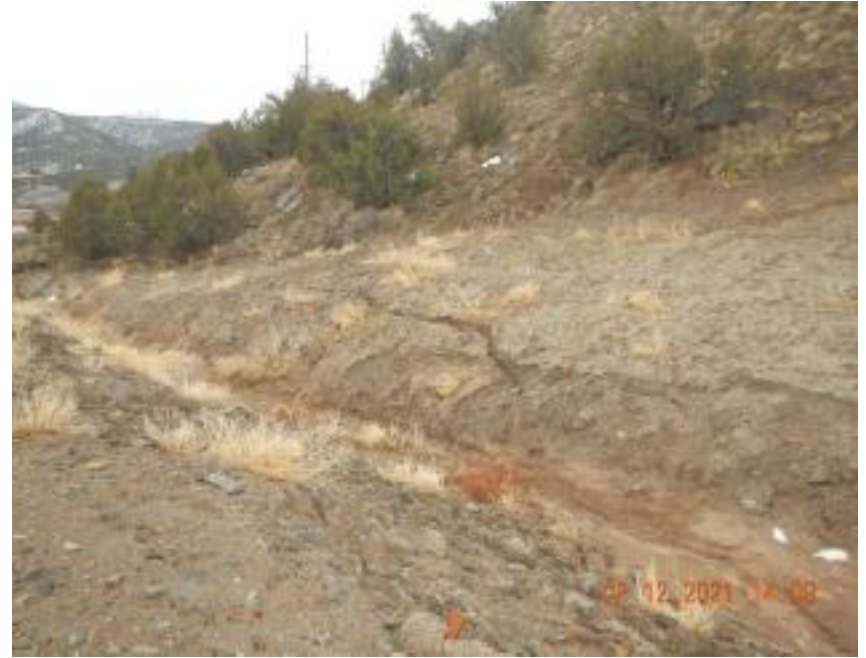
Photo from inspection #701101162 conducted on 2/12/21