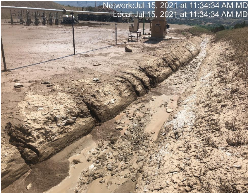
Photo #4441 Ditch on West side of location shows signs of subsidence.