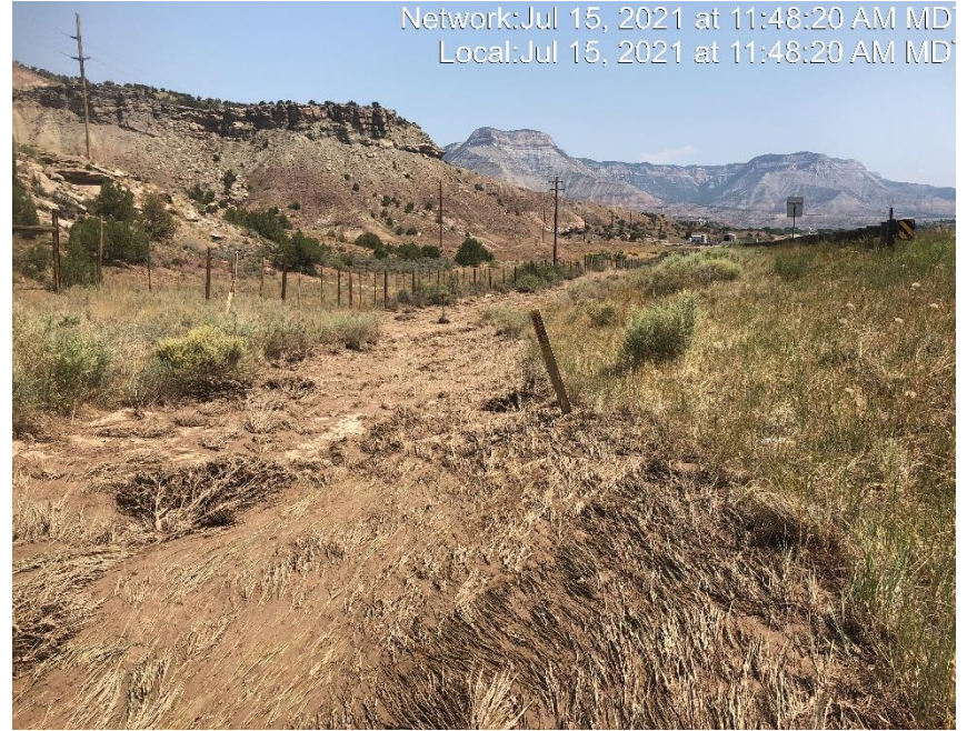
Photo #4457 Storm water and debris carried down pipe line right of way.