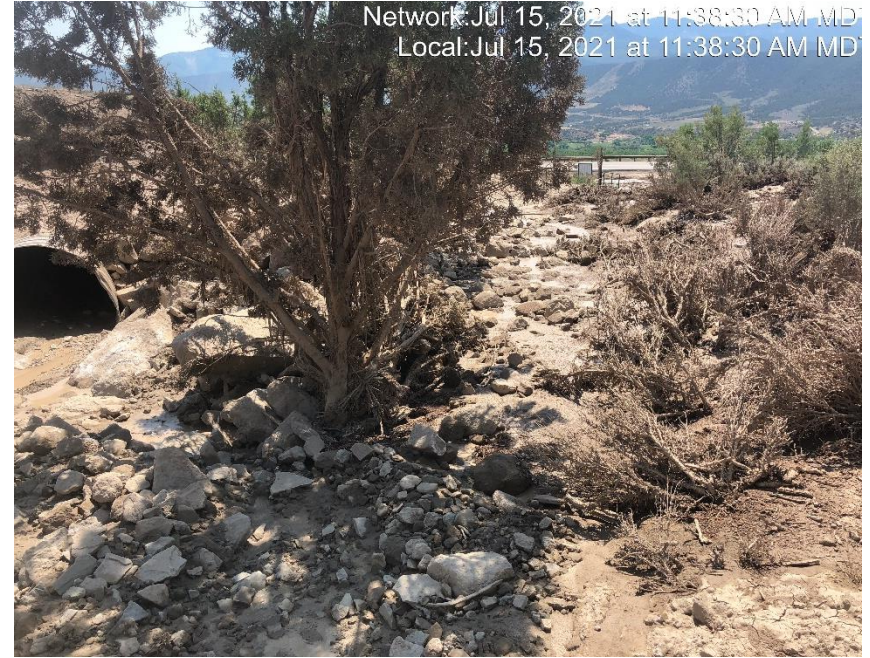
Photo #4446 Storm water diverted to the right of culvert once the culverts capacity was exceeded.