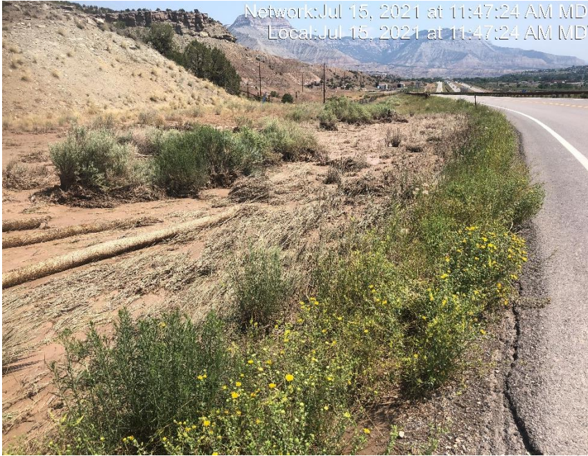
Photo #4456 Diverted path of storm water once the culvert under HWY 6 was over run.