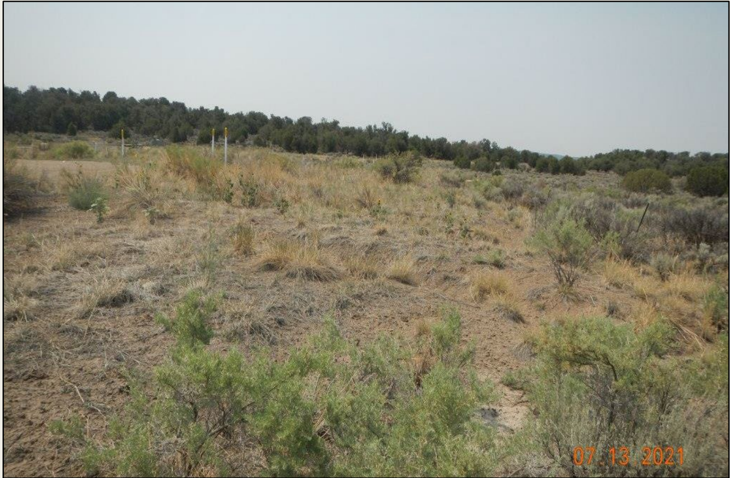
Photo 3. View of the western project area from the northwestern corner facing southward.