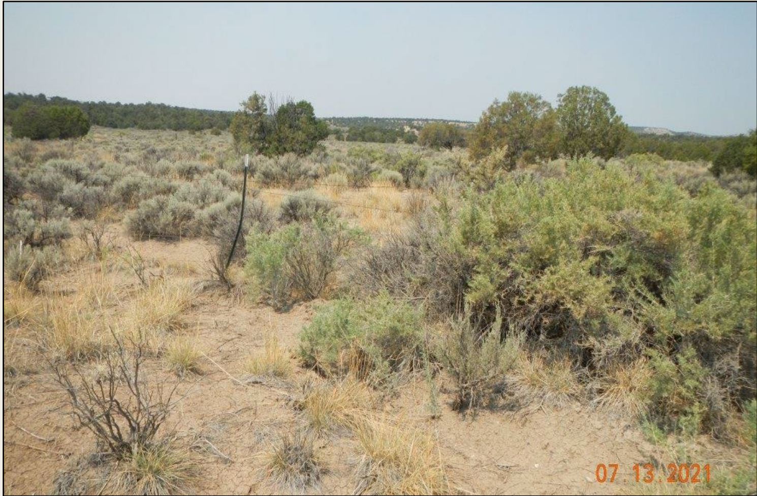
Photo 5. View the reference area comprised of sagebrush shrubland and pinyon/juniper woodland with understory of squirreltail, greasewood, and threadleaf sunflower.