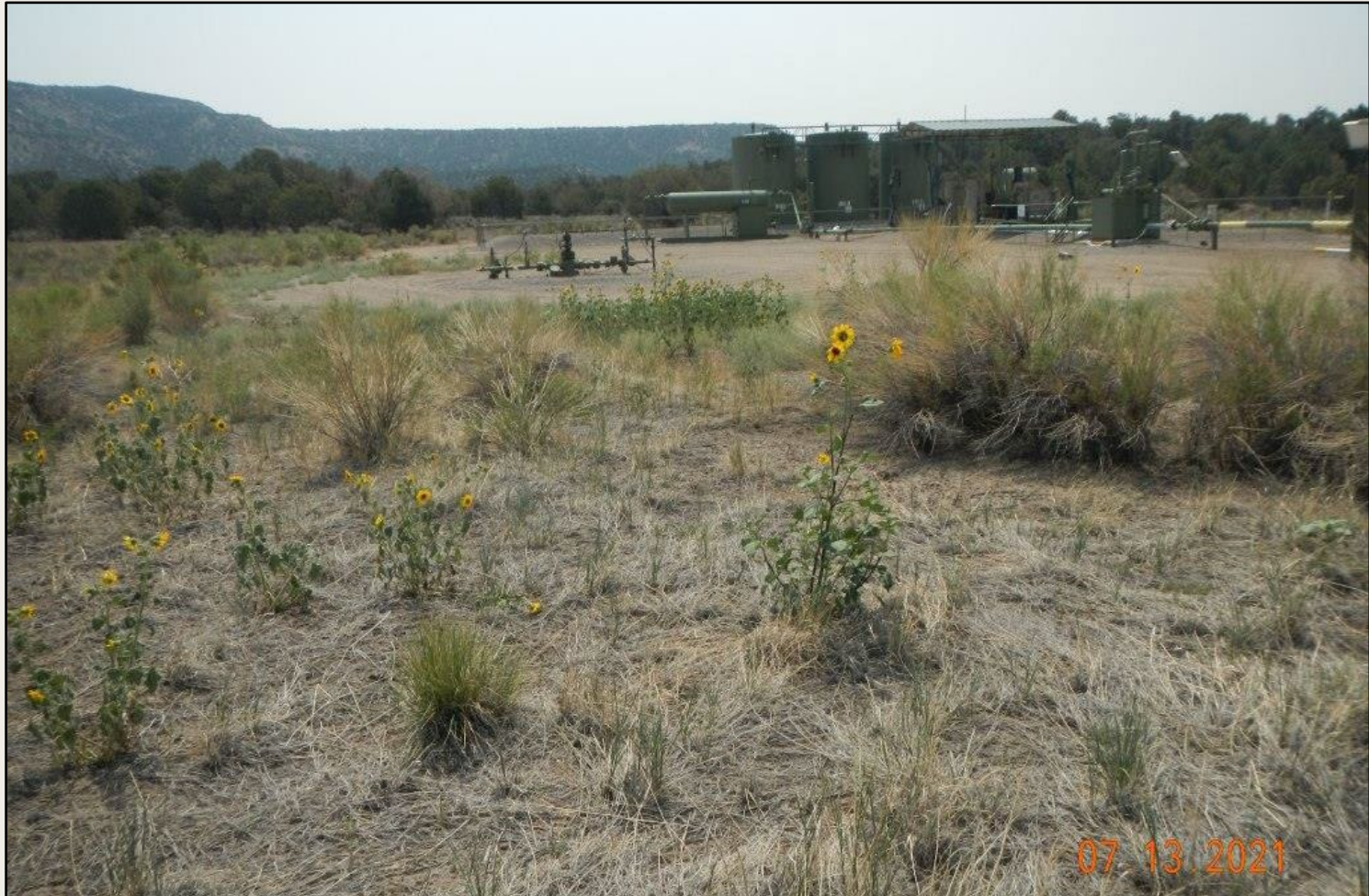
Photo 1. View the project area from the northwestern corner facing center.