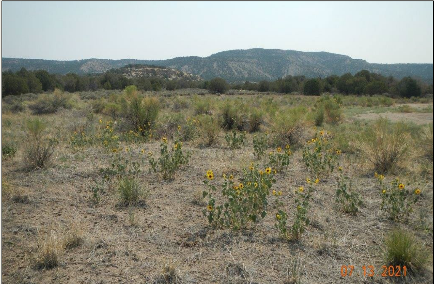
Photo 2. View of the northern project area from the northwestern corner facing eastward. Revegetation is progressing with western wheatgrass, crested wheatgrass, and rubber rabbitbrush.