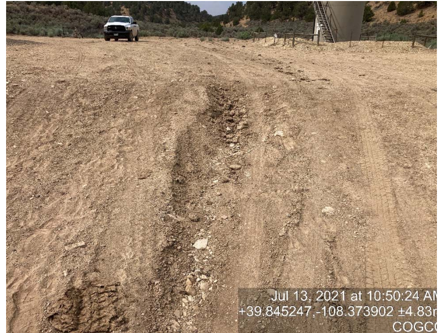
Erosion through berm at entrance of location