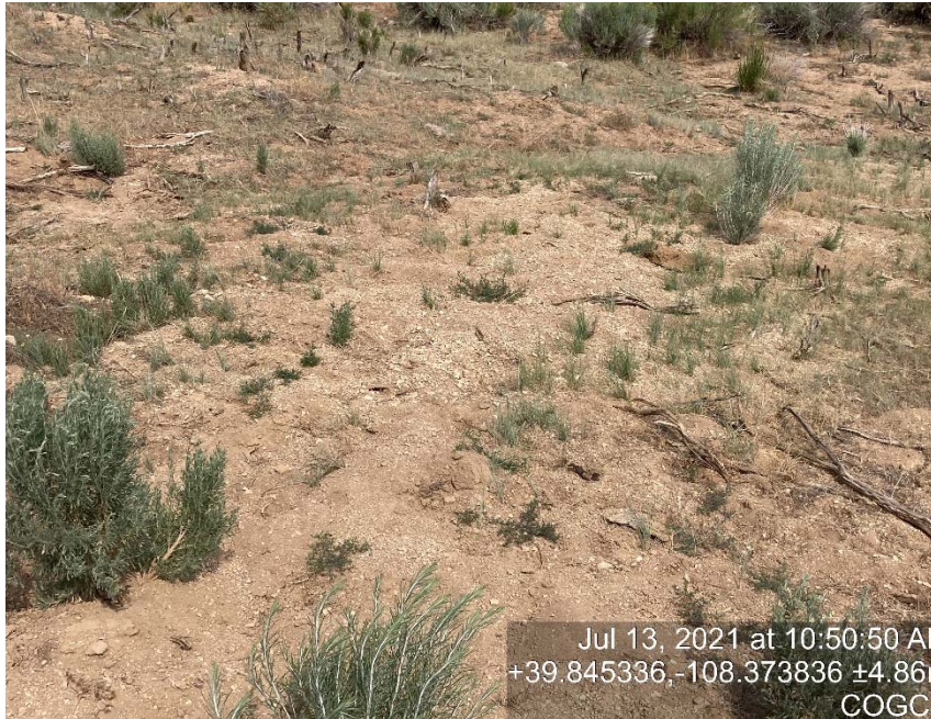
Sediment migration from location