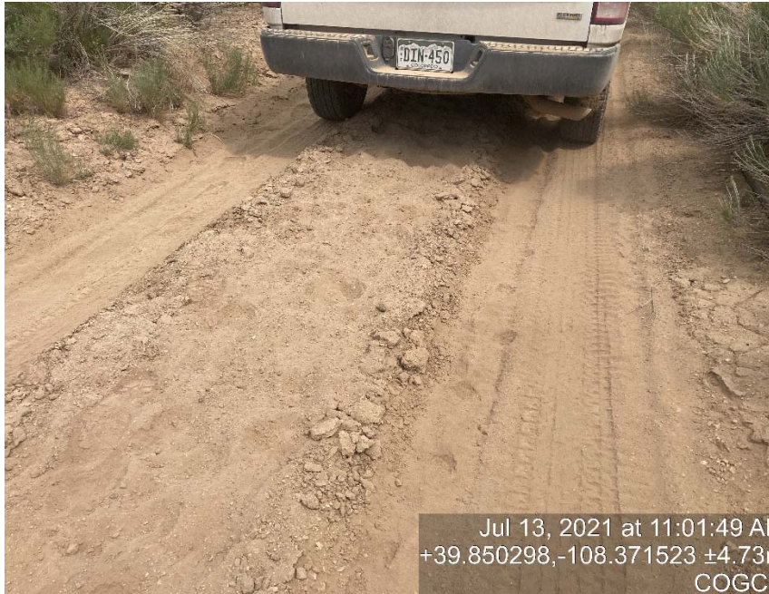
Lack of stabilization/compaction