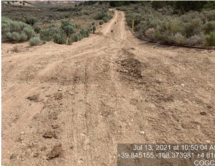
Erosion through berm at entrance of location