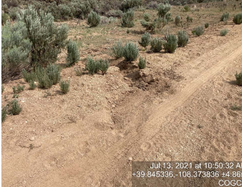
Erosion channel just off of location entrance