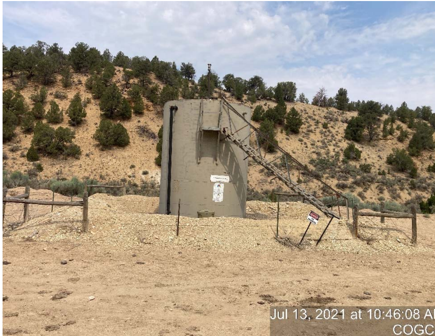
Location/ lack of battery signage