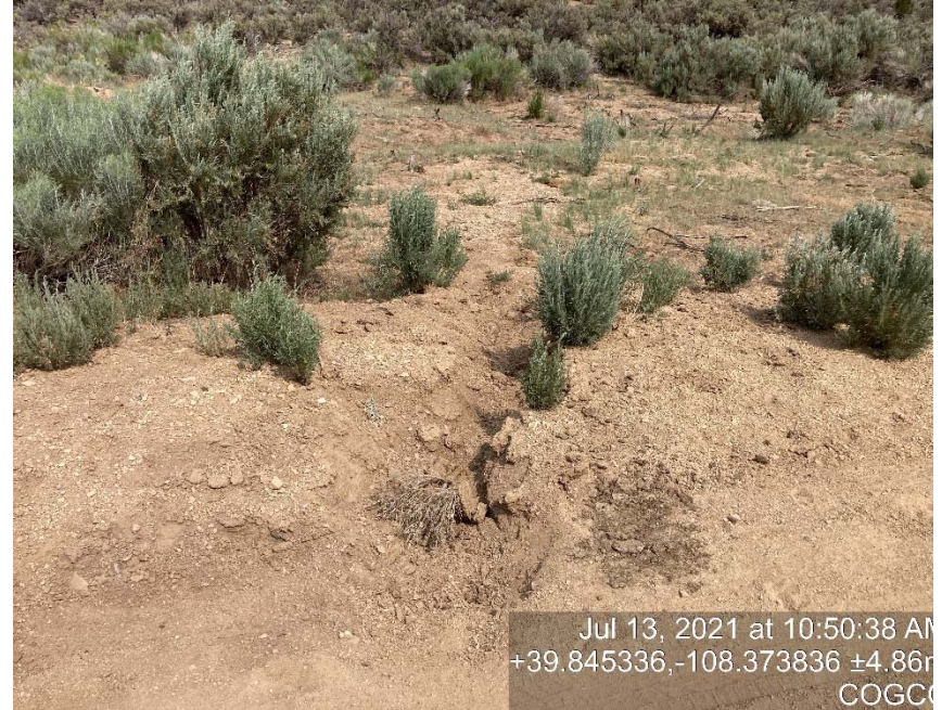
Erosion channel just off of location entrance/ Sediment migration from location