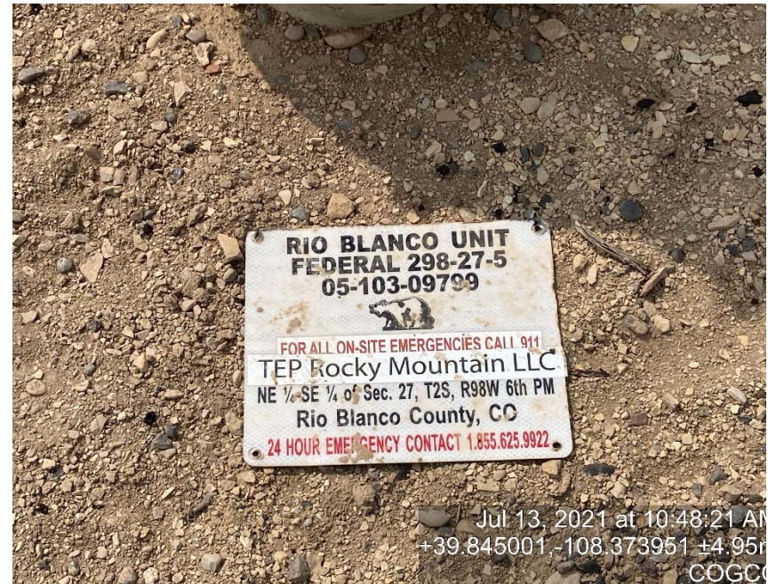
Well head sign on ground