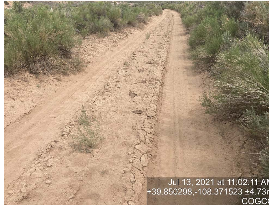
Lack of stabilization/compaction