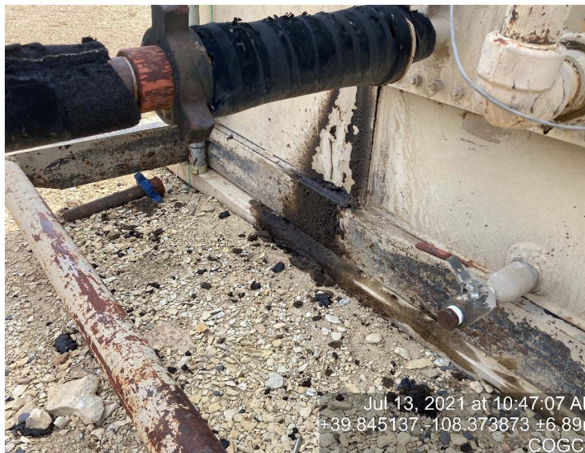
Debris and possible leak