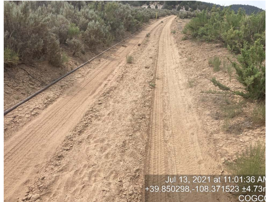
Lack of stabilization/compaction