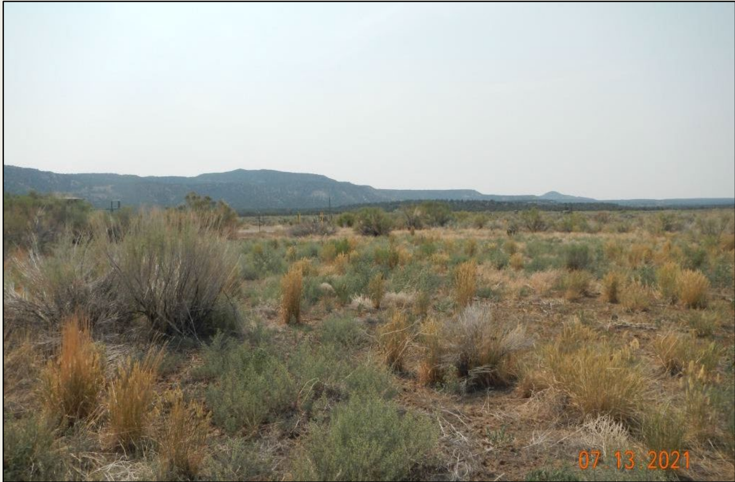
Photo 2. View of the western project area from the northwestern corner facing southward. Revegetation is progressing in portions with squirreltail, rubber rabbitbrush, and crested wheatgrass. Other portions remain sparse and weedy and need re-seeding