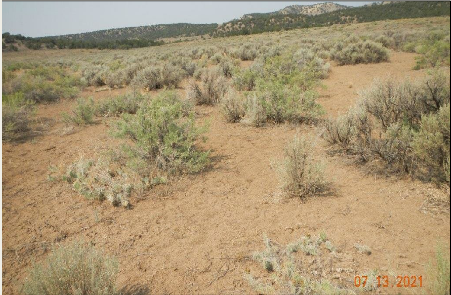
Photo 5. View the reference area comprised of pinyon and juniper woodland with understory of prickly pear, squirreltail, sagebrush, and gambel oak.