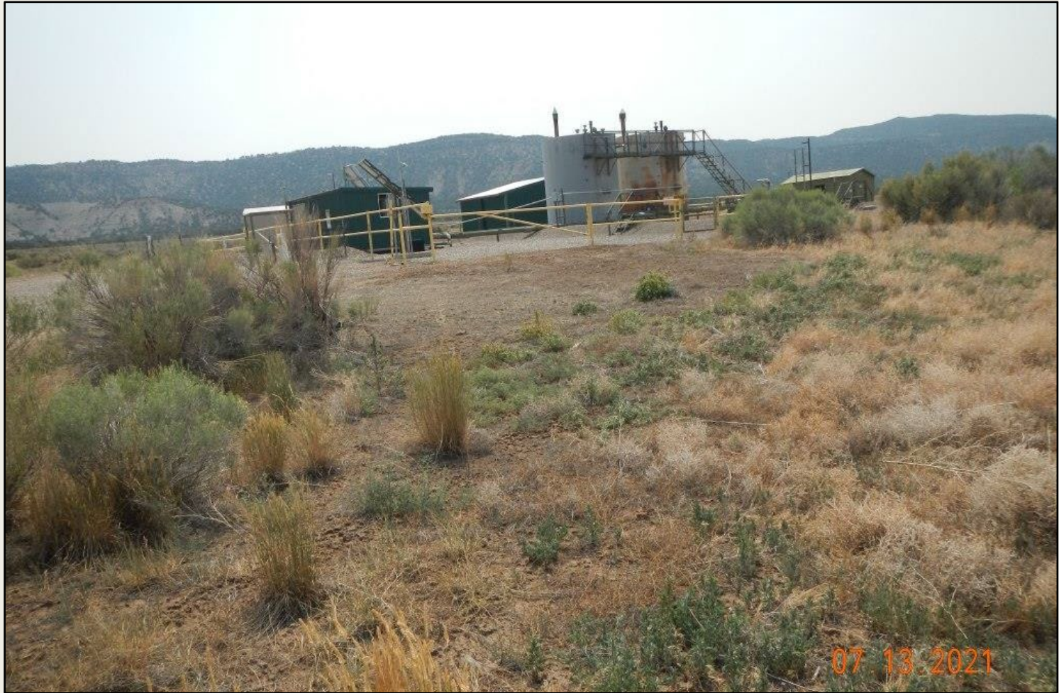
Photo 1. View the project area from the northwestern corner facing center.