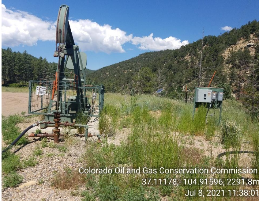
Photo 3 5-12 well head