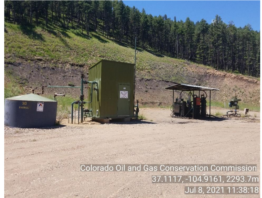
Photo 4 5-12v production equipment.