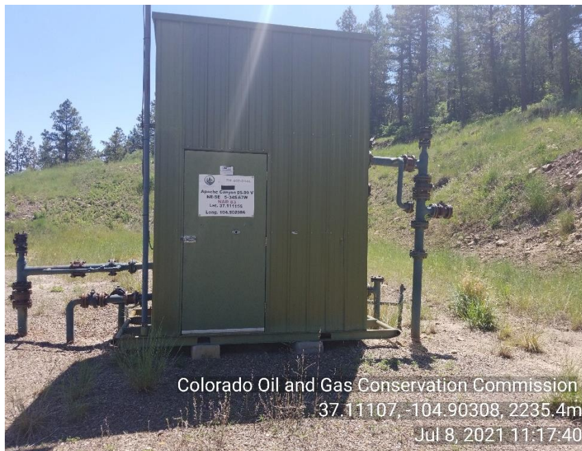
Photo 5 AC 5-09v sep and well head sign