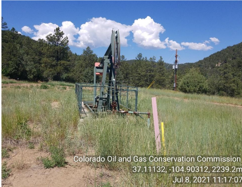
Photo 3 AC 5-09 well head