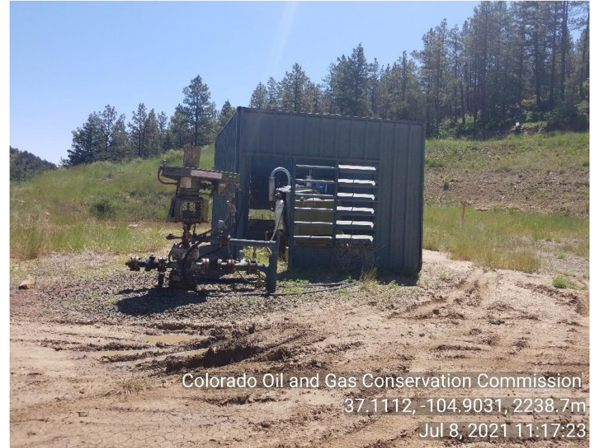
Photo 4 AC 5-09V Well head and motor skid