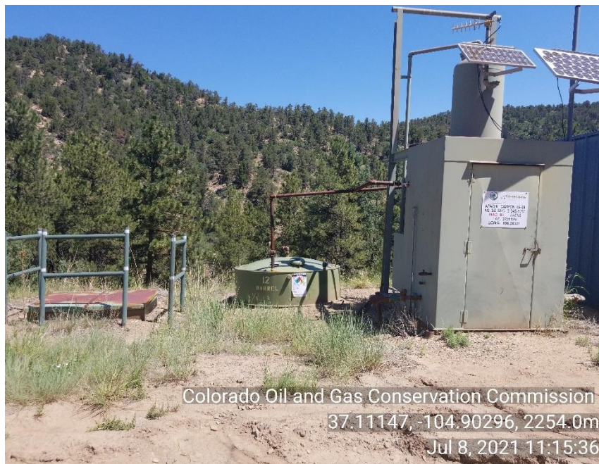
Colorado Oil and Gas Conservation Commission 37.11147, -104.90296, 2254.0m Jul 8, 2021 11:15:36