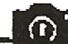
Photo Safe Deposit® Engrave on back