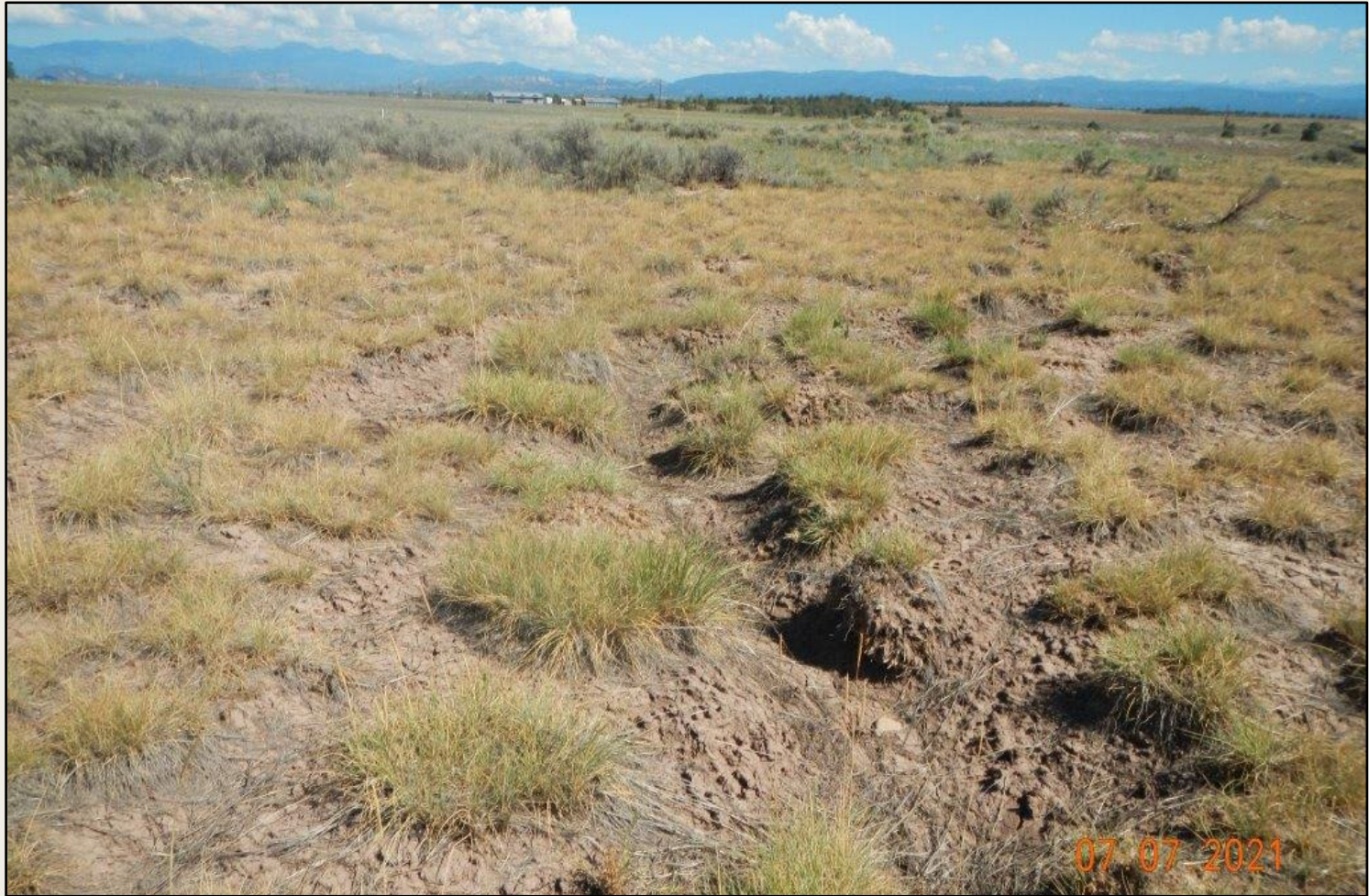
Photo 3. View of erosional channel forming (approximately 12 inches deep and 12 inches wide) within the northern project area.