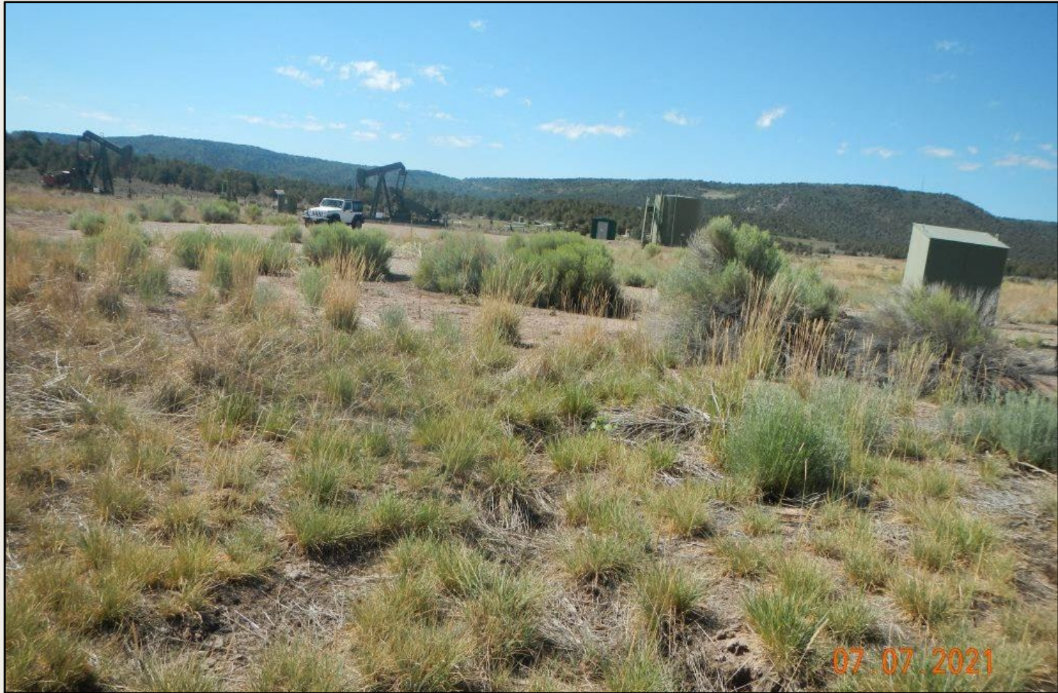
Photo 2. View of the northwestern project area from the northern corner facing southwestward. Revegetation is progressing with crested wheatgrass, western wheatgrass, and rubber rabbitbrush.