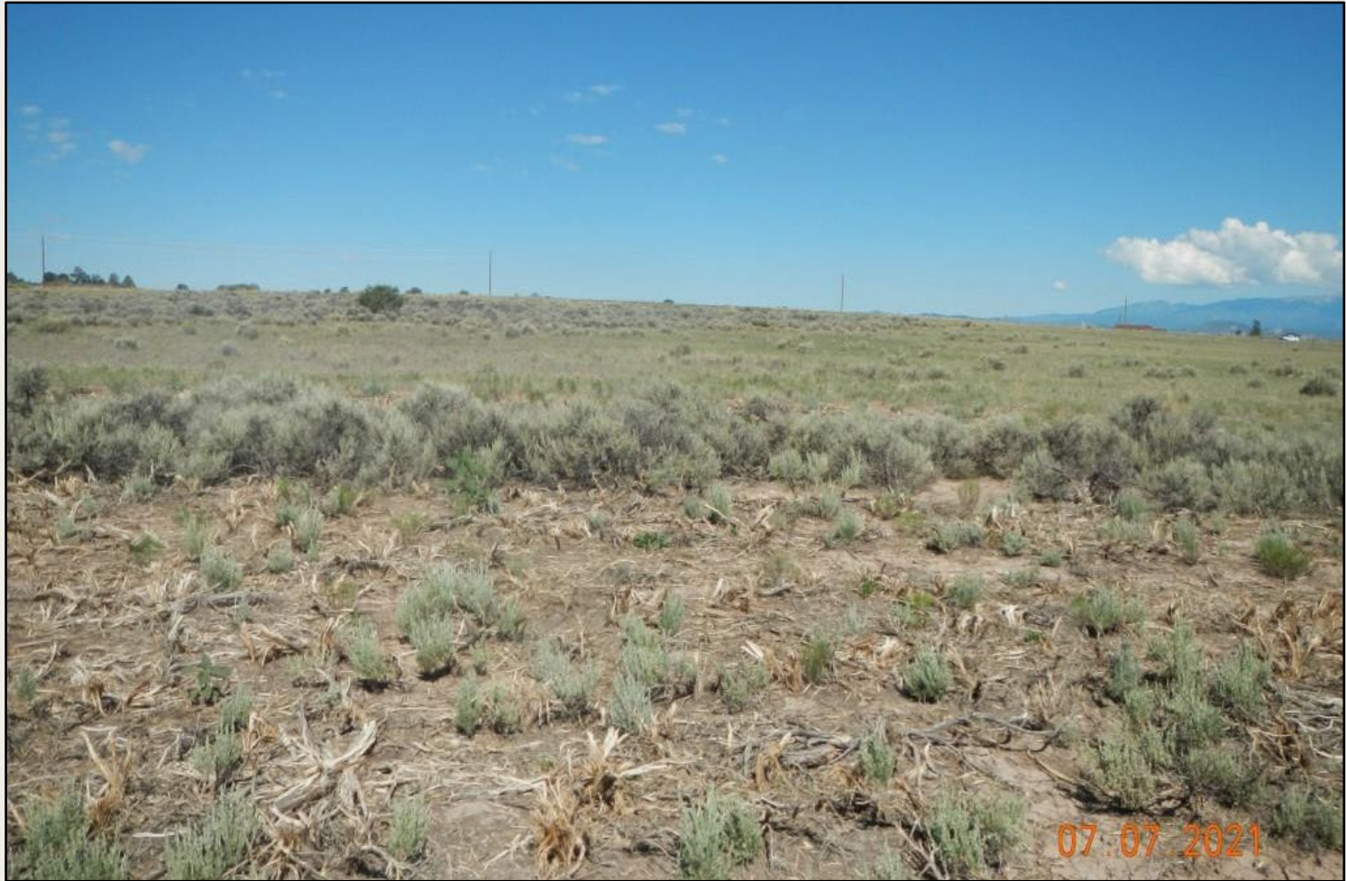
Photo 5. View the reference area comprised of sagebrush shrubland with understory of western whatgrass, squirreltail, and sunflowers.