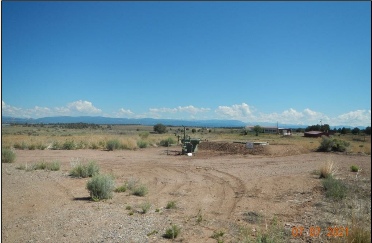
Photo 1. View the project area from the southern entrance facing center.