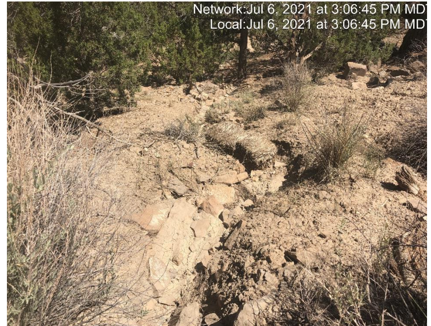
Photo #4334 Gully erosion continued. Velocity checks insufficient.