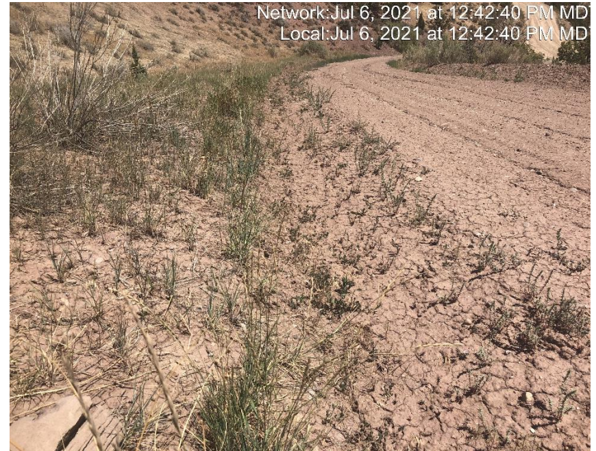
Photo #4309 No form of velocity check located in access road ditches.