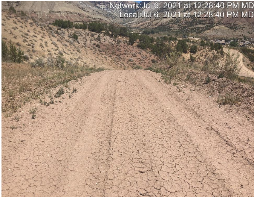
Photo #4307 No form of tracking BMP located at entrance to location.